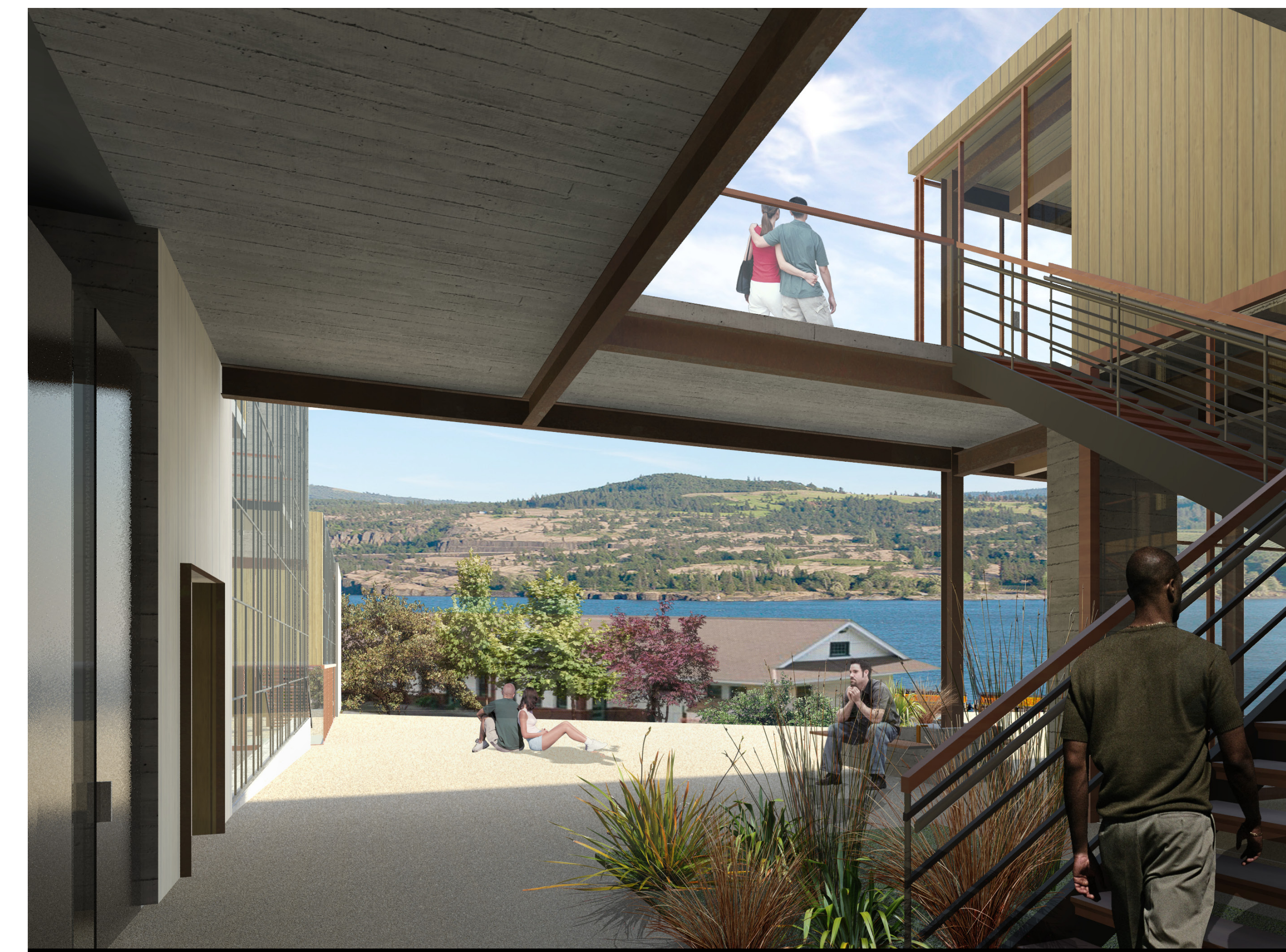
VIEW THROUGH STOA GARDEN