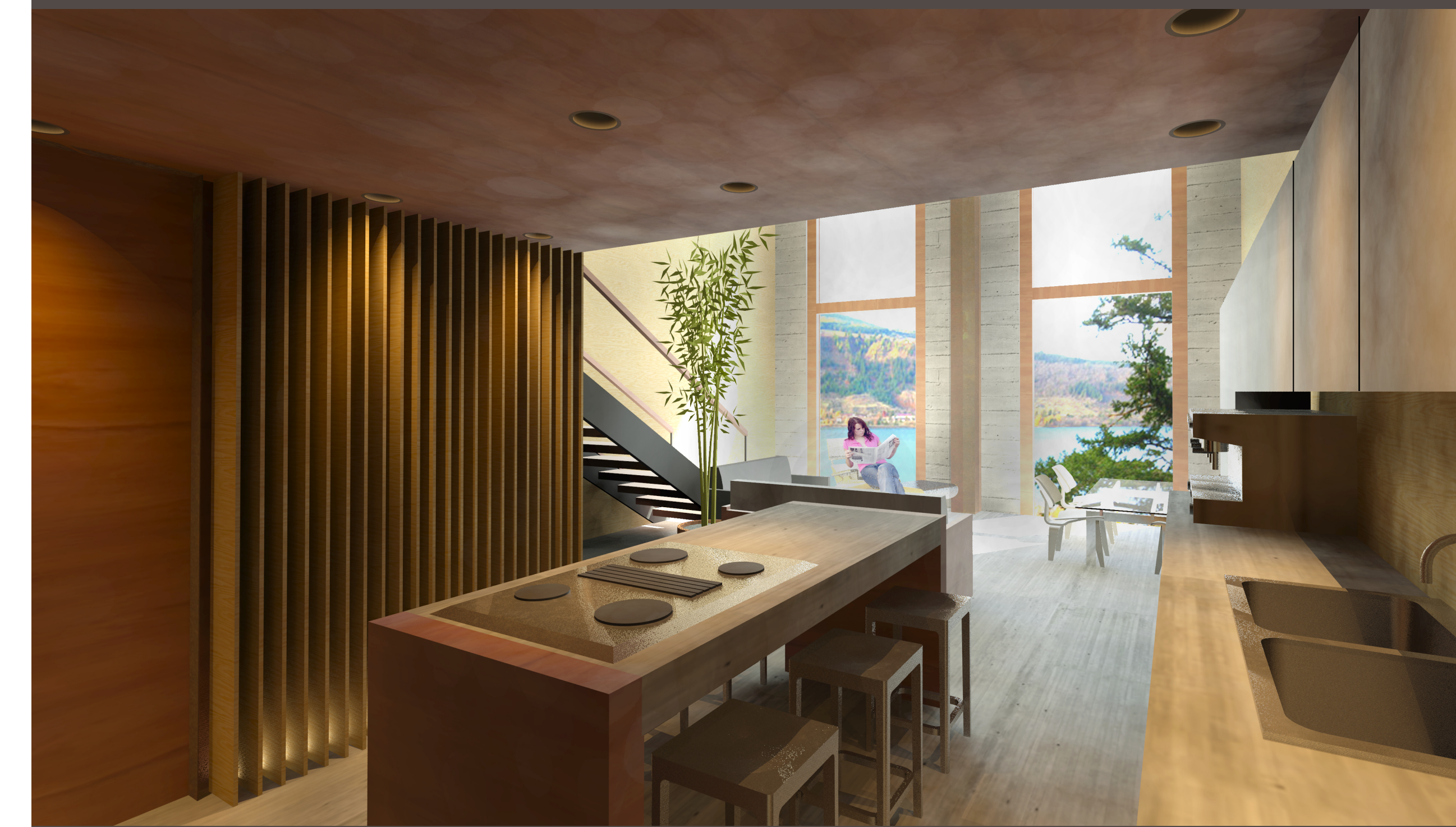
BREWER'S TOWER RESIDENCE