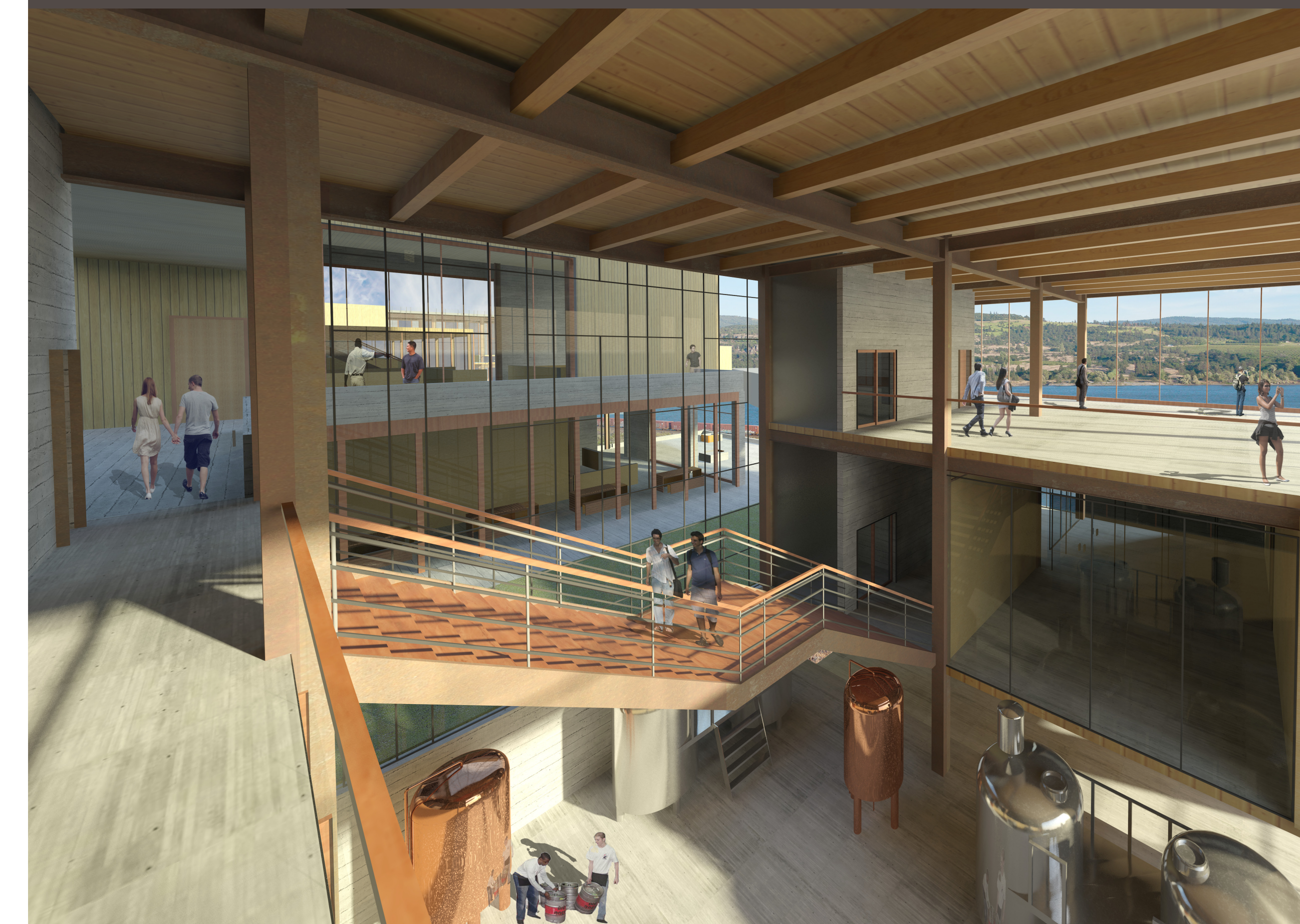
GRAND STAIR AND VIEWING DECK