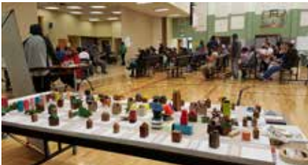
Image 3: Scale model for Participation by Play.

The main goal of the outreach project was to empower Latino community members to define their own planning and public policy priorities. In contrast to traditional methods of outreach, “Participation by Play” fosters open-ended discussions and story-telling. By using a scale model of the local area and hundreds of repurposed craft pieces and toys to represent different aspects of the city, it allows individuals to engage less formally. “Participation by Play” unleashes creativity and allows participants to relay their experiences and define the issues most important to their lives.