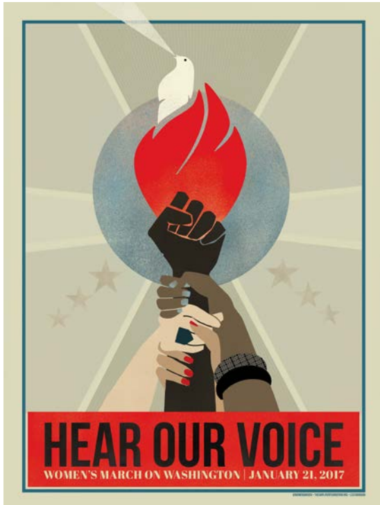
Figure 1 "Hear Our Voice" by Liza Donovan