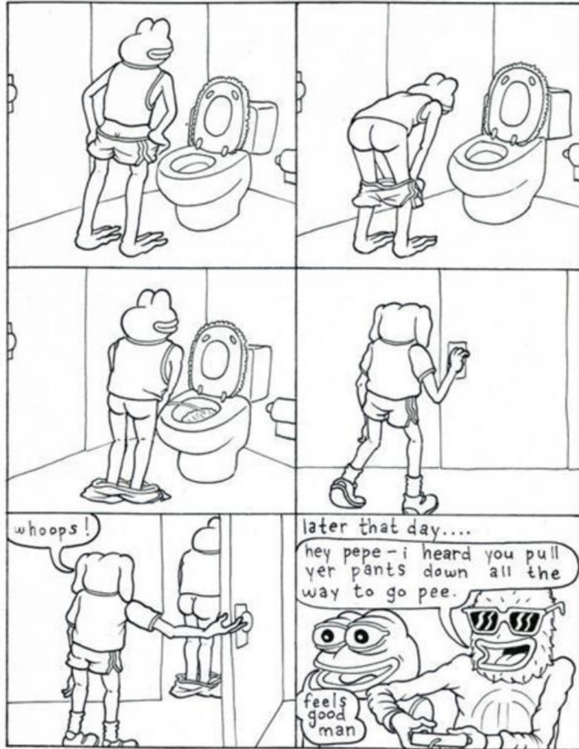
Figure 9. Commonly shared page of Pepe the Frog from the comic Boy's Club by Matt Furie featuring “feels good man.” Matt Furie, Boy's Club (Seattle: Fantagraphics, 2016), 42.

As memes that show up on humor-focused online message boards tend to operate, the Pepe character's face and statement of “feels good man” was removed from its context and continuously remixed. Pepe himself was reworked into various forms with various moods, including a “sad Pepe” and a more smug variation, transforming the original body humor into an ongoing humorous engagement with the character. Worth noting here is