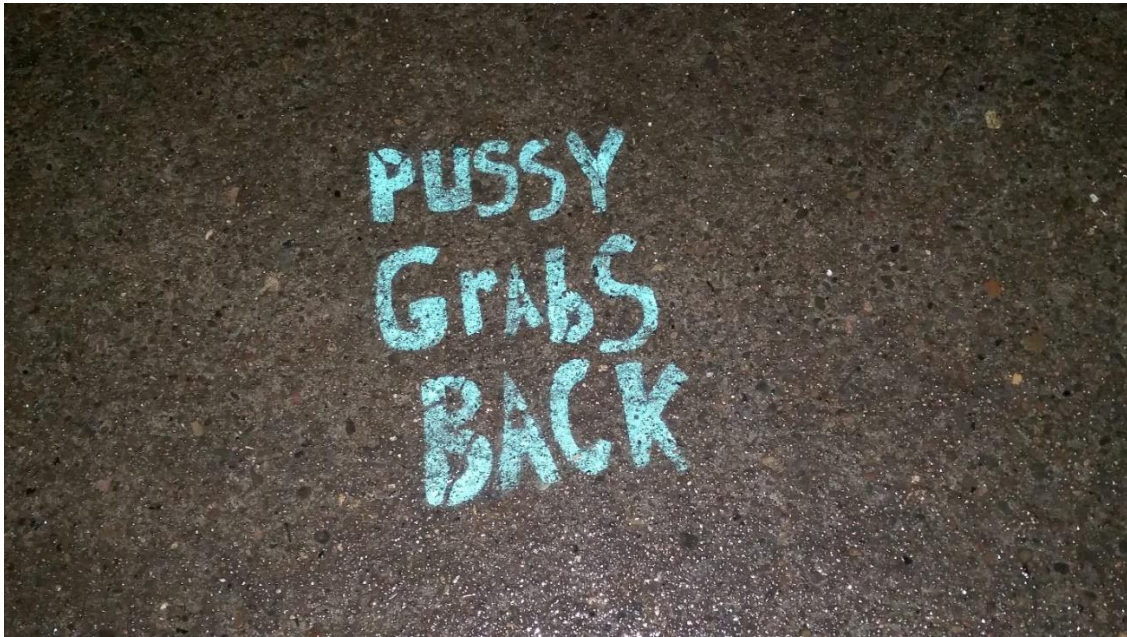
Figure 3. “PUSSY GRABS BACK” graffiti on a sidewalk in Eugene, Oregon. at the intersection of Blair Ave. and 4th Ave. during winter 2017.

The humorous reappropriation and transformation of Trump’s slogan is thus, like the Guerilla Girl’s “The U.S. Homeland Terror Alert System for Women,” an intelligible practice even as it powerfully refuses countering Trump’s through polite debate and straightforward, measured discourse. In a few paragraphs I will explain why this refusal is so important, and how this distinguishes humorwork as a political practice (or feminist praxis, to add an additional burden of jargon), but for now I primarily aim to highlight this pattern.