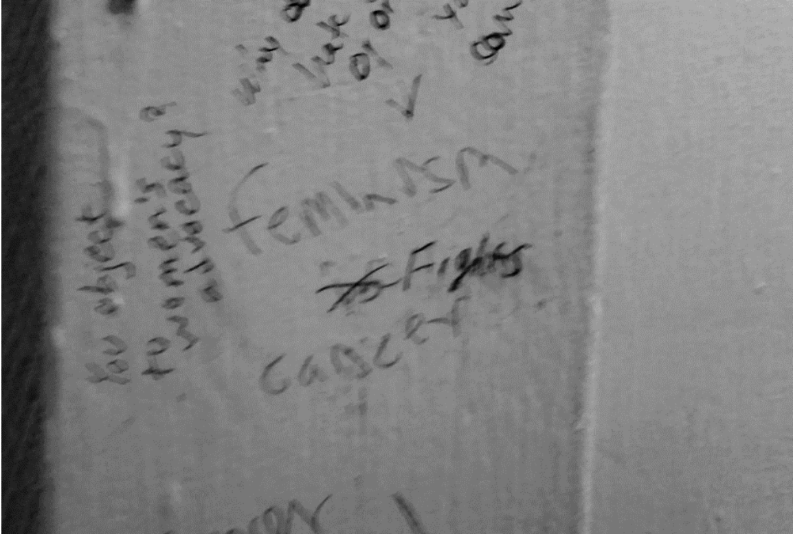
Figure 6. “Feminism Fights Cancer” graffiti in a coffee shop bathroom. Taken by the author in Eugene, Oregon during spring 2017.

Other times this disruption occurs at the same time as a new context or new message settles into the disrupted space. Even though when a trap is placed, it often makes it so "the text unravels," this disruption is also able to contribute to "overall cohesion," 435 the disruption completely shifting the text into an unexpected, yet cohesive formations. The Guerilla Girls simultaneously disrupt the messages of the government-issued Terror Warning System while concretizing their own feminist and anti-imperialist message.