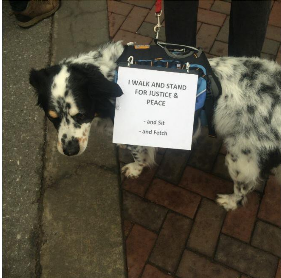
Figure 4. “Protestor pup” photographed by user @arzesux on Twitter during the 2017 Women’s March. Arzesux, Twitter post, January 21, 2017, 12:33 p.m., https://twitter.com/arzesux/status/822905013332799488/ .

FOR JUSTICE AND PEACE...” which then leads to the more light-hearted “...- and Sit / -and Fetch.” 423