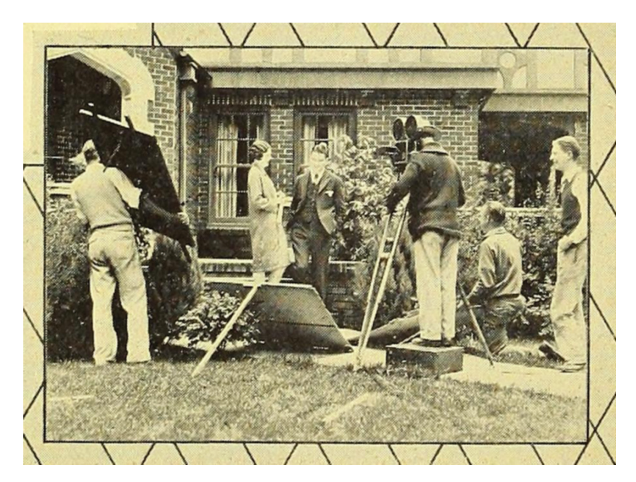
Fig. 4: Use of multiple reflector boards in Ed's Coed (Movie Makers 5, no. 6 [June 1930]: 352)

Second-unit cameramen often have the authority to search for shots—to wait for the light—and throughout the film McBride appears to have strategically utilized the campus environment to create images that further the narrative, while simultaneously enhancing pictorial beauty and establishing a mood. The millrace stream at the edge of the campus is the site of several of these types of moments in the film. The millrace was built at the turn of the twentieth century as an industrial transport system in Eugene to bring lumber and other goods to the mills and trains downtown. By 1929, however, the millrace had shifted in purpose to become a place for canoe parties, tug-of-war competitions, and amorous encounters.