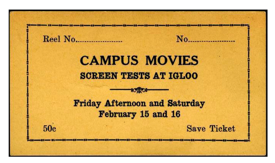
Fig. 11: Ticket for student screen test. (University Archives Photographs, UA Ref 3, Special Collections and University Archives, University of Oregon Libraries, Eugene, OR)

to generate a snarky review, that is, publicity piece, in the college newspaper, the Oregon Daily Emerald . The audience "hissed and booed and clapped and hollored [ sic ]." One aspiring actress was described as "the most pathetic looking face that ever a child who had been beaten and starved could have." According to the anonymous reviewer, the men looked better on film than the women "possibly because [the men] were large and most of the girls looked too thin."