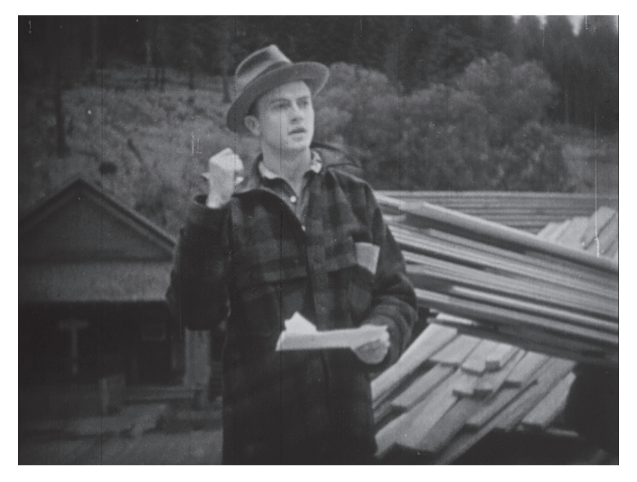
Fig. 10: Ed, "tall and straight as a Douglas fir," at his sawmill.

At the same time, as a proudly "Oregon-directed, Oregon-filmed, Oregon-acted motion picture," Ed's Coed is coupled with a specific regional landscape and adheres to the focus on local settings and topics characteristic of many amateur films.<sup>49</sup> The University of Oregon campus in Eugene is located in the fertile Willamette Valley, midway between Portland in the north and Medford in the south. In 1929 with a population of 18,000 people, Eugene was the third-largest city in the state after Portland and Salem.<sup>50</sup> The city's economy relied on rich and extensive agricultural and timber industries. Approximately a hundred saw-mills were located in the region, and Oregon was second only to Washington in nationwide lumber production in the 1920s.<sup>51</sup> The timber industry is an implicit and explicit component of the Ed's Coed story, with young Ed actually the owner of a small sawmill. The film's opening scene takes place at his mill, which, according to the intertitles, is "gnawing in its small way into the vast forests of Oregon" (fig. 10).