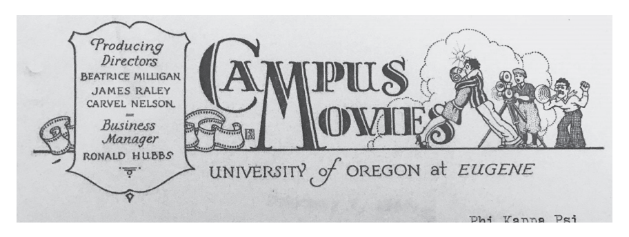
Fig. 2: Campus Movie letterhead from stationery used to write to Cecil B. DeMille.

By early February, the production personnel had swelled to over fifty students—although they still lacked anyone with actual experience in shooting a film—making Ed's Coed a truly collaborative amateur venture. While this sizeable team was largely structured to mimic the specialized labor divisions of the Hollywood studio system—with crew assigned to specific roles in costuming, props, publicity, and so on—the unusual triumvirate of the film's producing directors also indicates a more amateur and democratic process. In generating the script, students purposefully set the film in their own geographic location and incorporated a wealth of locally specific details.<sup>28</sup> However, the University of Oregon students didn't want to make an insular local movie; on the contrary, they aspired to make a popular feature-length narrative fiction film that would