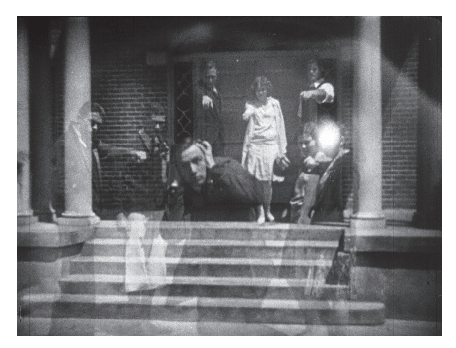
Fig. 8: Driven mad by guilt

follows a standard boy-meets-girl narrative and delivers a happy ending, but the story also reflects McBride and the student-producers' awareness of the generic limitations of the well-established Hollywood college-life film.