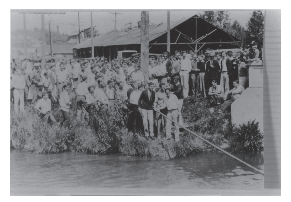
Fig. 12: Dozens of student extras fill the background of tug-of-war scene.

Student filmmakers' access to publicity in their university's newspaper was not unusual for college filmmakers of the era, and these student-run papers offer a potential wealth of information about student film production in this era. But the Oregonians proved unusually adept at drawing attention to their film from far beyond Eugene and Oregon. The film was mentioned multiple times in Movie Makers , whose regular monthly column on the activities of amateur clubs often featured Ed's Coed during the spring and fall of 1929.<sup>69</sup> Again, other college film clubs also received occasional write-ups in the amateur-oriented magazine; however, few, if any, others were able to break into national trades like Variety and fan magazines, including Photoplay , one of the period's most