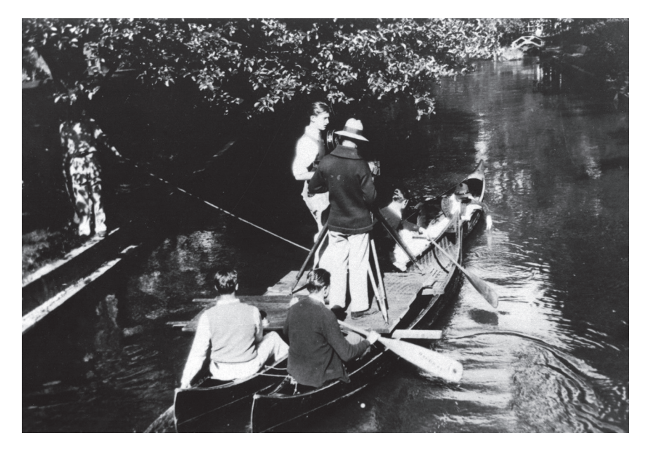
Fig. 5: Shooting on the millrace.