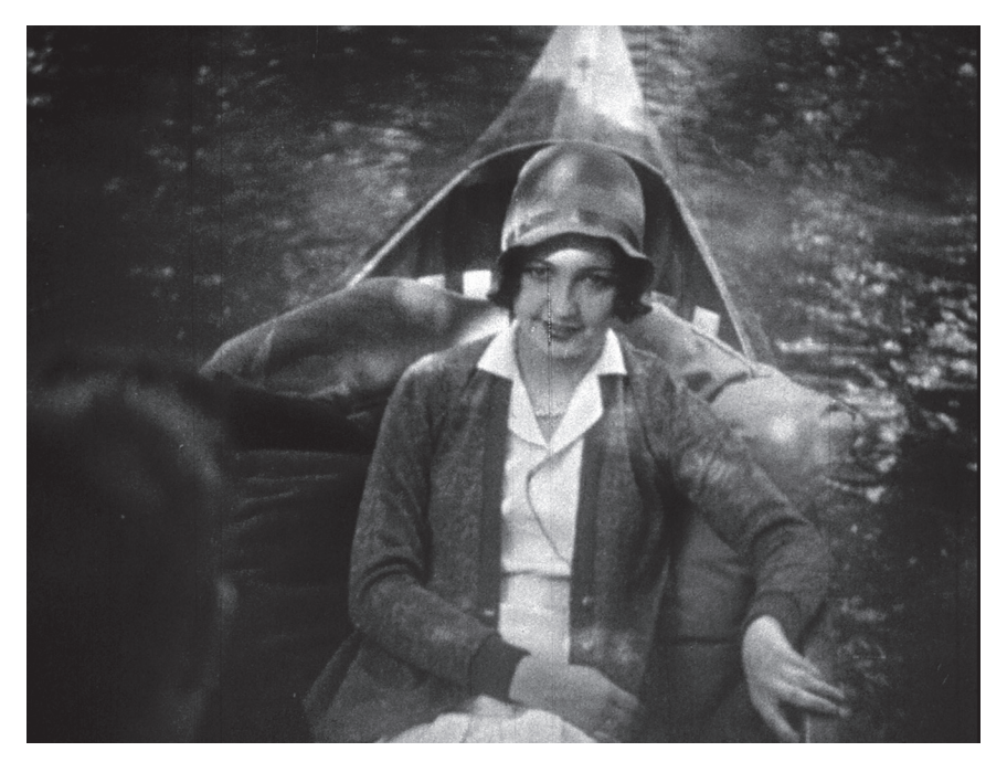
Fig. 6: Millrace