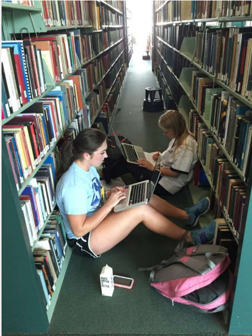
Students sitting on the floor between book stacks in the Wimberly Library

At all other times, the space was accessible only to those staff who had a special key or fob that would allow the elevators to go to the 5th floor. With the rest of the library being so heavily used, with students having to sit on the floor between book stacks at times,