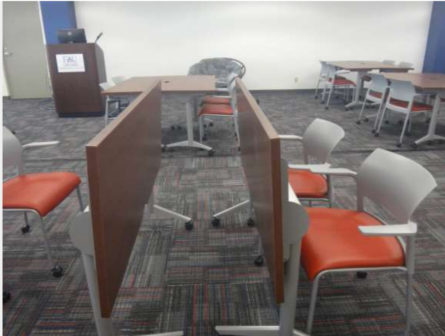
Tables fold up and stack to reconfigure the room quickly for presentations

The study furniture is designed to be stacked and quickly moved out of the way when lectures and presentations are planned. The back wall and podium (shown in the image below) are in place for talks and for projecting presentations.