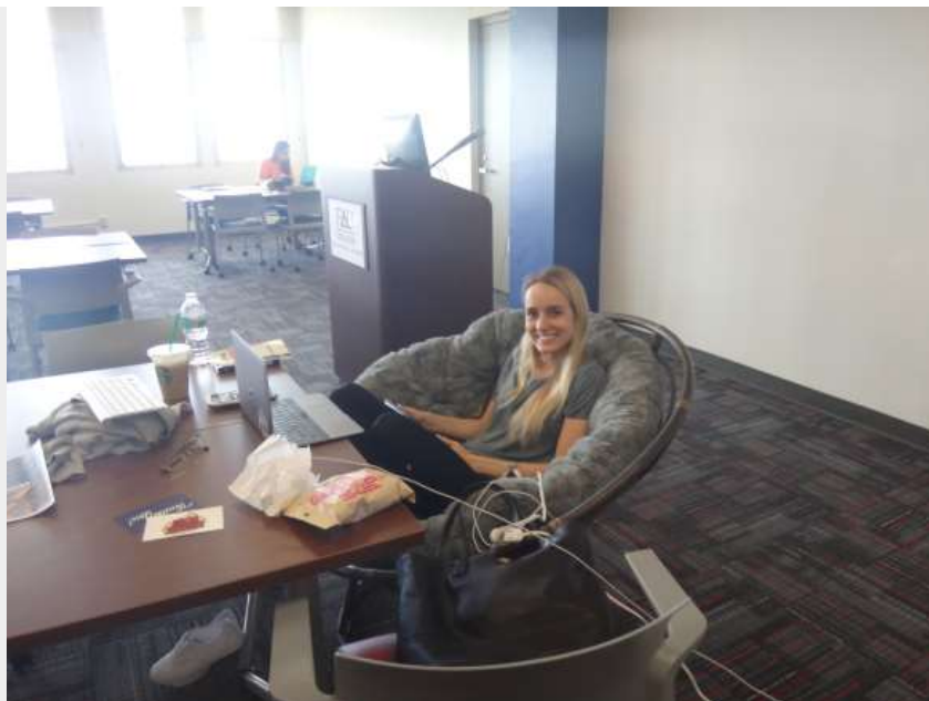
Student making herself at home in the new space

On opening day of the new space, students immediately began to take advantage of the new space and make themselves comfortable, as we hoped they would.