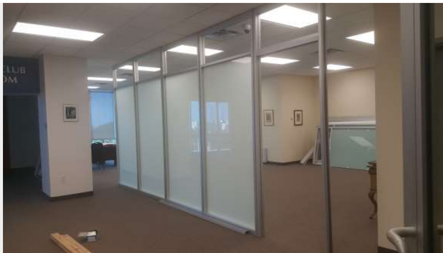
New hands-on instruction lab for Special Collections under construction

The next phase of the fifth-floor transformation will focus on redesigning the Weiner Suite and University Club boardroom to provide better exhibit space, a multi-purpose videoconferencing meeting room, and a lab where students can receive hands-on opportunities to work with Special Collections materials. Work is already underway, with the walls of the lab being built and the former board room being redesigned.