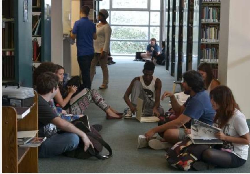
Students creating their own group-study space on the floor in another part of Wimberly

and they are trying to get access to the limited number of power outlets in a facility that was built before everyone had a computer or other device that needed power to run.