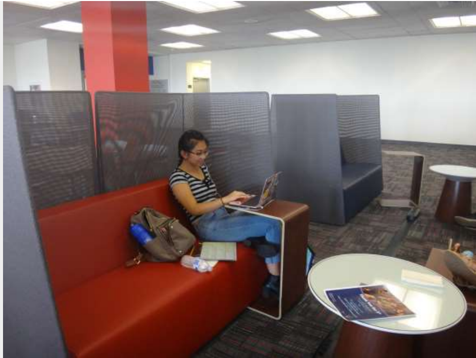
Comfortable booths with lightweight privacy screens