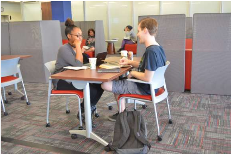
Examples of individual and group seating areas now available