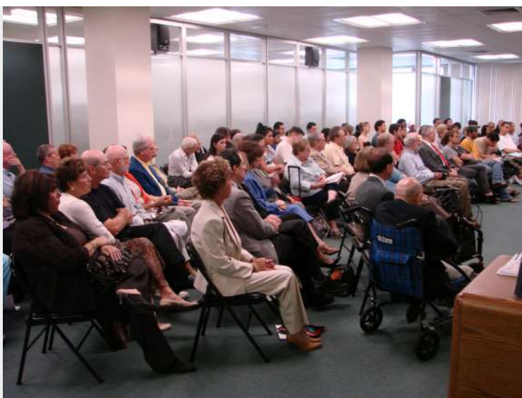
Crowded seating during an event held in the fifth floor prior to the renovation

When events were previously held in the open space, there was limited, cramped seating and staff always had to unlock the elevators to allow people to come to the event and then relock the elevators after the event was finished.