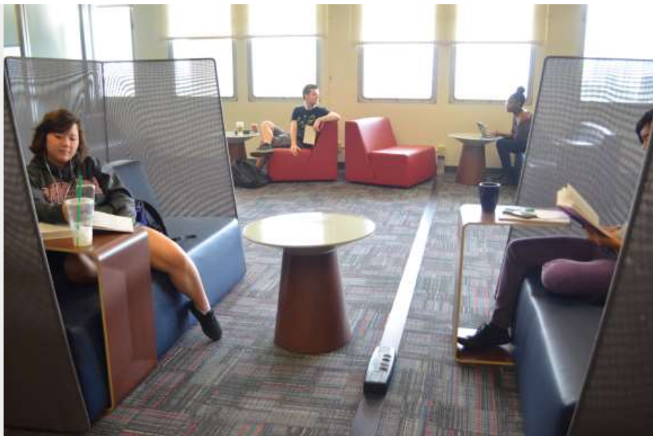
New seating areas that take advantage of natural light