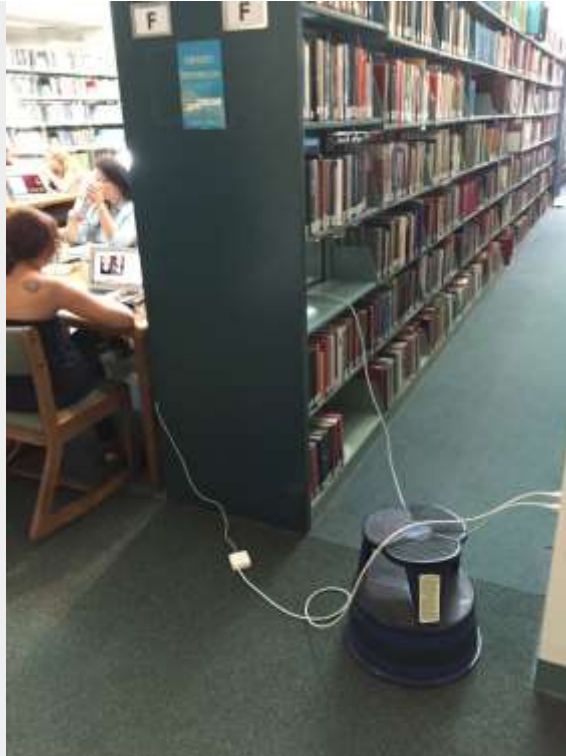
Students cluster around power outlets in other parts of Wimberly

and they are trying to get access to the limited number of power outlets in a facility that was built before everyone had a computer or other device that needed power to run.