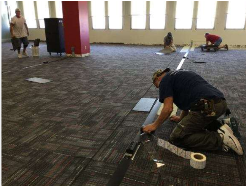
Installation of new carpeting and under-the-floor tracks that provide expanded access to power