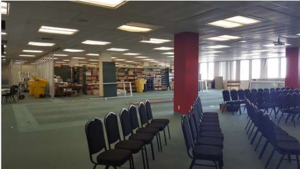
During the renovation, lines on the old carpeting show where the glass walls used to be

A subset of the Libraries’ Space Allocation Committee , led by Special Collections department head Vicky Thur, worked closely with me and with the University’s Design and Construction Services staff, under the leadership of Director Numa Rais, to design the space, review flooring and furnishings, and oversee the project details. Before work could start, collections had to be de-duped, consolidated, and reorganized. Staff work areas were also consolidated to align better with their functions, and unused furniture and equipment were removed. A glass wall was pushed back (shown in the image below) and the open floor space was increased from 2166.72 square feet to 4362.72 square feet.