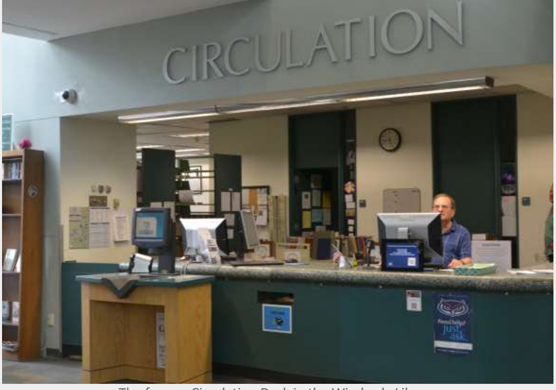
The former Circulation Desk in the Wimberly Library

On October 12, we also opened the new Diversity Burrow in its permanent home, just across from Dunkin Donuts on the first floor. The space used to be the home of the former Circulation Desk (shown below)