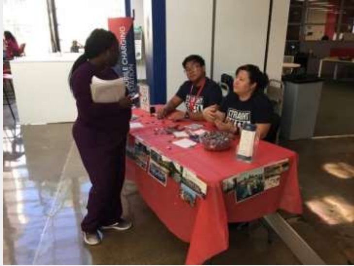
Pre-COVID19 introduction to ILL services in the lobby of the Boca campus library