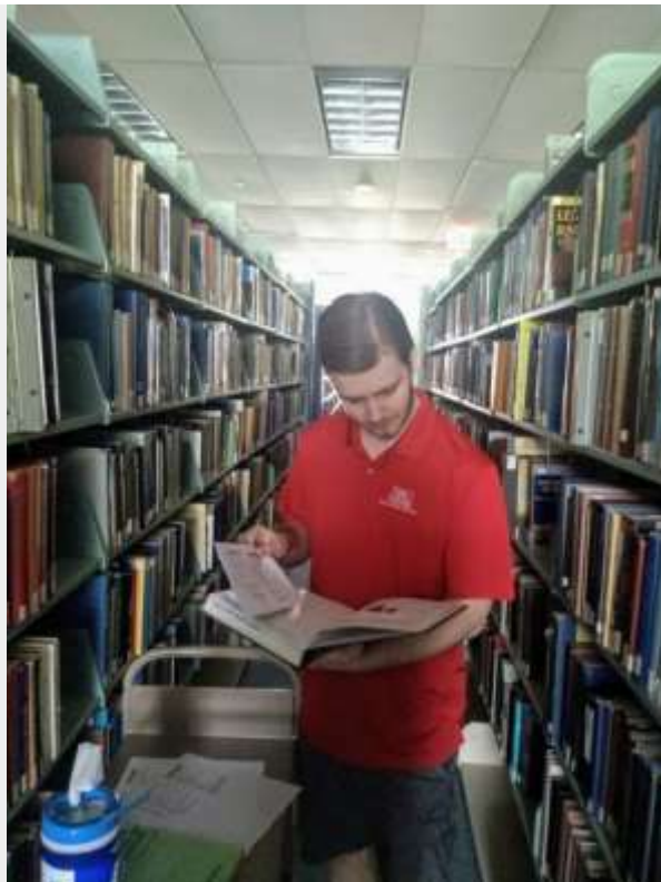
ILL staff member retrieving a book from the stacks for curbside delivery

When libraries around the world shut down due to the pandemic, the network that has been built up over decades to share books and other materials between libraries on behalf of their patrons also shut down. Under pre-COVID19 conditions, the FAU Libraries Interlibrary Loan (ILL) Department took pride in going the extra mile to obtain materials from all over the world for FAU's faculty and students, including from all seven continents. It's a testament to just how good our ILL staff are that we have had to explain to some faculty why we could no longer get that book they wanted from a library in Spain! While our staff are amazing, they haven't yet figured out how to get books from closed libraries on the other side of the world.