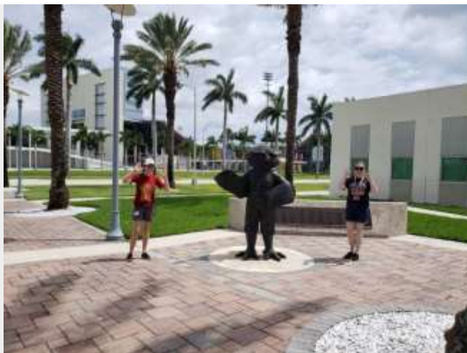
ILL staff practicing safe social distancing

With most of the world's libraries closed, it has been challenging to find libraries who can fill some of our digital borrowing requests, but they have. The staff liken themselves to ILL Commandoes, doing what needs to be done to get what our patrons need.