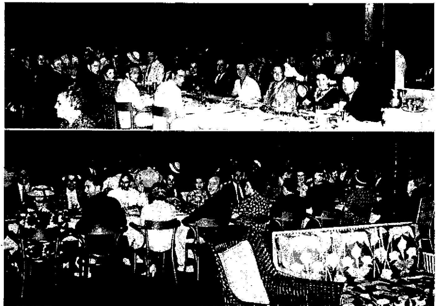
Several hundred Oregon alumni gathered in Honolulu to form the new Hawaiian alumni association. A detailed account of their activities may be found elsewhere on these pages.

It was proposed that the men have a stag party once a year. The sugges-