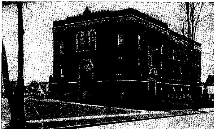
This picture of Condon hall will give the reader an idea of the architectural design contemplated for the new Humanities building which will rise on the Oregon campus during this fall. The building is made possible through a WPA grant of $44,000 and a loan of $66,000.

Construction will probably start within three months. Official proffer of the grant and loan from the PWA is expected by September 1. Construction must start within eight weeks of the date the project is offered.