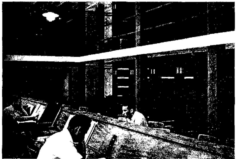
The "old libe" has been completely reconditioned and refurnished to house the University of Oregon law school. The remodeled structure will be named Fenton hall. Below is a scene of one of the study levels where law students will "cram" with all the comforts of indirect-lighting and modern air-conditioning. The library has been named the Kenneth Lucas Memorial Law Library