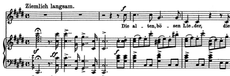
Figure 4.16.1 “Die alten, bösen Lieder,” mm. 1-5

The long-short-short rhythmic pattern in the piano’s bassline evokes the footsteps of the giants, showing Schumann’s descriptive skill (Fig. 3.16.1). In the third and fourth stanzas (mm. 16-35), the bassline is given a thick texture and upward arpeggiated movement (for instance, mm. 16-17, Fig. 3.16.2), reinforcing the poet’s determination to bury his past love.