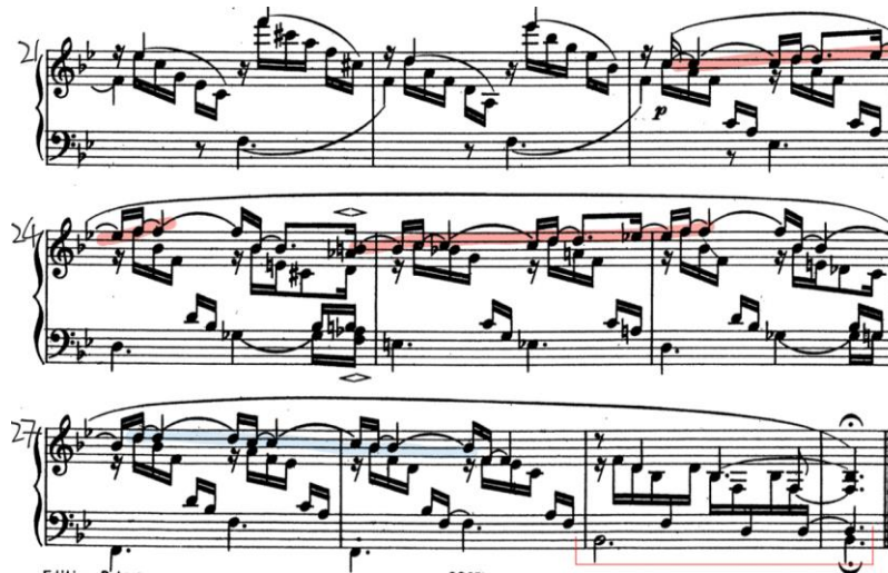
Figure 4.12.3 “Am leuchtenden Sommermorgen,” mm.21-30

It is important to highlight that the pianist must be deliberate while dealing with the arch of crescendo and decrescendo “< >”. In Schumann’s writing, the “<” typically signifies crescendo and an expectation to pull the tempo back slightly, whereas the “>” means decrescendo and a slight increase in tempo. 38 The musical material at the top of the arch is frequently stressed and should be played with a slightly tenuto.