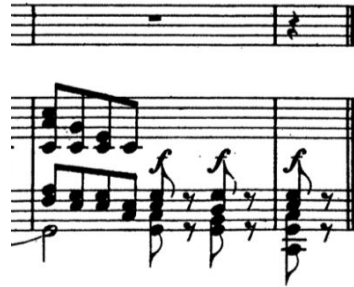
Figure 4.7.3 “Ich grolle nicht’,” mm. 35-36

claims that “I bear no grudge,” this statement belies his grief and disappointment as the last three forte shock chords demonstrate (Fig. 4.7.3).