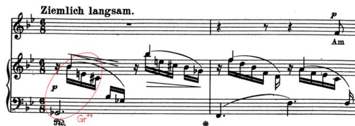
Figure 4.12.1 “Am leuchtenden Sommermorgen,” mm. 1-2

The evocative motif in the accompaniment is reminiscent of the tenth song, wherein the poet is immersed in misery over the loss of his lover. In “Am leuchtenden Sommermorgen,” Schumann uses the piano arpeggios to symbolize sunshine falling from the sky in the first stanza and whispering flowers in the second, exhibiting his customary romantic stylings (Fig. 4.12.1).