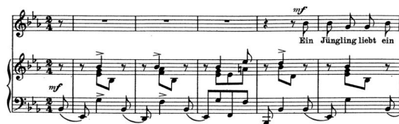
Figure 4.11.1 "Ein Jüngling liebt ein Mädchen," mm. 1-5

The text-painting is mostly seen in mm. 19-23 (Fig. 4.11.2). Schumann repeats the ascending bass line to replicate the man's walking motion for the text "the first man who comes her way." The following three portato chords are meant to illustrate the words " übel dran " ("badly hurt").