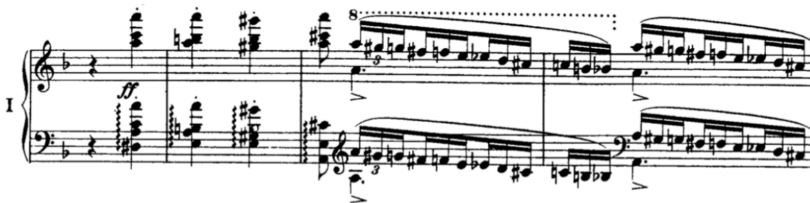
Example 2-22: Brahms, Piano Concerto in D minor , III., mm. 122-125

The second half of Exercise 25c combines a held octave with a moving chromatic line; this pattern is passed between the two hands. Play the inner chromatic line lightly with minimal pressure, sliding the fingers to the next position while holding the octaves. Release the octaves just before the next octave.