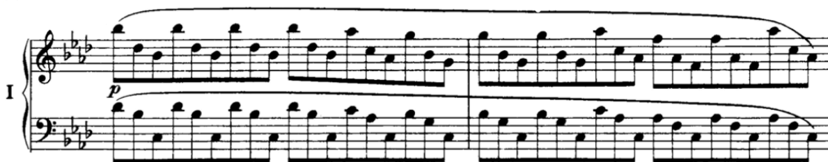
Example 2-17: Brahms, Piano Concerto in D minor , I., mm. 142-143

The wrists help to facilitate speed and accuracy by pivoting from side to side to line up behind the finger that is playing. In a slower tempo, the pianist can add a smaller counter-clockwise motion that helps to release tension. The passage above (Ex. 2-17) benefits from the practice of Exercise 15 — the hand moves up and sideways in minute circular motions, playing with the finger pads.