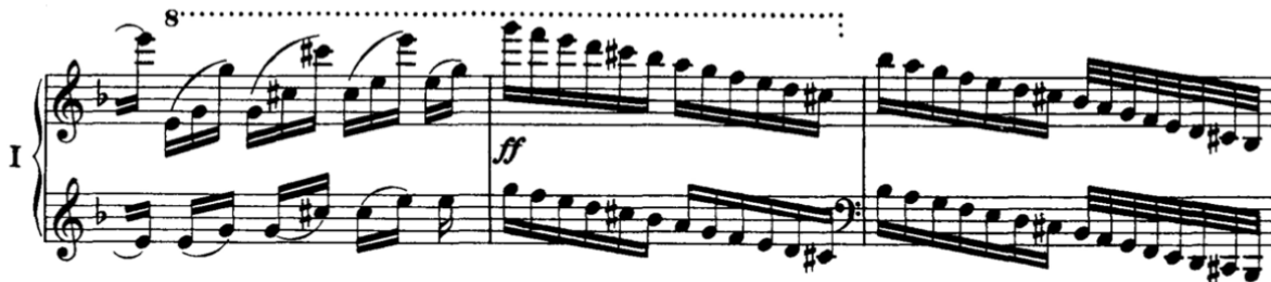
Example 2-2: Brahms, Piano Concerto in D minor , III., mm. 317-319

Exercises 1a-1f train the pianist in polyrhythms — three against four, four against five, and six against seven. These are generally beneficial for the study of Brahms's music, which often features complex rhythms, polyrhythms, and rhythmic devices such as hemiola . One passage that requires control of the inner rhythm is in the third movement of the concerto in mm. 311-320. The downbeat of the two-against-three rhythm in m. 312 is further obscured by the phrasing. At m. 318, this anchor-less rhythm suddenly shifts into unison sextuplets, septuplets, and thirty-second notes (Ex. 2-2). Another passage with constantly changing polyrhythms is in the third movement at mm. 459-462. The right-hand shifts between groups of nine to twelve over a simple dotted rhythm in the left hand.