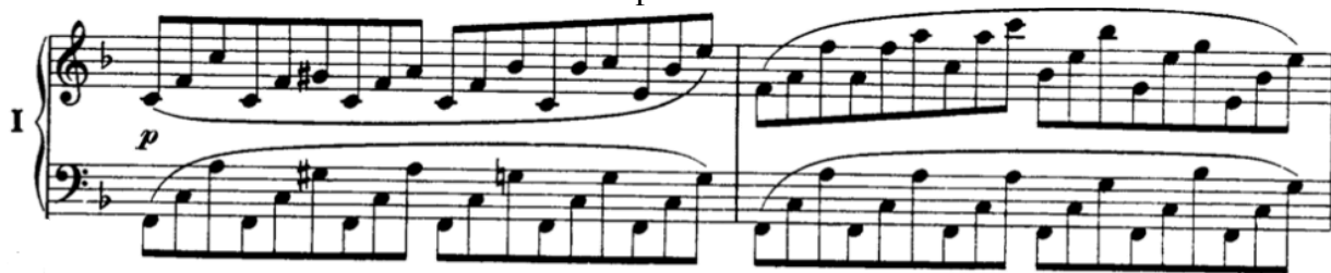
Example 4-14: Brahms, Piano Concerto in D minor , I., mm. 210-211

Brahms employs arpeggios again at m. 210 (Ex. 4-14). The physical motion required to play this passage remains the same despite the now-ascending arpeggio figure. This small configuration change dramatically changes the mood, conveying a brighter and more hopeful sentiment that will be continued in the development.