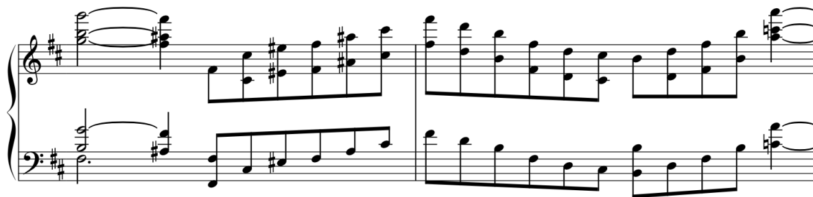
Example 4-17: Brahms, Piano Concerto in D minor , I., redistribution of mm. 280-281

The key signature changes — two sharps — and with the prevalence of the F-sharp major and B minor chords, it is safe to assume we are in the key of B minor although the tonal center remains unstable. In the “Hungarian Rhapsody” section, observe accents as they are anchor notes to the hands in this imitative writing. Redistribute the octaves between the hands if possible to reduce the distance between jumps and for a small respite from the technically-challenging writing (Ex. 4-17).