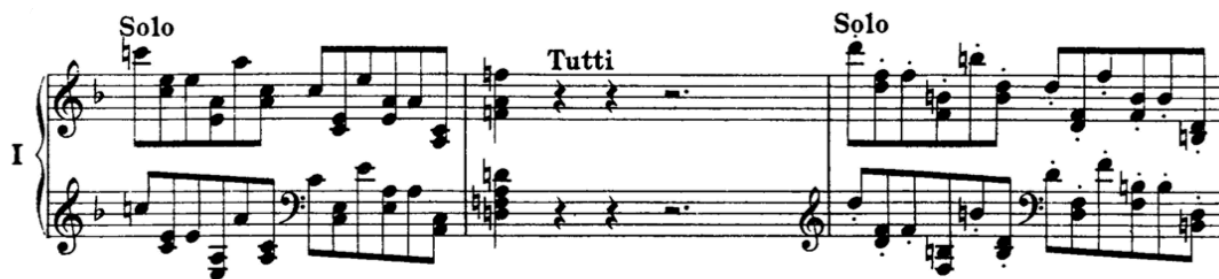
Example 4-16: Brahms, Piano Concerto in D minor , I., mm. 245-247

The key signature changes — two sharps — and with the prevalence of the F-sharp major and B minor chords, it is safe to assume we are in the key of B minor although the tonal center remains unstable. In the “Hungarian Rhapsody” section, observe accents as they are anchor notes to the hands in this imitative writing. Redistribute the octaves between the hands if possible to reduce the distance between jumps and for a small respite from the technically-challenging writing (Ex. 4-17).