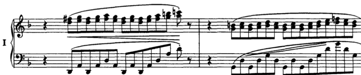
Example 2-4: Brahms, Piano Concerto in D minor , I., mm. 193-194

Exercise 2a is a study in ascending double thirds with entrances that alternate between the hands. The double-thirds technique is used in the first movement at mm. 192-195 and its corresponding passage in the recapitulation (Ex. 2-4). To create the illusion of legato thirds, practice connecting only the upper pitch of the interval using the indicated fingering. The inner notes can be released just before the next third. Keeping the thumb and second finger light also helps to create legato and clearer voicing, a technical aspect that is also developed in Exercise 4. Once the balance within the interval is achieved, create the phrasing by executing the note groupings as one big movement and remove all tension of the arm and wrists in the rests.