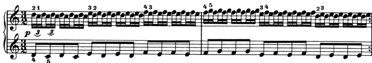
Example 2-18: Brahms, 51 Exercises , Exercise 17, mm. 1-2

The exercise above develops control of the measured trill using different combinations of fingers, with three notes of the trill for each eighth note. Small rotations of the wrist — like the motion of turning a doorknob — help to keep it relaxed. During practice, the first note of each trill group can be accented to help emphasize where the beat falls. A faster version of the measured trill is used in the third movement at mm. 212-221 (Ex. 2-19).