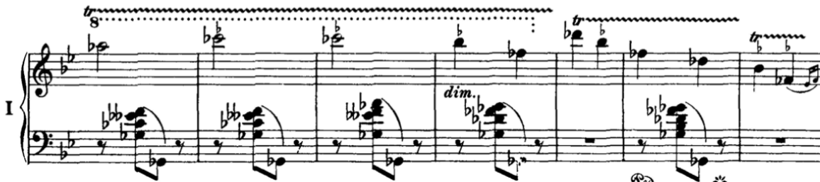
Example 2-19: Brahms, Piano Concerto in D minor , III., mm. 215-221