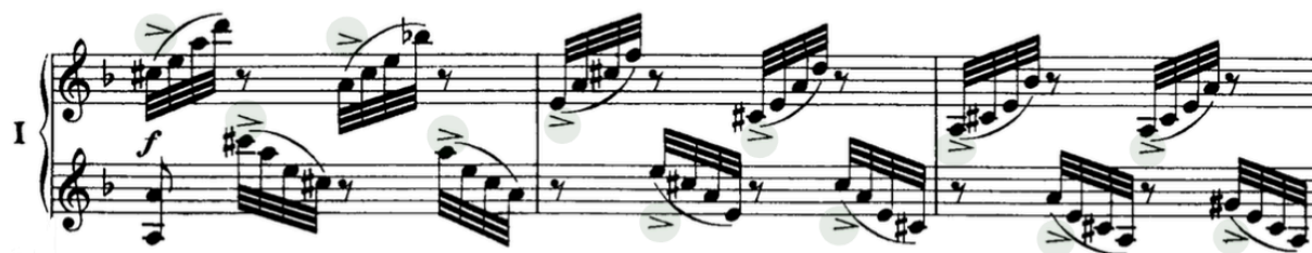
Example 4-41: Brahms, Piano Concerto in D minor , III., mm. 287-289

Build intensity with the long crescendo and tremolos, bringing out every accent in the alternating thirty-second note groups at mm. 287-291 (Ex. 4-41). The Peters (2010) edition misprints mm. 290- 296 as piano reduction (II).