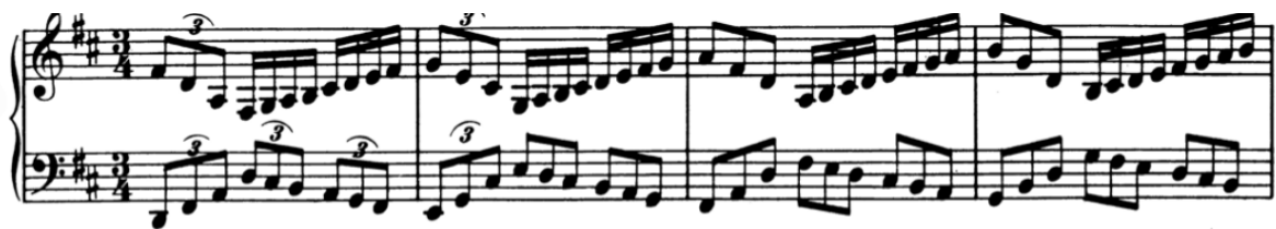
Example 2-1: Brahms, 51 Exercises , Exercise 1a, mm. 1-4

Exercises 1a-1f train the pianist in polyrhythms — three against four, four against five, and six against seven. These are generally beneficial for the study of Brahms's music, which often features complex rhythms, polyrhythms, and rhythmic devices such as hemiola . One passage that requires control of the inner rhythm is in the third movement of the concerto in mm. 311-320. The downbeat of the two-against-three rhythm in m. 312 is further obscured by the phrasing. At m. 318, this anchor-less rhythm suddenly shifts into unison sextuplets, septuplets, and thirty-second notes (Ex. 2-2). Another passage with constantly changing polyrhythms is in the third movement at mm. 459-462. The right-hand shifts between groups of nine to twelve over a simple dotted rhythm in the left hand.