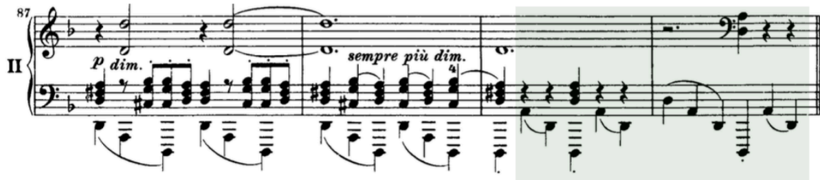
Example 3-3: Brahms, Piano Concerto in D minor , I., mm. 87-90

major key, at m. 82; here, a second transitional idea based on the interval of a fourth foreshadows material that is to come later in the third subject (piano solo) at m. 166.