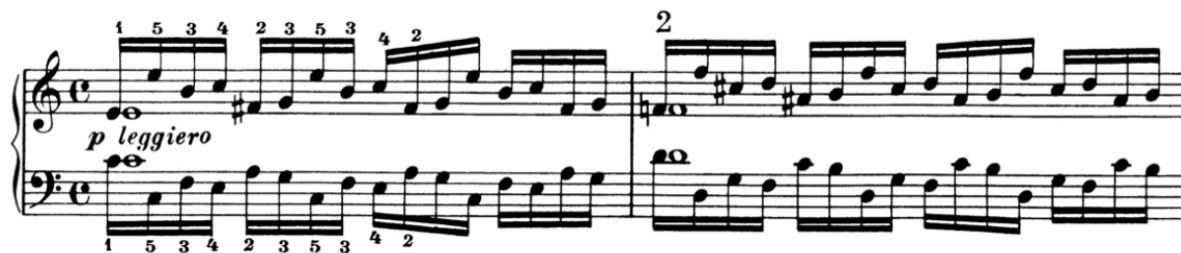
Example 2-14: Brahms, 51 Exercises , Exercise 11, mm. 1-2

This exercise develops the independence of the thumbs and flexibility of the hand. It is important to follow his fingering markings as they serve specific purposes —developing equality of fingers and flexibility of the hand. Although both of my hands can comfortably reach a ninth, Exercise 11b is challenging due to the held thumbs. It requires the third and fifth fingers to stretch to an interval of a sixth, which can be achieved if wrists are free to pivot left and right; the thumbs should hold the whole note for its full value without pressing into the key. By playing with light fingers in a non-legato articulation to honor the fingering and dynamics, the leggiero touch is achieved naturally. This technique appears in the opening piano solo of the first movement — see mm. 95-96 in Ex. 2-15.