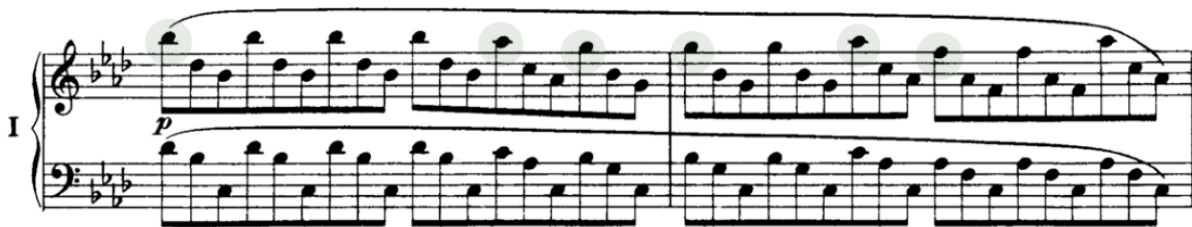
Example 4-8: Brahms, Piano Concerto in D minor , I., mm. 142-143

The stormy atmosphere subsides into a tranquil mood in the transition to the third subject. The chromatic bass line in mm. 123-128 presents a challenge in pedaling because the half-steps blur into each other (Ex. 4-7). I suggest that the left hand be played with finger legato by physically overlapping fingers, combined with shallow and frequent changes of the pedal. The top voice in the arpeggios that start at m. 142 outlines the transitional theme, while the inner notes fill in the harmony (Ex. 4-8). To execute this passage at the pianissimo dynamic the hands should stay open — intervals range from sixths to tenths— and move in an up-and-sideways motion as if wrists are drawing a counter-clockwise circle. The murmurs of the piano give a veiled feeling, like a rain cloud that obscures the sunlight.