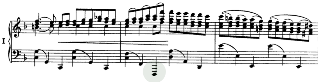
Example 4-2: Brahms, Piano Concerto in D minor , I., mm. 97-99

The lyrical nature of the secondary theme might tempt the soloist to play more freely but the soloist must remember that they are still accompanied and thus cannot use too much rubato, except at the end of phrases and on agogic accents. I suggest 38-42 for the dotted half note, a tempo that range allows space for push-and-pull within the phrase.