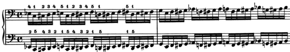
Example 2-9: Brahms, 51 Exercises , Exercise 7, mm. 1-2

The hand stays in the closed position in this exercise to execute the rapid chromatic patterns. Notice that the exercise uses all fingers and requires the hand to open and close very slightly, never exceeding the five-finger position. Avoid lifting the fingers for accuracy, speed, and evenness. This exercise is useful for the chromaticism of the concerto where the hand opens and closes quickly, as in Ex. 2-10.