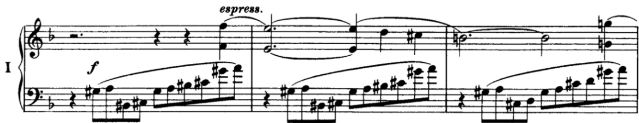
Example 4-7: Brahms, Piano Concerto in D minor , I., mm. 123-125

For stringed instruments, this articulation requires the portato bowing. On the piano, this touch is achieved by two motions: playing with downward pressure but lifting hands off the keyboard from the wrists, and adding a light touch of the pedal for each note. As with any octave passage, I redistribute notes to eliminate big leaps where possible, for accuracy.