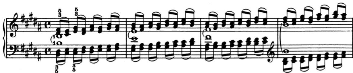
Example 2-20: Brahms, 51 Exercises , Exercise 23a, mm. 1-4

In Exercise 23a the thumbs hold down one tone per measure while upper voices move in groups of two di-chords. The held thumb dictates the 5-3 to 4-2 fingering for the di-chords, which should be played as one movement with instantaneous relaxation between each group. There may be a tendency to press the thumbs at the key bottom to continue holding the key down. One practice method is to reiterate the held note every quarter beat, then every two beats; once comfortable with this method, play the exercise as written.