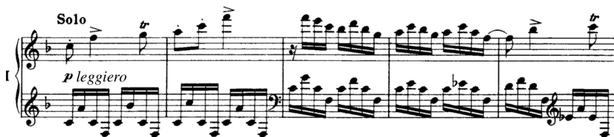
Example 4-40: Brahms, Piano Concerto in D minor , III., mm. 275-279

Build intensity with the long crescendo and tremolos, bringing out every accent in the alternating thirty-second note groups at mm. 287-291 (Ex. 4-41). The Peters (2010) edition misprints mm. 290- 296 as piano reduction (II).