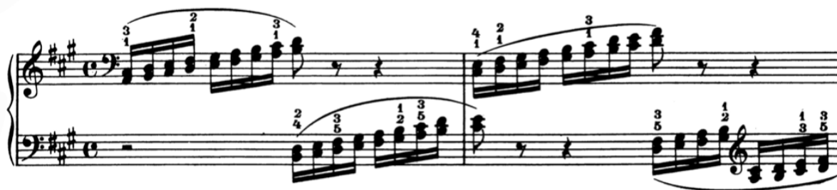
Example 2-3: Brahms, 51 Exercises , Exercise 2a, mm. 1-2

Exercise 2a is a study in ascending double thirds with entrances that alternate between the hands. The double-thirds technique is used in the first movement at mm. 192-195 and its corresponding passage in the recapitulation (Ex. 2-4). To create the illusion of legato thirds, practice connecting only the upper pitch of the interval using the indicated fingering. The inner notes can be released just before the next third. Keeping the thumb and second finger light also helps to create legato and clearer voicing, a technical aspect that is also developed in Exercise 4. Once the balance within the interval is achieved, create the phrasing by executing the note groupings as one big movement and remove all tension of the arm and wrists in the rests.