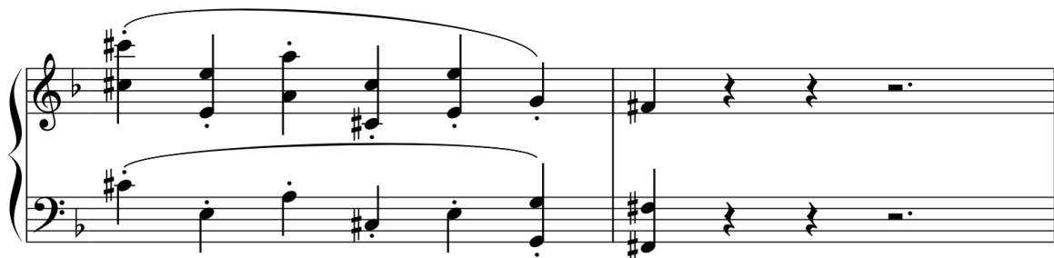
Example 4-6: Brahms, Piano Concerto in D minor , I., mm. 112-113

Brahms's piano music is often symphonically-inspired; the thick textures and orchestral sonority are even more apparent in a concerto. Therefore, the soloist needs to be aware of the instrumentation, working to match timbres and articulation, especially for musical material in both orchestral and solo parts. One example is at mm. 112-113 — Ex. 4-6 below. The material in these two measures is also played by the strings. Notice that there are staccatos marked over each note, with a slur for the entire measure.