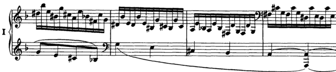
Example 2-10: Brahms, Piano Concerto in D minor , III., mm. 137-140

The hand stays in the closed position in this exercise to execute the rapid chromatic patterns. Notice that the exercise uses all fingers and requires the hand to open and close very slightly, never exceeding the five-finger position. Avoid lifting the fingers for accuracy, speed, and evenness. This exercise is useful for the chromaticism of the concerto where the hand opens and closes quickly, as in Ex. 2-10.