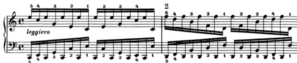
Example 2-12: Brahms, 51 Exercises , Exercise 9b, mm. 1-2

Exercise 9b trains the reverse technique from 9a. The fifth finger repeats a single pitch per measure while the four other fingers outline the descending C major arpeggio. The interval between the repeated pitch and the descending line widens — the largest interval is a tenth. Note that the exercise is now marked leggiero instead of legato . The pianist should avoid using too much arm weight and play as lightly as necessary, without creating a staccato touch.