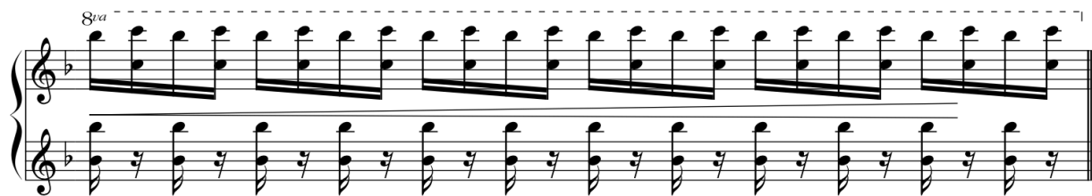
Example 4-5: Brahms, Piano Concerto in D minor , an alternative to the trill in I., m. 110

The trills that begin at m. 110 — the first subject — are challenging to play because of the octaves; the pianist must find a solution that works for their hand and create the sound of octave trills. In Ex. 4-5, I offer one solution that works for hands that can comfortably reach an octave. For clarity, I have notated my method as a measured sixteenth-note trill but keep in mind that the aural effect may be faster and/or unmeasured. Focus instead on creating a smooth trill in the alternating thumbs while using plenty of arm weight for a strong fortissimo sound. The result will be a rapid, brilliant trill that is more successful (aurally) and much easier than octave trills.