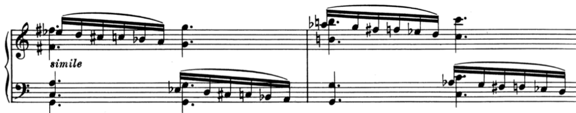
Example 2-21: Brahms, 51 Exercises , Exercise 25c, mm. 7-8

The second half of Exercise 25c combines a held octave with a moving chromatic line; this pattern is passed between the two hands. Play the inner chromatic line lightly with minimal pressure, sliding the fingers to the next position while holding the octaves. Release the octaves just before the next octave.