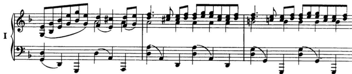
Example 2-15: Brahms, Piano Concerto in D minor , I., mm. 94-96

This exercise develops the independence of the thumbs and flexibility of the hand. It is important to follow his fingering markings as they serve specific purposes —developing equality of fingers and flexibility of the hand. Although both of my hands can comfortably reach a ninth, Exercise 11b is challenging due to the held thumbs. It requires the third and fifth fingers to stretch to an interval of a sixth, which can be achieved if wrists are free to pivot left and right; the thumbs should hold the whole note for its full value without pressing into the key. By playing with light fingers in a non-legato articulation to honor the fingering and dynamics, the leggiero touch is achieved naturally. This technique appears in the opening piano solo of the first movement — see mm. 95-96 in Ex. 2-15.