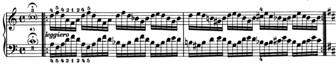
Example 2-16: Brahms, 51 Exercises , Exercise 15, mm. 1-2

At the very beginning of Exercise 15, there is a whole note in brackets marked with a fermata. At the bottom of this page in the score of the 51 Exercises , instruction is given in German. This commentary instructs the player that the bracketed note is not intended to be struck, only sustained or held down during practice. By following this direction, the pianist is obliged to use the fingerings given by Brahms.