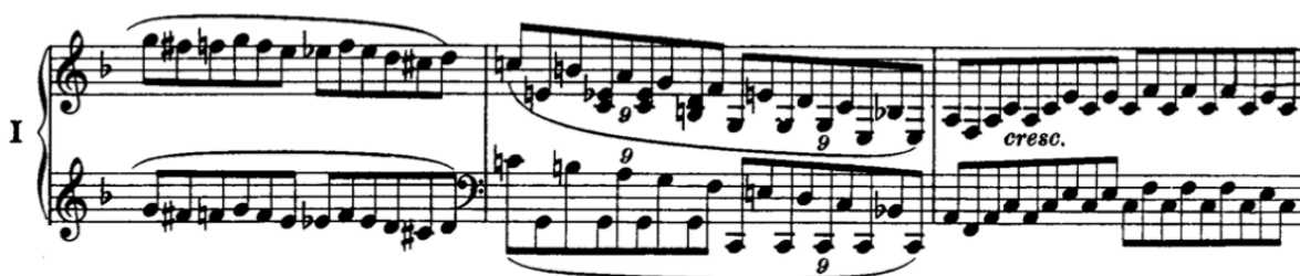
Example 2-13: Brahms, Piano Concerto in D minor , I., mm. 186-188

Exercise 9b trains the reverse technique from 9a. The fifth finger repeats a single pitch per measure while the four other fingers outline the descending C major arpeggio. The interval between the repeated pitch and the descending line widens — the largest interval is a tenth. Note that the exercise is now marked leggiero instead of legato . The pianist should avoid using too much arm weight and play as lightly as necessary, without creating a staccato touch.