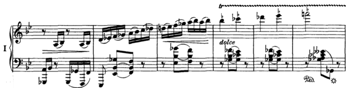
Example 4-38: Brahms, Piano Concerto in D minor , III., mm. 209-214

Ex. 4-37 shows how I redistribute the left hand in mm. 206-209 (see Ex. 4-36 for “original” notation). Use a light touch and play in tempo, accompanying and providing a rhythmic pulse. The two-note slurs become a trill — I play this as a measured trill— while the left hand and the orchestra playfully interact in call-and-response (Ex. 4-38). Change fingering for each trill so as not to become fatigued; possible finger combinations are 1-3, 2-3, 2-4, and 3-5.