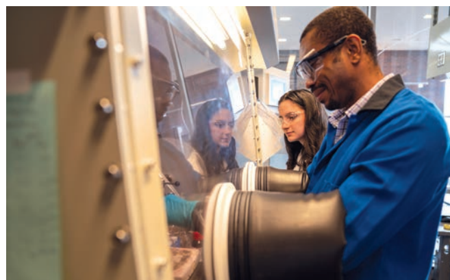
Oregon Center for Electrochemistry students performing research.

“CI2 is really connected to the other things we’re doing” says Boettcher, “we are building a web, an ecosystem, that addresses current challenges, does really good basic science informed by current challenges, and educates students for jobs that are out there right now and in places where they’re really needed.”