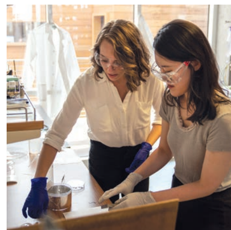
Oregon Center for Electrochemistry students performing research.

"This synergy between education, research, and innovation is allowing us to attack bigger and more important research problems than we have in the past" says Boettcher. "It was a grassroots effort to get this going, but things are starting to come to fruition because now we have connections in industry, and we're much more integrated into the research infrastructure in the US because