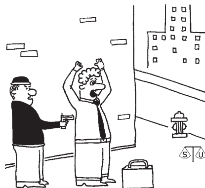
"Money? Ha! I'm a legal aid lawyer. The only thing in my wallet is an overdue notice for my student loans."

After graduation, he would like to keep doing work just like this, although he worries about the mismatch between low