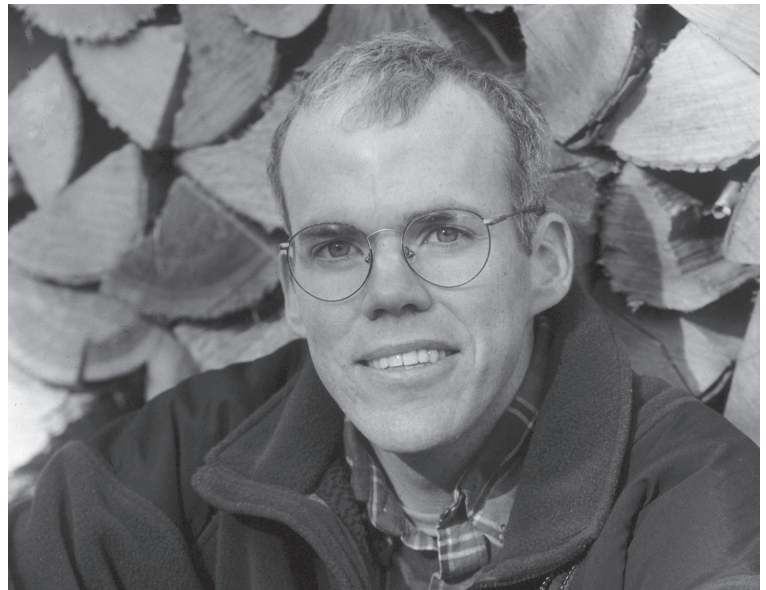
Bill McKibben