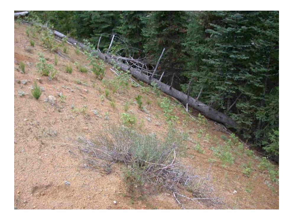
Photo 1. Wasterock pile adjacent to Granite Creek.