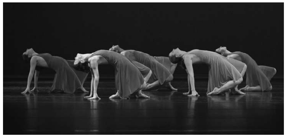
The UO Repertory Dance Company in its 2007 spring tour.