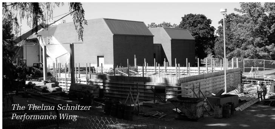
Construction began in the spring on the new wings to the music building. For additional construction photos, go to our website at music.uoregon.edu; click on "Construction Information" on the left side of the page.