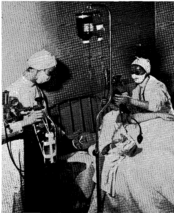
POSTOPERATIVE CASE AT THE UNIVERSITY STATE TUBERCULOSIS HOSPITAL