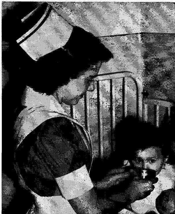
A TYPICAL PATIENT AT THE DOERNBECHER MEMORIAL HOSPITAL