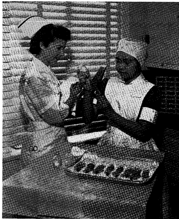
LEARNING TO ADMINISTER AN INTRAMUSCULAR MEDICATION