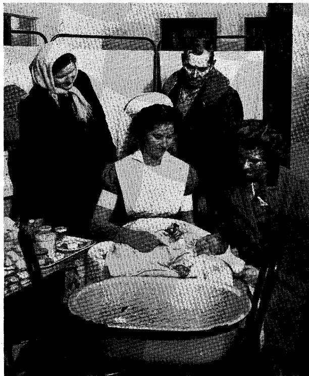
A PARENTS' CLASS IN THE OBSTETRICAL DIVISION OF THE OUTPATIENT CLINIC