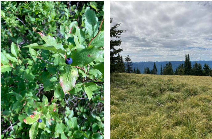
Culturally-important plants in the study area. Left, huckleberry ( vaccinium spp.); right, beargrass ( Xerophyllum tenax ).