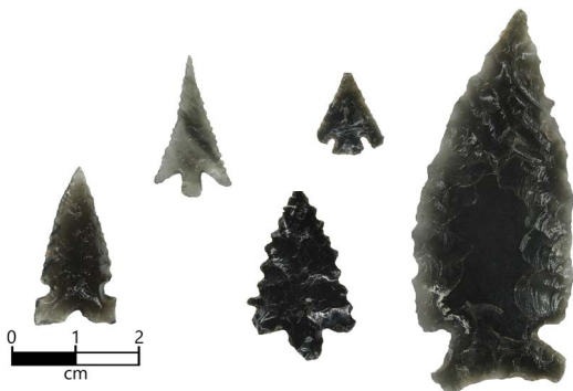
Obsidian (volcanic glass) tools provide evidence of historical hunting within the project area.