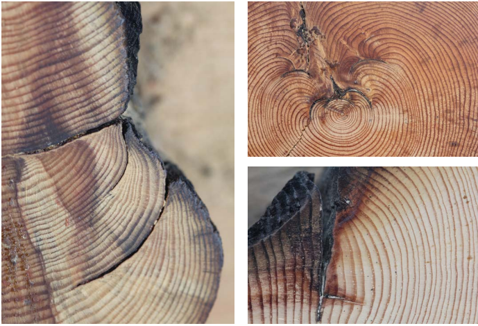
Scarred tree rings provide evidence of fire.