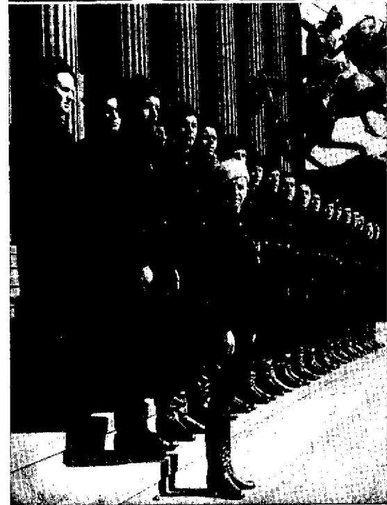
Fritz Kriesler, above, will appear on the University campus on November 7, as the first attraction of ASUO fall concert series. The famous violinist has never appeared in Eugene before. The Don Cossack chorus will appear on November 16th. This will be the third campus appearance for this group who have always been favorites.