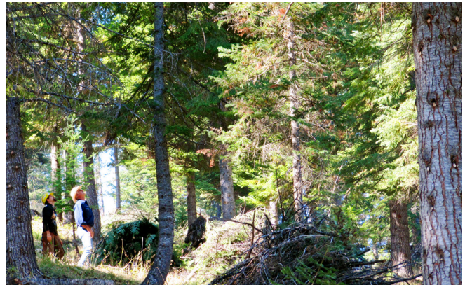
Hazardous fuels reduction work outside of Elk City, ID.