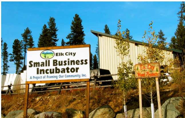
Elk City Small Business Incubator in Fall '12.

After several years of planning, grant writing, coordination, securing land, and construction, Framing Our Community opened the completed Elk City Small Business Incubator in 2005. The facility offers a modern, low-rent industrial space for the start-up of value-added wood products and other industries that create local jobs. The objective is to give new businesses the basic skills and connections they need to start up and survive. Framing Our Community partners with colleges and small business centers in the area to offer users of the incubator access to a broad base of business development and management knowledge, including access to micro-loan programs and funding for infrastructure needs, marketing tools, and a course in business management.