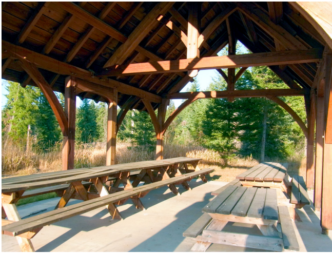
Elk City, ID community center.