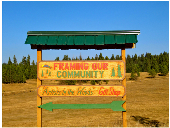
Official Framing Our Community sign.