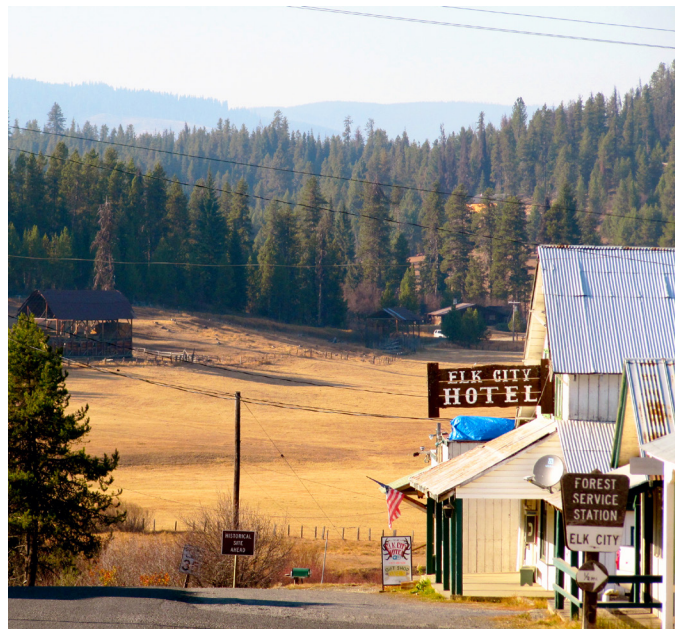
Town of Elk City, ID.

Elk City is located in Idaho County in north central Idaho, at the end of winding Highway 14, and is surrounded by the Nez Perce National Forest and by land owned and managed by the Bureau of Land Management (BLM). The unincorporated community started out as a tent-camp mining town during the gold rush days starting in the 1860s. Today Elk City is a small community that still serves as a supply center for people living in town and the outlying regions of Red River, Dixie, and Orogrande. The local economy is based on natural resources (timber, salmon, and native plants) and recreational activities such as hunting, fishing, hiking, ATV and snowmobile use, equestrian trails, and camping. Like many western rural communities, Elk City is faced with considerable challenges in economic development given its small population, isolation from major population centers and markets, limited infrastructure, and vulnerability to management changes on the surrounding federal lands.