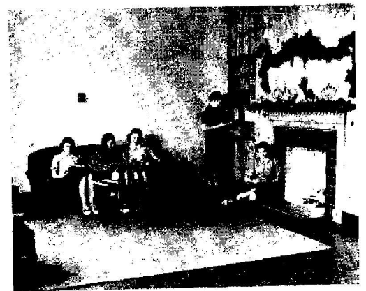
Above: practice living room; used also as a reading room for home-economics students. Below: Dining room.