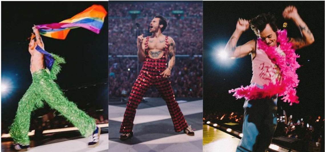
Figure 2: Harry Styles

Examples of gender transgressions enacted by Sam Smith. Smith's gender transgressions frequently include a combination of traditionally masculine and feminine elements, like neckties, button-down shirts, corsets, jockstraps, and skirts. They tend to be highly ornate and intricately decorated.