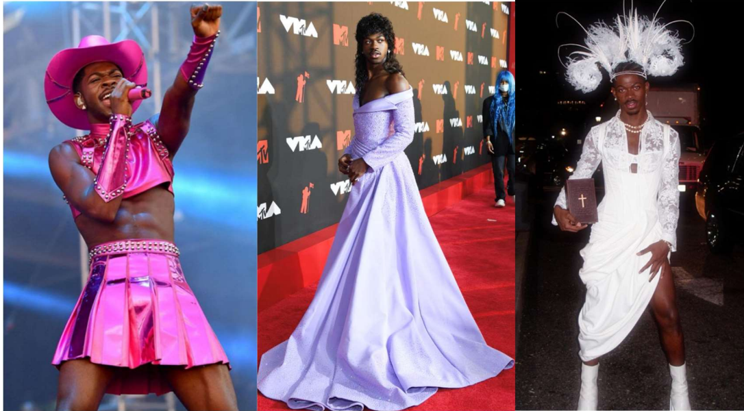
Figure 3: Lil Nas X

These are a few instances of gender transgressions performed by Lil Nas X. His transgressions primarily include the use of wigs, feathers, high heels, and dresses/skirts. As an element of his unique style, he incorporates costume-like elements, with the use of various props and outfits mimicking other celebrities' outfits.