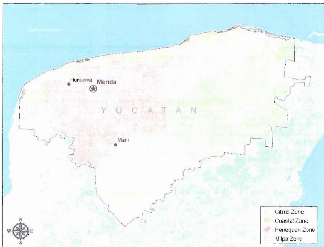
Figure 3: Ejido Zones, map by Patrick Gronli

Communal land ( uso común ) appears to have been preserved because it is suited to the traditional milpa practice, as it allows for field rotation. One agrarian representative argued that uso común predominated because it “was what they [ejidatarios] could envision.” Perhaps after centuries, past agrarian practices became accepted as inevitable, and so ejidatarios made their tenure choices based on what they knew best.