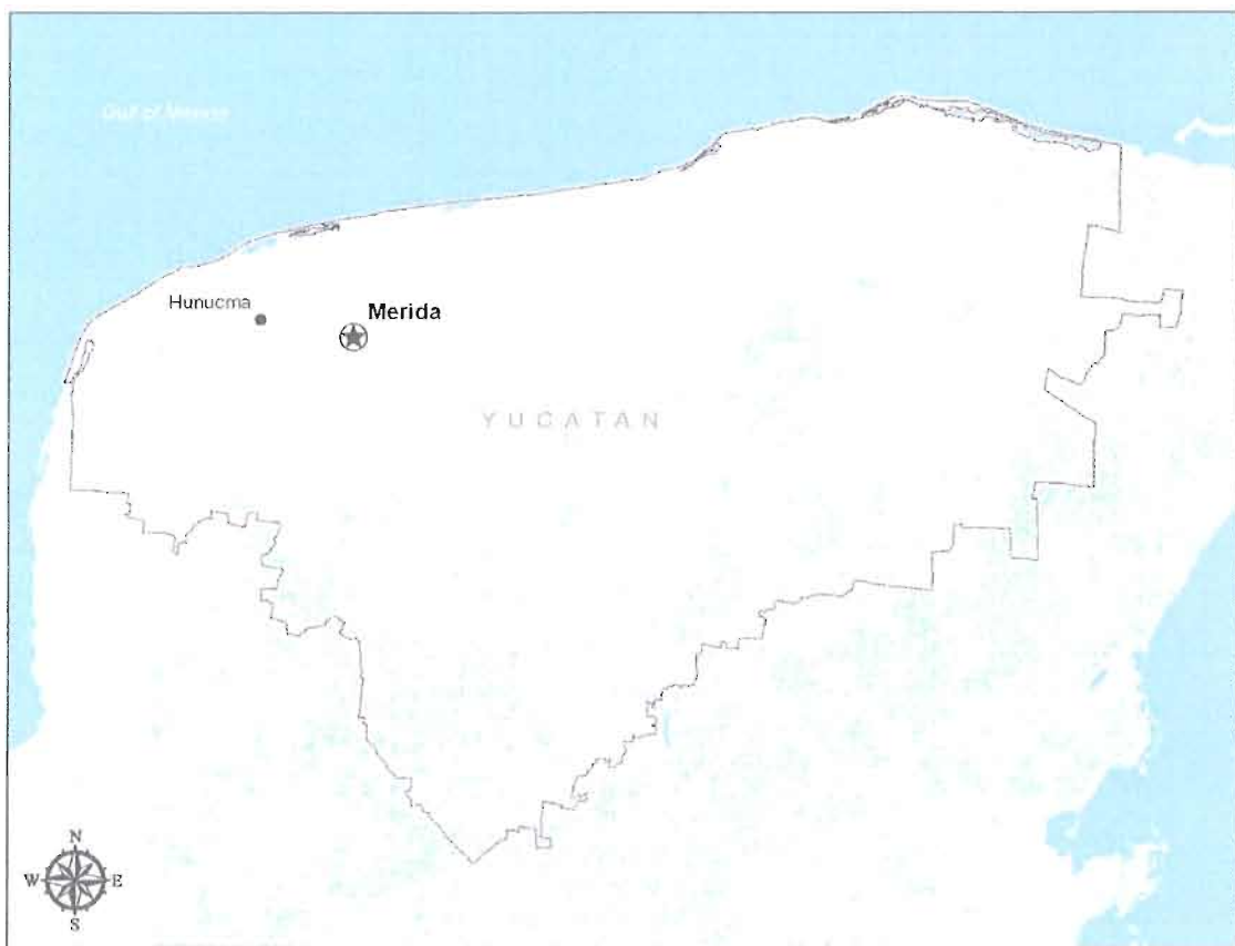
Figure 5: Hunucmá, map by Patrick Gronli

operated throughout the area (Fallaw 2002, 649). Imposed Revolutionary governments in the peninsula neither lasted long nor were very successful for the first several years. In 1915 the debt-peonage system was officially outlawed in Yucatán by Governor Avila, but major changes failed to