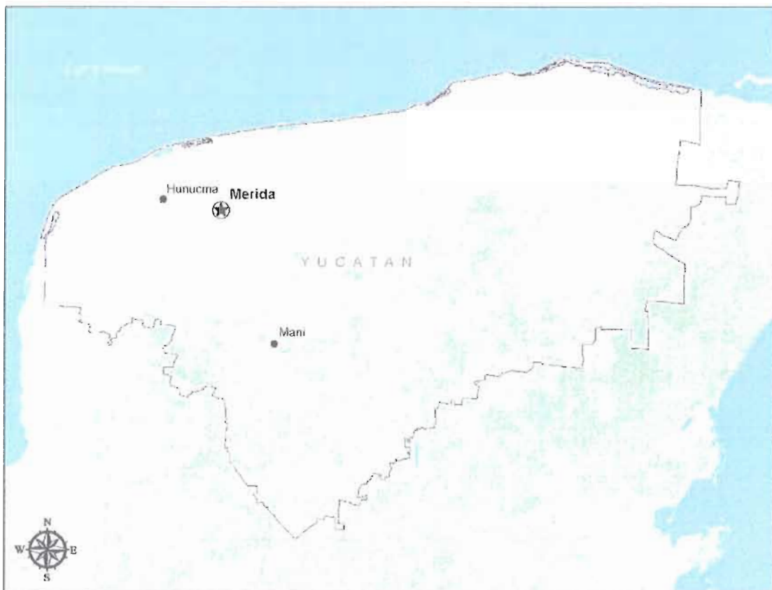
Figure 2: Yucatán, map by Patrick Gronli

agrarian production and attendance at ejido meetings was extremely low. Midwifed by corruption, ejido land sales in 2005, part of a state government development project, catalyzed a new social movement to defend ejido lands. Ejidatarios contested the fairness of the price paid for the land, but increasingly their grievances were framed as violations of past practices. Elements of Mayan identity, once latent, resurfaced. Institutional and cultural legacies were recast, fusing indigenous rights, Mayan history, and historical ejido practices.