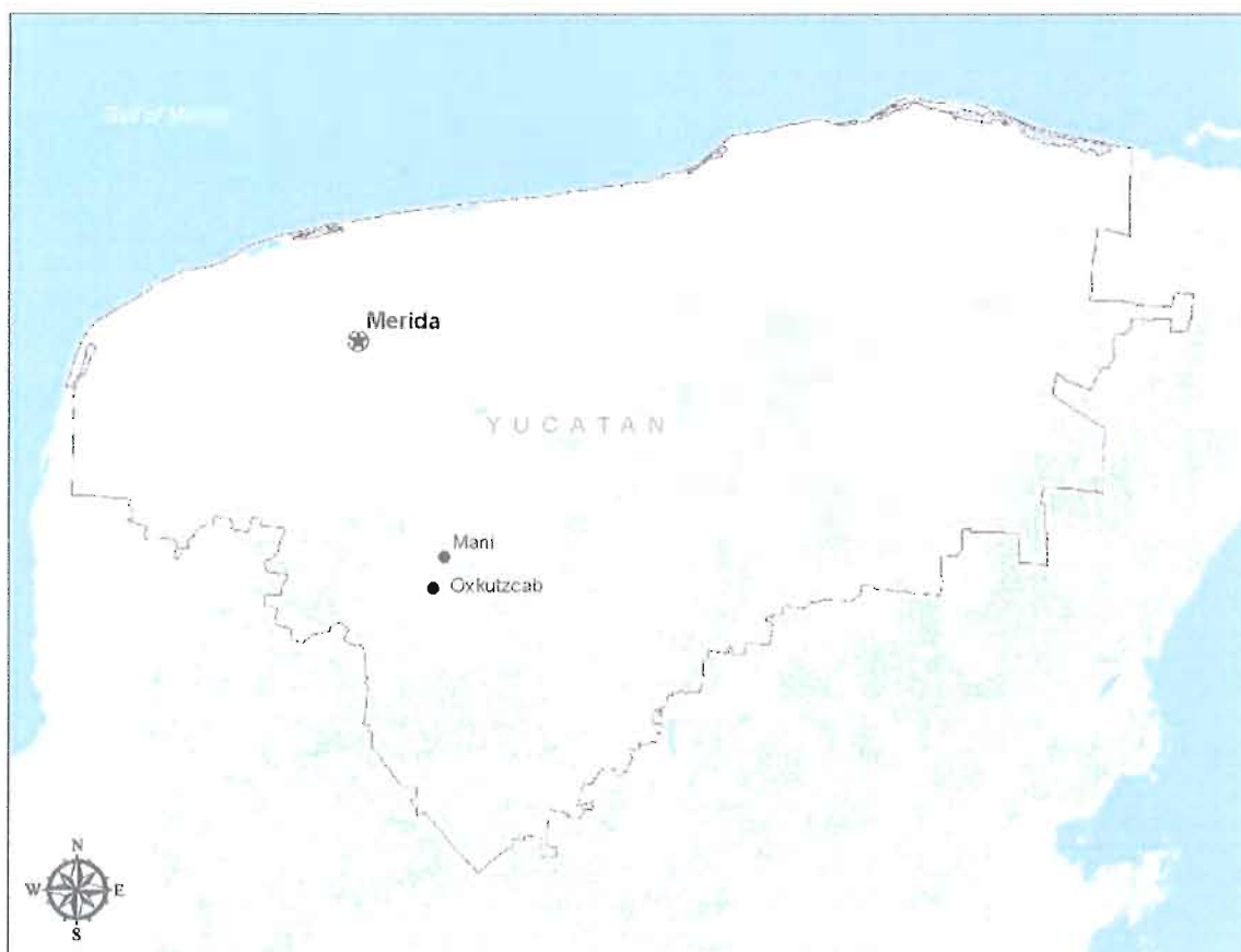
Figure 4: Maní, map by Patrick Gronli

With a population of about four thousand, the town of Maní is located sixty-seven kilometers south of the state capital of Mérida (see figure 4). 2 Maní was the capital of one of the sixteen Mayan provinces in Yucatán prior to the conquest. When the Spanish arrived in Yucatán in the sixteenth century, the Tutul Xiu family ruled the area around Maní. Gaspar Antonio Xiu, grandson of the Tutul Xiu king, was born in 1531 in Maní.