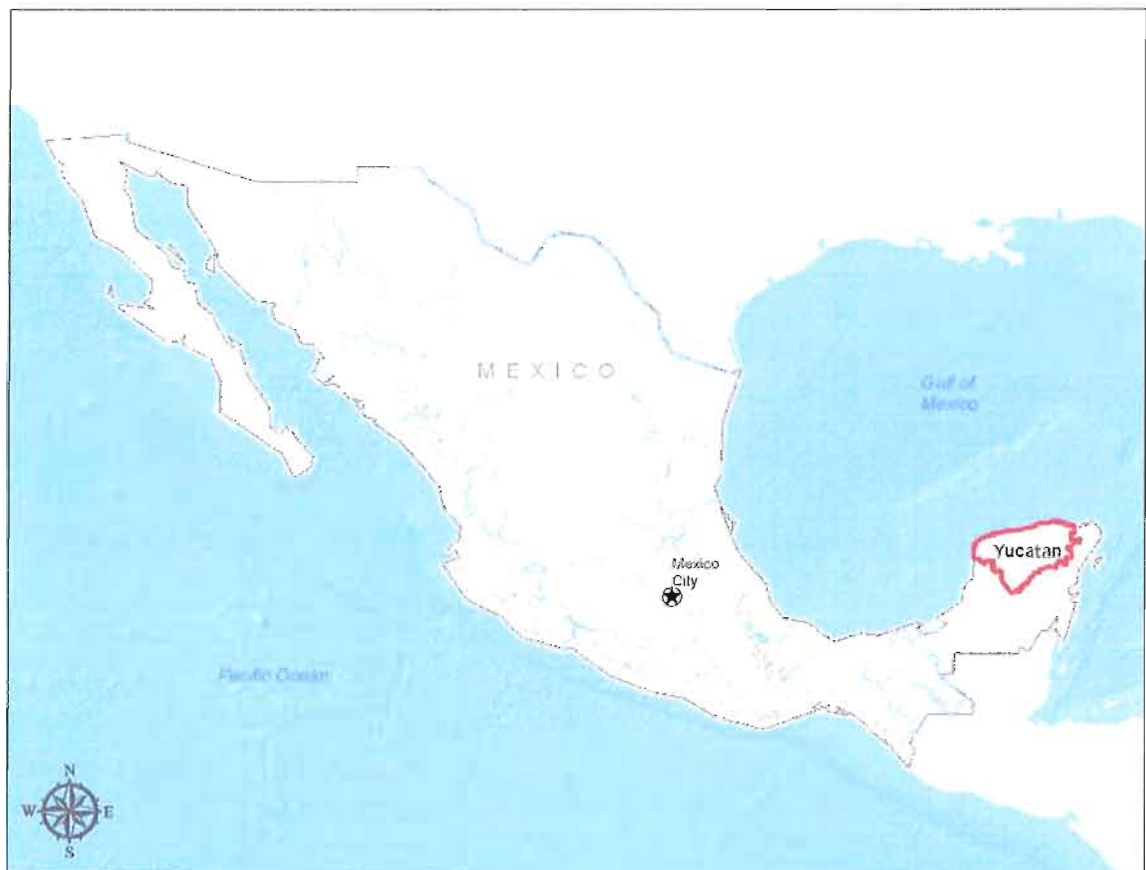
Figure 1: Mexico, map by Patrick Gronli

If we look at the structure of social relations, we may have expected to see conflict in Maní. The population is primarily Yucatec Maya. 2 Ejido land is linked to ritual knowledge of maize production and collective memory of a royal, ancestral lineage. On the eve of the neoliberal reforms, 82% of the residents spoke Maya (INEGI 1991). Population pressures were straining available land and the prices for its main commercial product – oranges – fell by 50% in the 1980s. The ejido was part of a regional citrus producer’s union, a mobilizational resource for alliance-building.