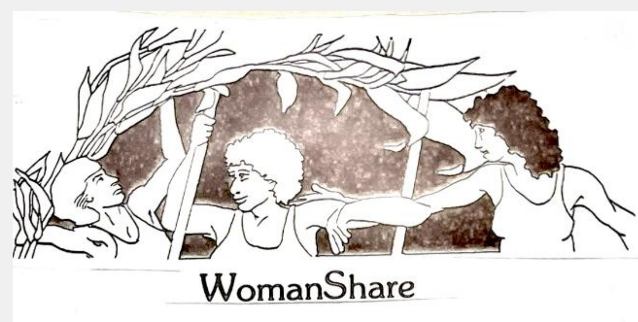
Newsletter, WomanShare Records, Coll 269, Box 2, Folder 4