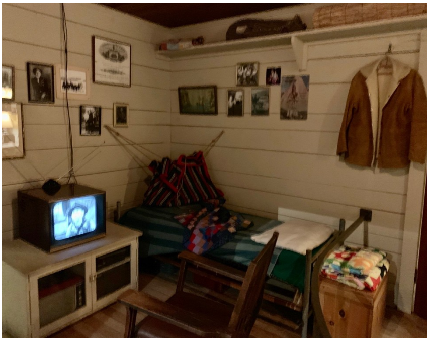
Figure 5: Reservation Home 1963

Somehow this caption and glass case place Native people simultaneously in the past because of their root digging and in the present because they buy microwaveable bean and rice burritos. Although the display is meant to be a representation of moditornality, it actually confuses the visitor and actively works to erase the survivance of Native people by condescendingly describing how Native people shop in grocery stores like everyone else does. I see the intention is to educate visitors into not assuming