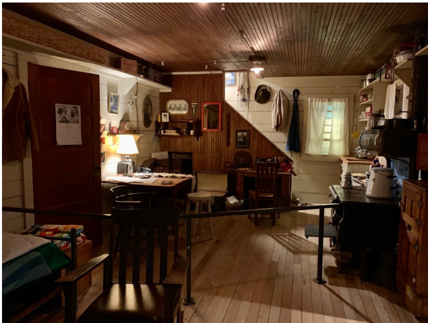
Figure 6: Reservation Home 1963

large portion of the exhibit and allows the visitor to walk through the house and see how an Indian family would live on the reservation in the 1960s. The plaque that stands outside the house marks this space from the year 1963 and talks about how families would exist within these spaces: “Within the walls of reservation homes like this one, Plateau grandparents and parents passed their heritage to new generations. In 1963, it was common for extended families to still share single dwellings of this type. All the objects in this house came from Native American families.” 123 It is wonderful that the High Desert Museum is able to allow the visitor to step, quite literally, into the life of a Native family living on a reservation but the exhibit ignores how difficult it actually was to live like this. There is no mention of the historical significance of reservation life and even how reservations came to be. By ignoring the origin of reservations and the treatment that Native people received at the hands of the federal government the High Desert Museum