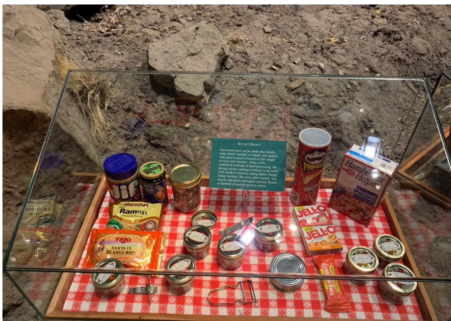
Figure 4: Nature's Bounty

The root digging scene in this exhibit is a fantastic display of how Native people continue to practice tribal traditions despite colonization of the region. The outfits are bright and the visitor is really taken by just how hard the task is as well as how important it is to Native nations of the Plateau. Beside this exhibit is a small case containing