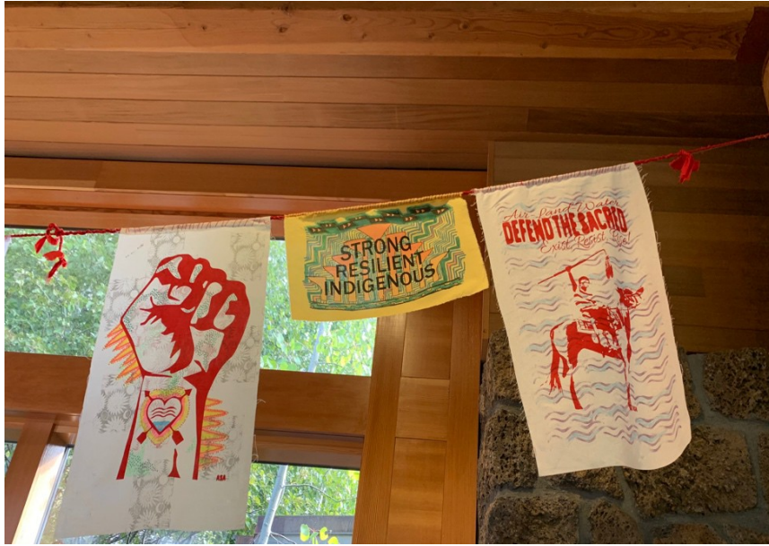
Figure 3: Strong, Resilient, Indigenous

aspects. The collaboration between Native Columbia River Plateau nations and the museum is evident through the construction of a tule mat lodge and many