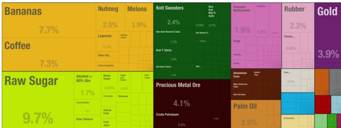
Figure 3-Guatemala's Exports. Source: Observatory for Economic Complexity

During the Raegan administration, development doctrine dictated that the private sector needed to be further expanded in order to relieve widespread poverty. This mentality manifested in a shift towards supporting and promoting the production of export commodities, particularly within the agricultural sector (see figure 3) 125 . As seen in figure 3, most of Guatemala's exports are non-food commodities such as raw sugar and precious metals. Nonetheless, there are several shortcomings to this development approach. The increase of export commodity crops, particularly non-food crops such as sugarcane, is the diminishing of food supply for local people as a result of increasing demand for arable land. Furthermore, desirable lands traditionally reserved for the production of agricultural food staples may have to compete with commodity crops, which generate higher returns further straining food resources.