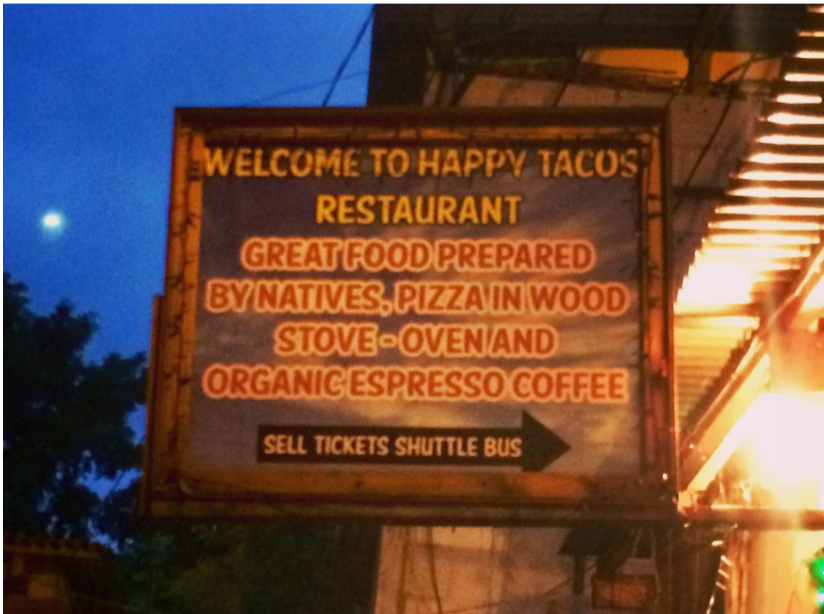
Figure 5- Restaurant sign in San Marcos, Guatemala

retreated from their festivities and indulged in organic coffee to pair with their grass-fed steak dinner.