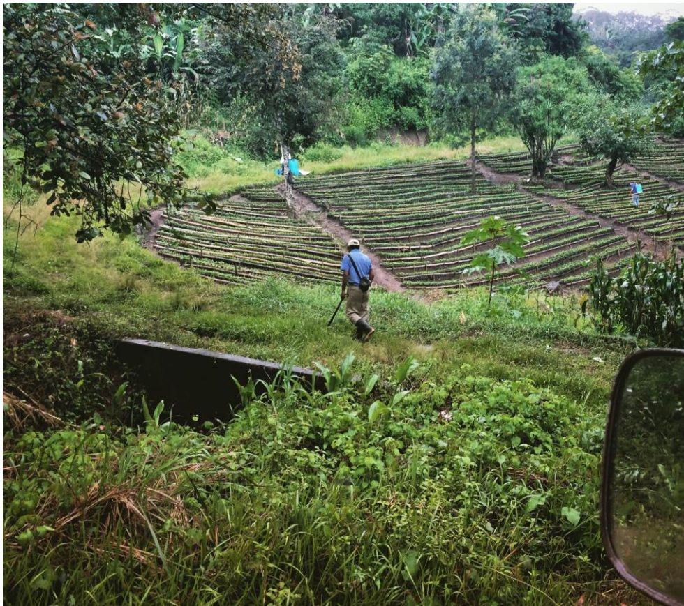
Figure 6- Worker in plantation

This Chapter aims to evaluate the food versus fuel debate and the effects of biofuel demand on indigenous and rural communities in Guatemala and their land and resource rights. The debate centered on the effects of the increased production of sugarcane and palm oil to meet rising demand for biofuels is illustrative of the shortsightedness of the current sustainability paradigm. Guatemala is place rich in natural resources (figure 6).