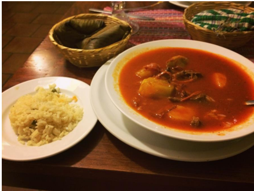
Figure 4- Hilachas

When it came to naming dishes that they feel are tied to their identity, almost all participants named the same few dishes. Among the most popular were hilachas , tamales , caldo de pollo , and pepian . The dish of Hilachas (a personal favorite, see figure 4,) is composed of shredded beef drowned in a tomato and tomatillo sauce served with rice and potatoes. Guatemalan tamales are quite similar to their Mexican counterparts except they usually wrapped in maxan or plantain leaves. There are a dozen varieties of tamales in Guatemala including chuchitos , which are smaller tamales stuffed with meats and wrapped