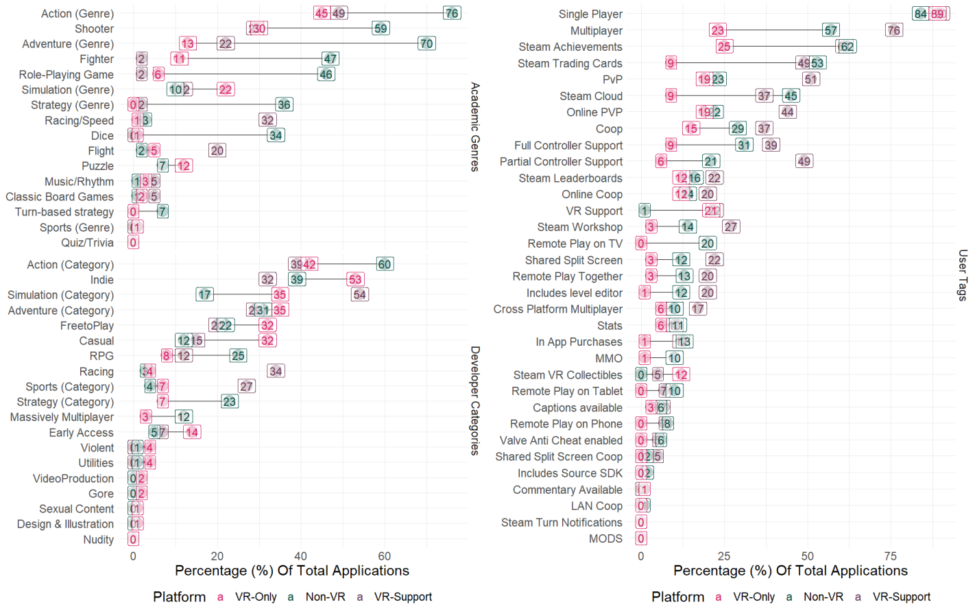
Fig. 1. Percentages of classifications included in analysis across type and platform. Pink represents VR Only, green represents Non-VR, and purple represents VR Supported. The grey line represents the difference between VR Only and Non-VR.