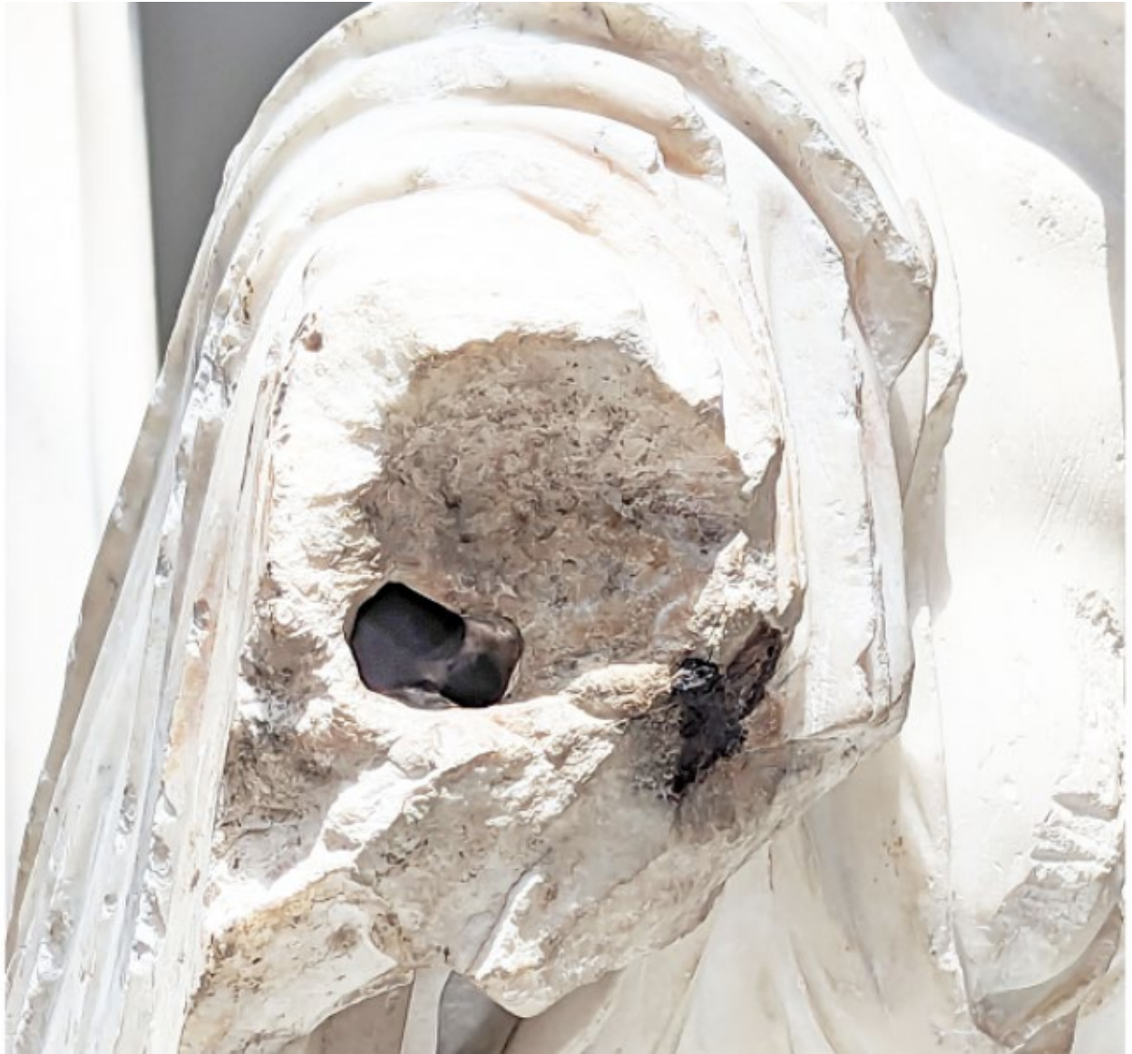
Figure 13: Edited photo of inside of broken right arm of Old Market Woman (September 2023).