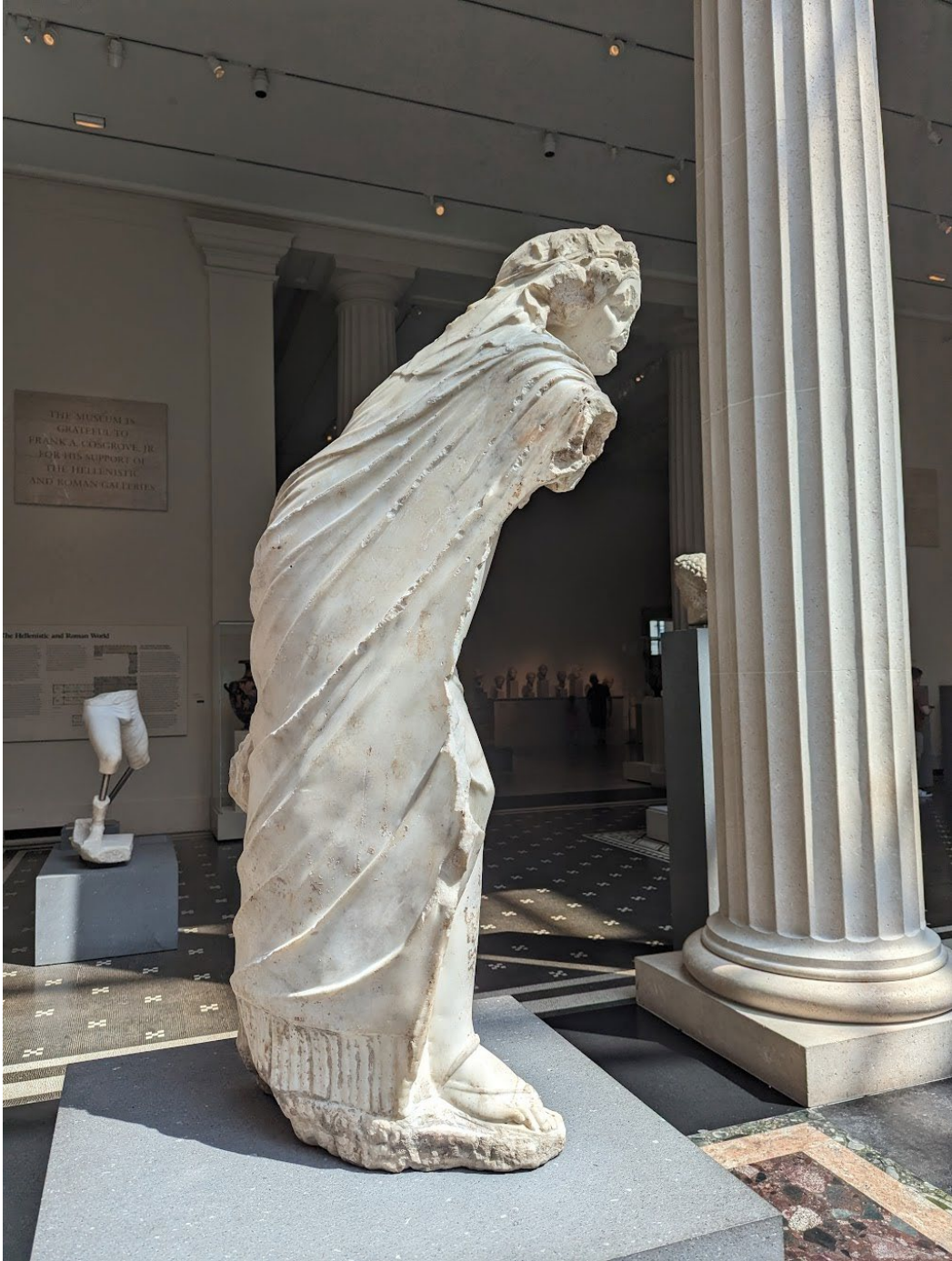
Figure 2: Old Market Woman (hunched over), Metropolitan Museum of Art (September 2023).