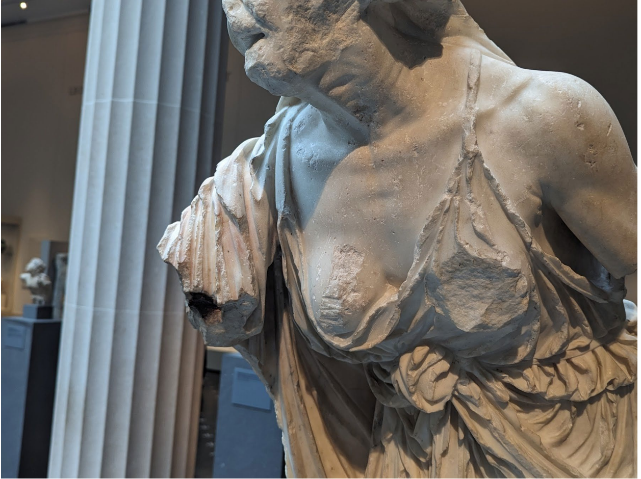
Figure 4: The Old Market Woman's stooped posture and exposed right breast, Metropolitan Museum of Art (September 2023).