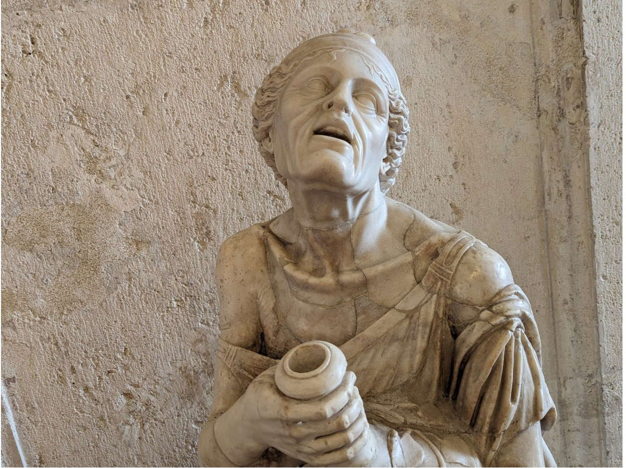
Figure 11: Detail of head and shoulders of the Drunken Old Woman, Capitoline Museums, Rome (September 2023).