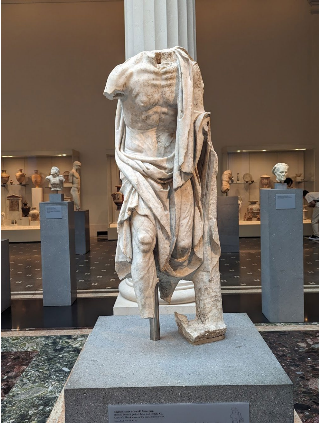
Figure 7: Old Fisherman, Metropolitan Museum of Art (September 2023).