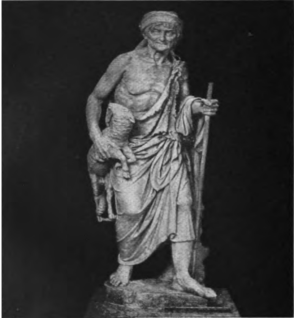
Figure 8: Old Shepherdess with a Lamb, Capitoline Museums, Rome.