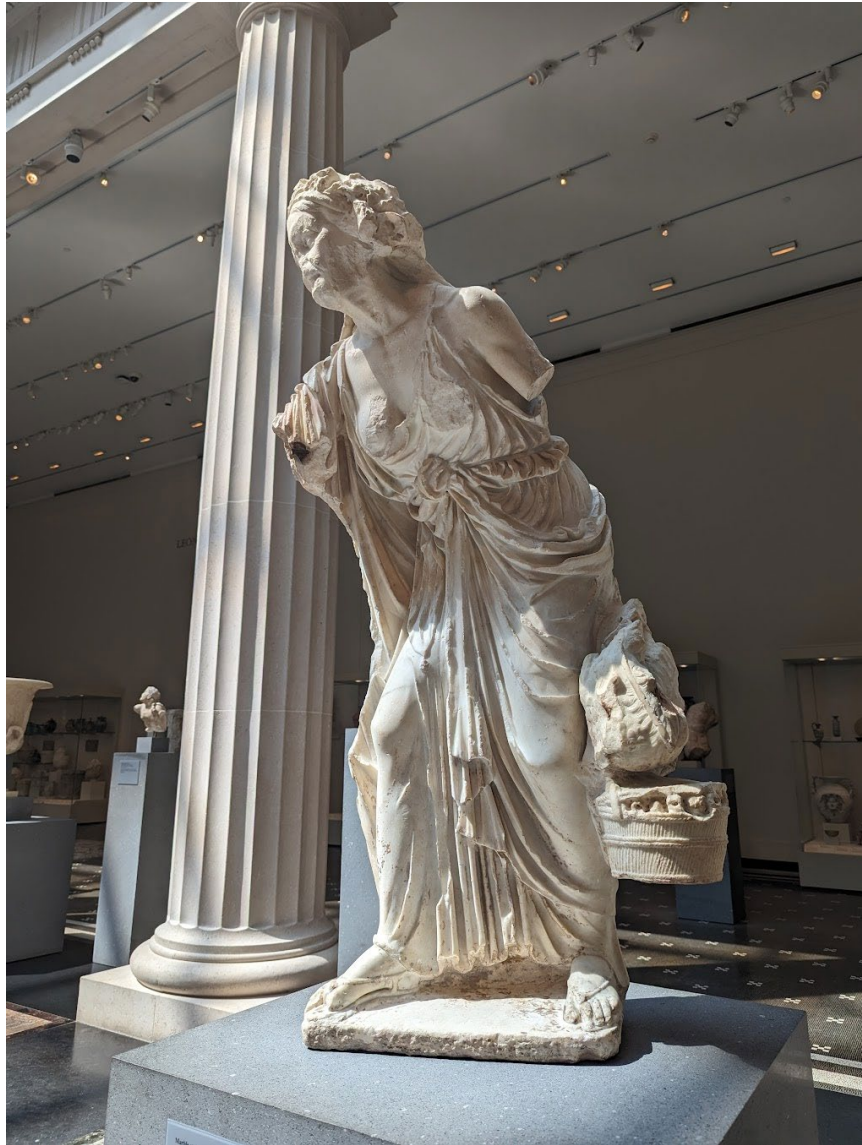
Figure 1: The Old Market Woman in the Metropolitan Museum of Art (September 2023).