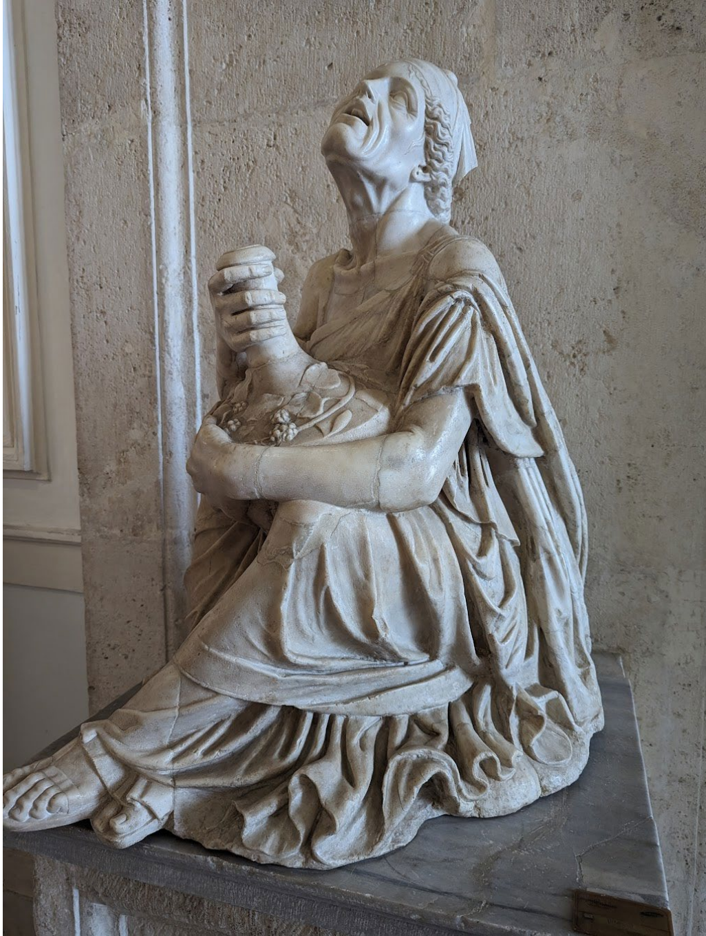
Figure 10: Drunken Old Woman, Capitoline Museums, Rome (September 2023).