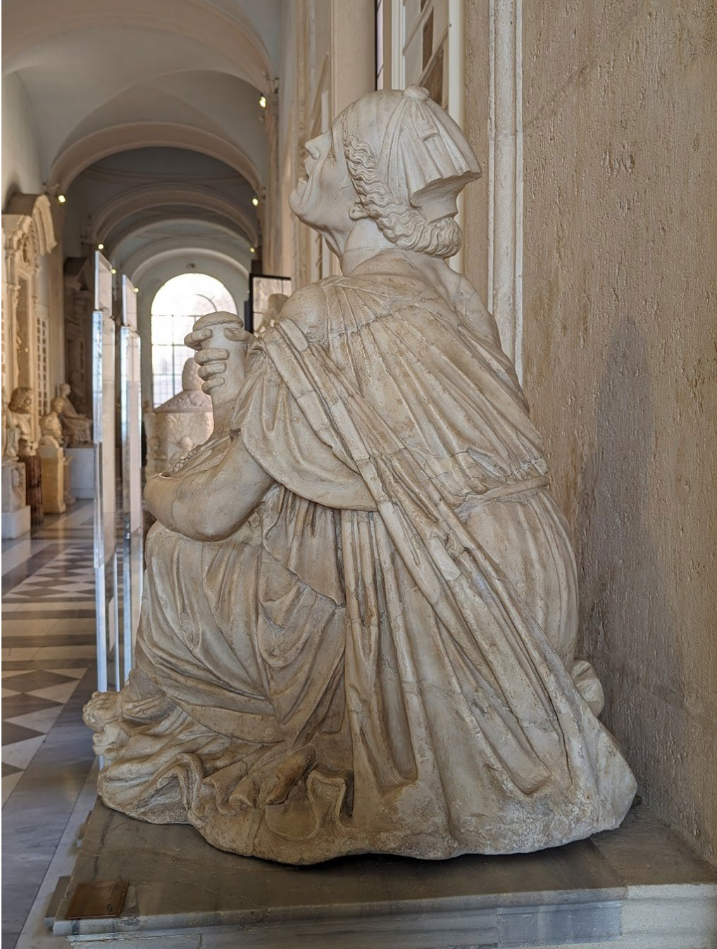
Figure 12: Detailed backside of the Drunken Old Woman, Capitoline Museums, Rome (September 2023).