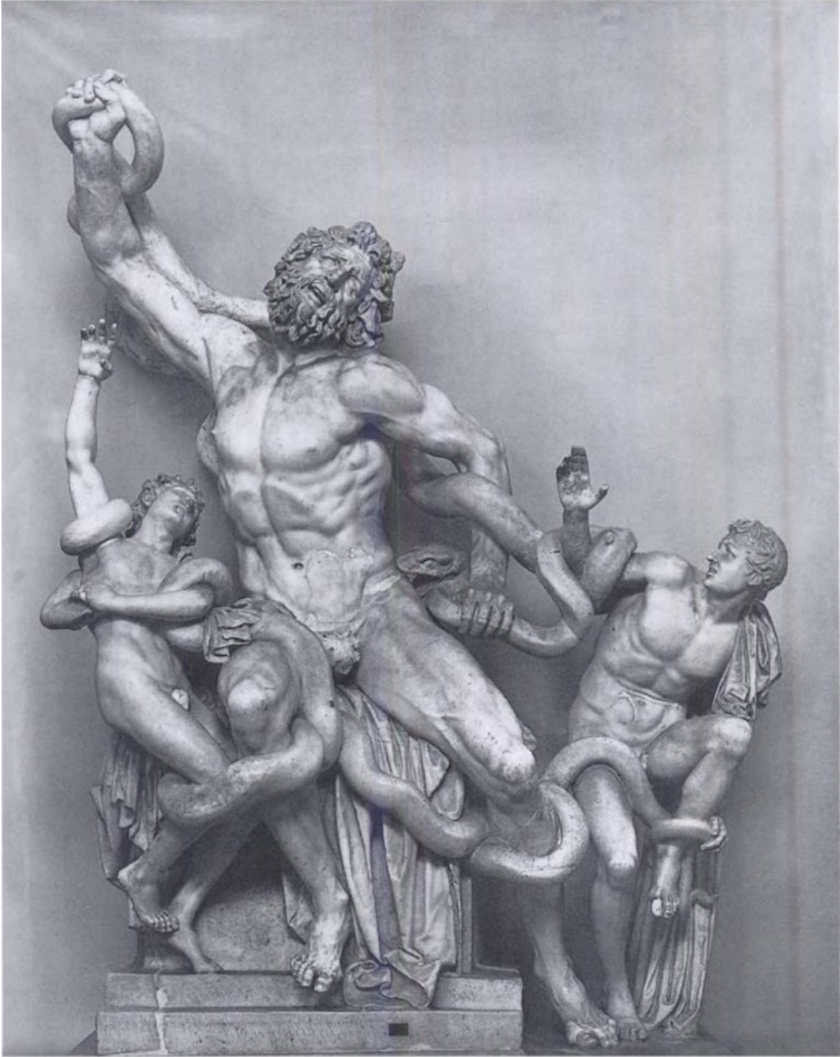
Figure 9: Laocoön, Vatican Museum, Rome.