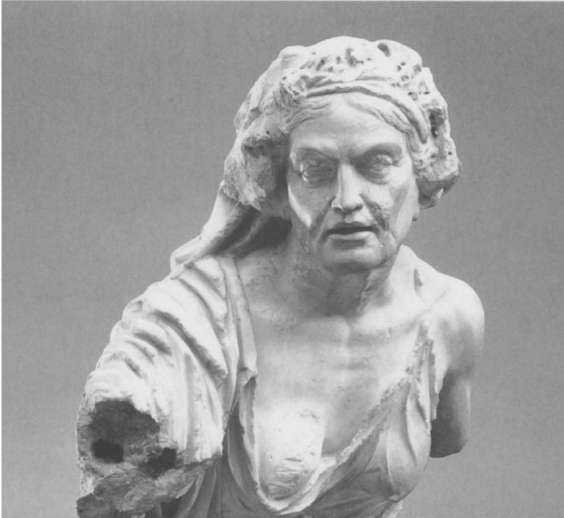
Figure 6: Attempted reconstruction of the Old Market Woman's face in 1909.