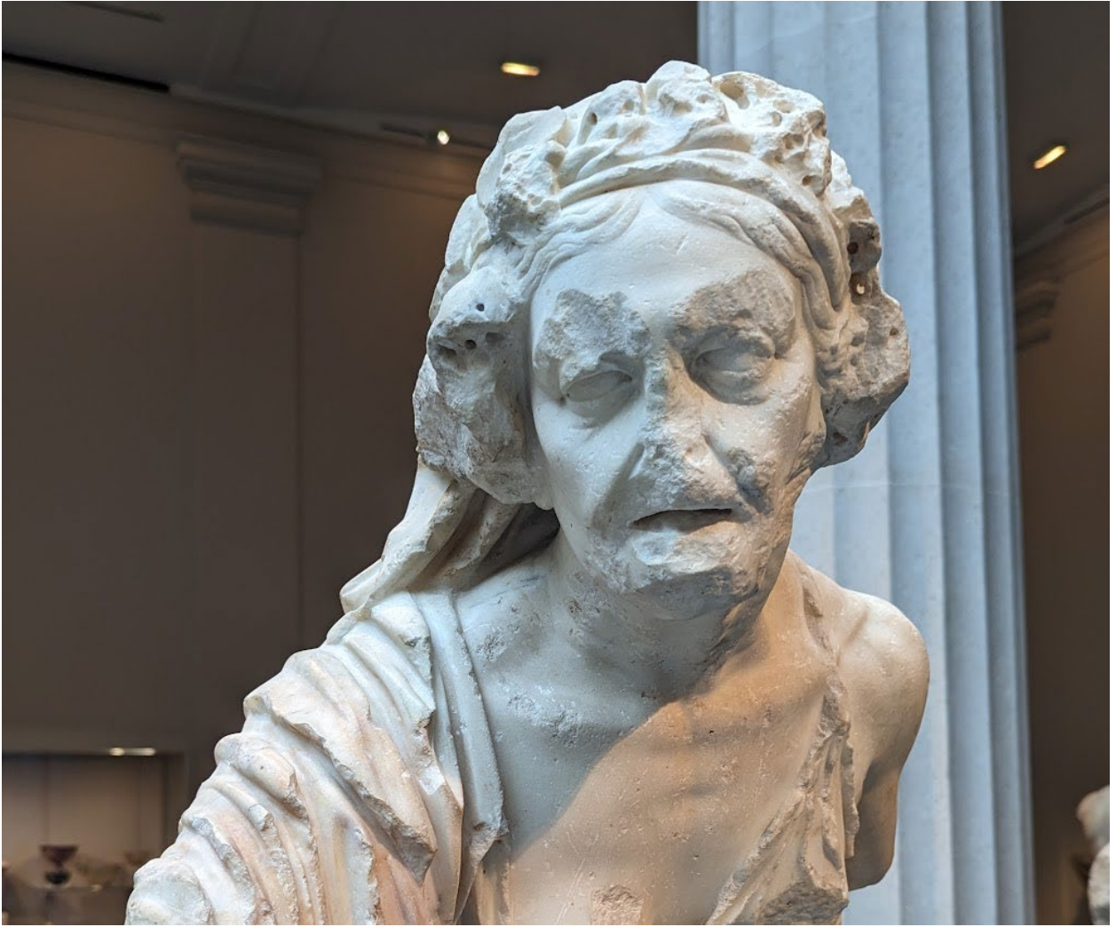
Figure 5: Close-Up of details of face of Old Market Woman, Metropolitan Museum of Art (September 2023).