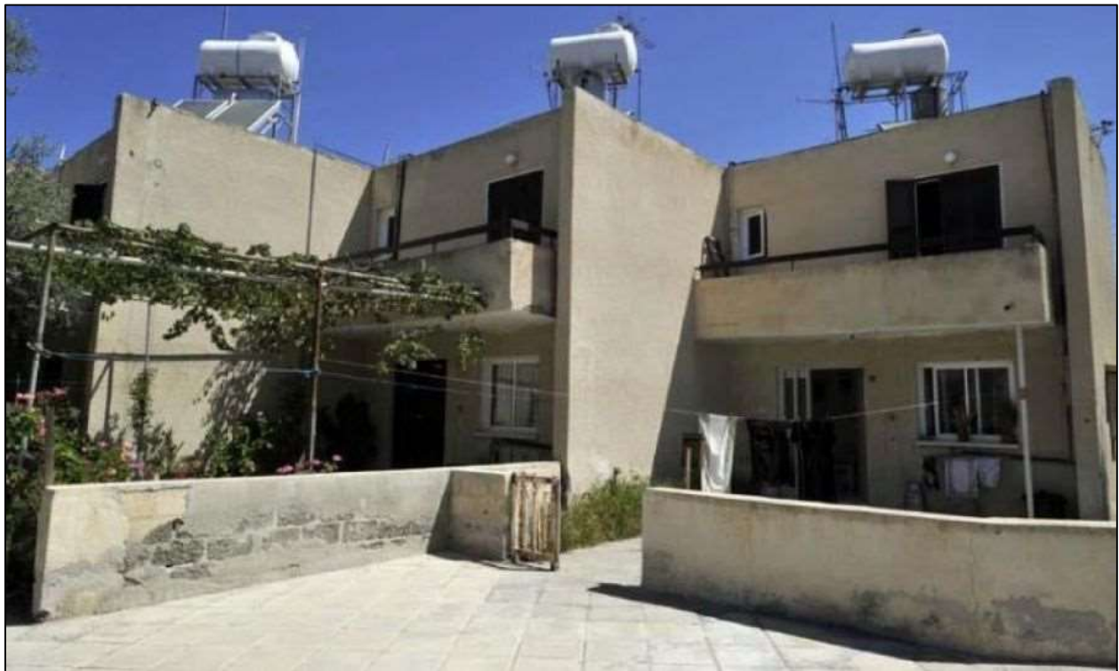
Figure 2.2: Refugee Housing Provided to Displaced Greek-Cypriot Peoples in the South After the 1974 Turkish Invasion

As a result of the conflict, all the residents of the villages that were invaded and occupied cannot return to this day. The occupation has been deemed illegal under international law, and yet Northern Greek Cypriots, while having legal ownership over their land, cannot do anything about taking back physical access and use of their land. As a result of this, Northern Cypriots were considered refugees and were sent to live in refugee housing where many, such as my own grandfather, have lived since the invasion and beginning of the occupation, which has now surpassed its 50th anniversary.