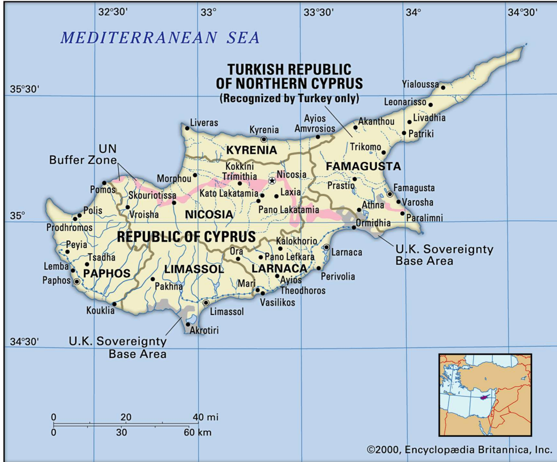
Figure 2.1: A Map of the Island of Cyprus