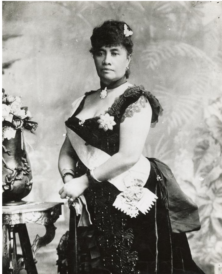
Fig. 1. Queen Lili'uokalani, scholar and activist.

valuable to Hawaiian culture. Therefore, Lili‘uokalani’s commitment to preserving certain words in ‘ Ōlelo Hawai‘i ’ is in fact an act of cultural preservation, seeing as the language communicates a great deal of cultural ties that cannot be wholly translated in English.