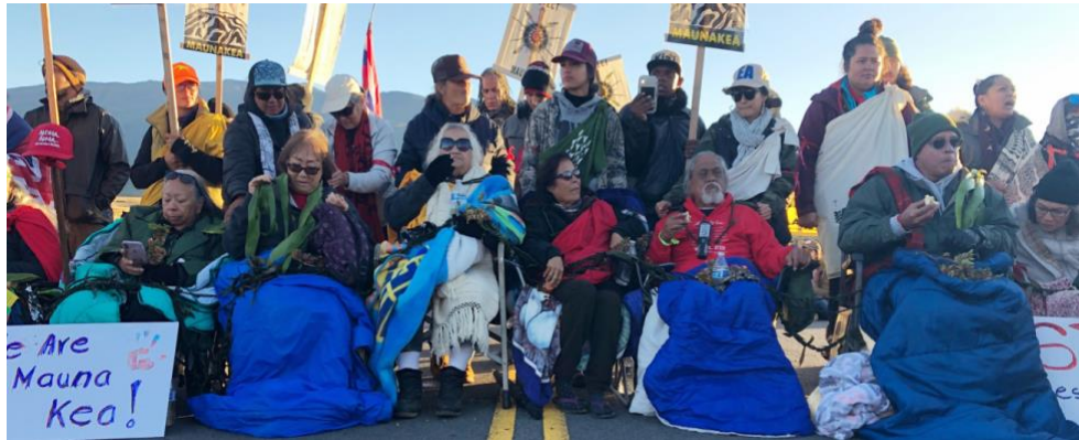
Fig. 2. Peaceful protestors gather to object to the construction of the Thirty Meter Telescope on Mauna Kea.

corrector and our guide" (Goodman). The dormant volcano is not just a stunning summit; it also plays all of these roles that Case astutely acknowledges. And it is also only one site of many at which the modern colonialism of Kanaka 'āina and Kānaka Maoli persists.