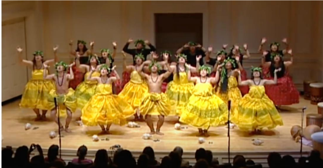
Fig. 5. A screenshot from “Unukupukupu Halau Hula” video, posted to YouTube by Library of Congress.