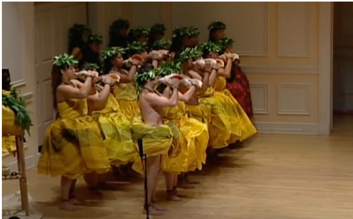
Fig. 6. A screenshot from “Unukupukupu Halau Hula” video, posted to YouTube by Library of Congress.

Another means by which reverence toward land, or ‘āina , is expressed in this dance is through the playing of Pū , or conch shells. The following is a screenshot of the Unukupukupu dancers summoning the elements of the sky by playing the Pū :