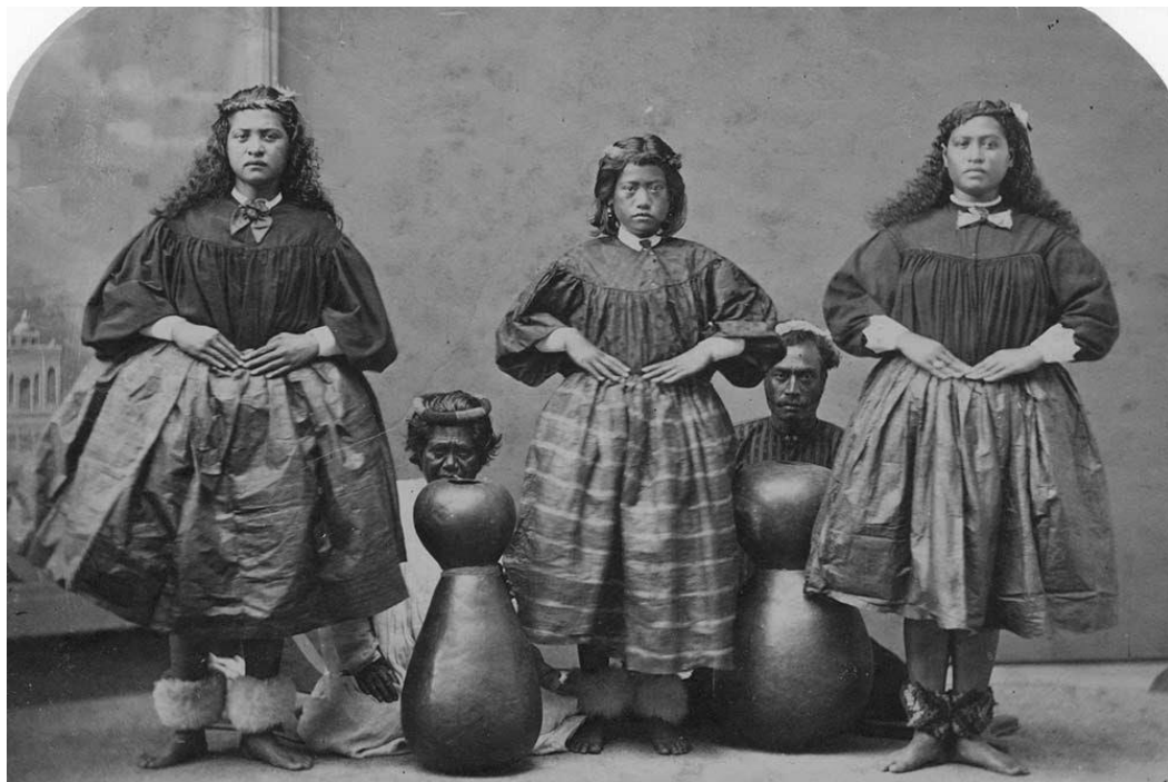
Fig. 4. More conservative, "missionary-approved" wear for hula dancers. Photograph by J.J. Williams (c. 1885). ("History of Hula in Hawaii").