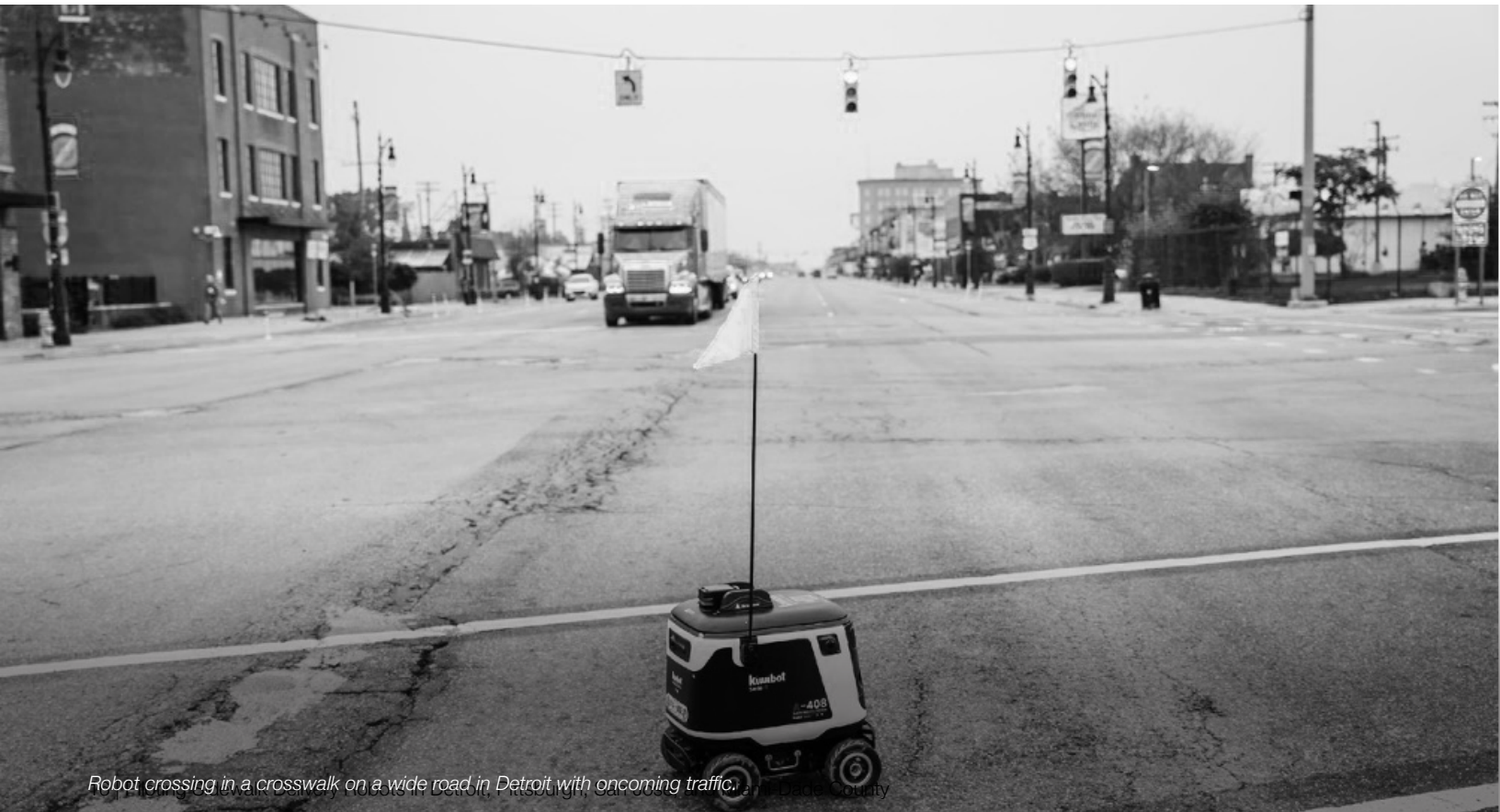
Robot crossing in a crosswalk on a wide road in Detroit with oncoming traffic.