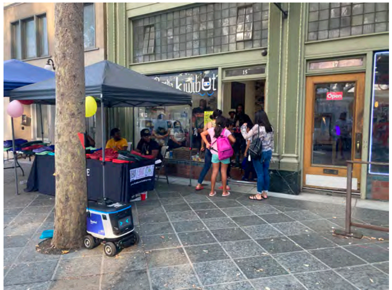
Robot on the sidewalk in front of the Paper Moon Café in Downtown San José with people crowded around the restaurant.

At the outset of the Knight AV Initiative in September 2018, all four jurisdictions had passenger AV pilot projects in development, and the purpose of the Knight funding was to support engagement efforts to ensure community voices were centered in the conversations about AVs. For a host of reasons—including the start of the COVID-19 pandemic in early 2020—plans changed and the pilots involving passenger AVs were halted.