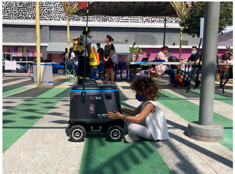
A child sits in front of a robot during a community event in San José.