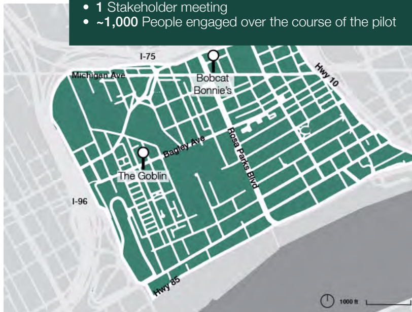
Map of Detroit deployment areas