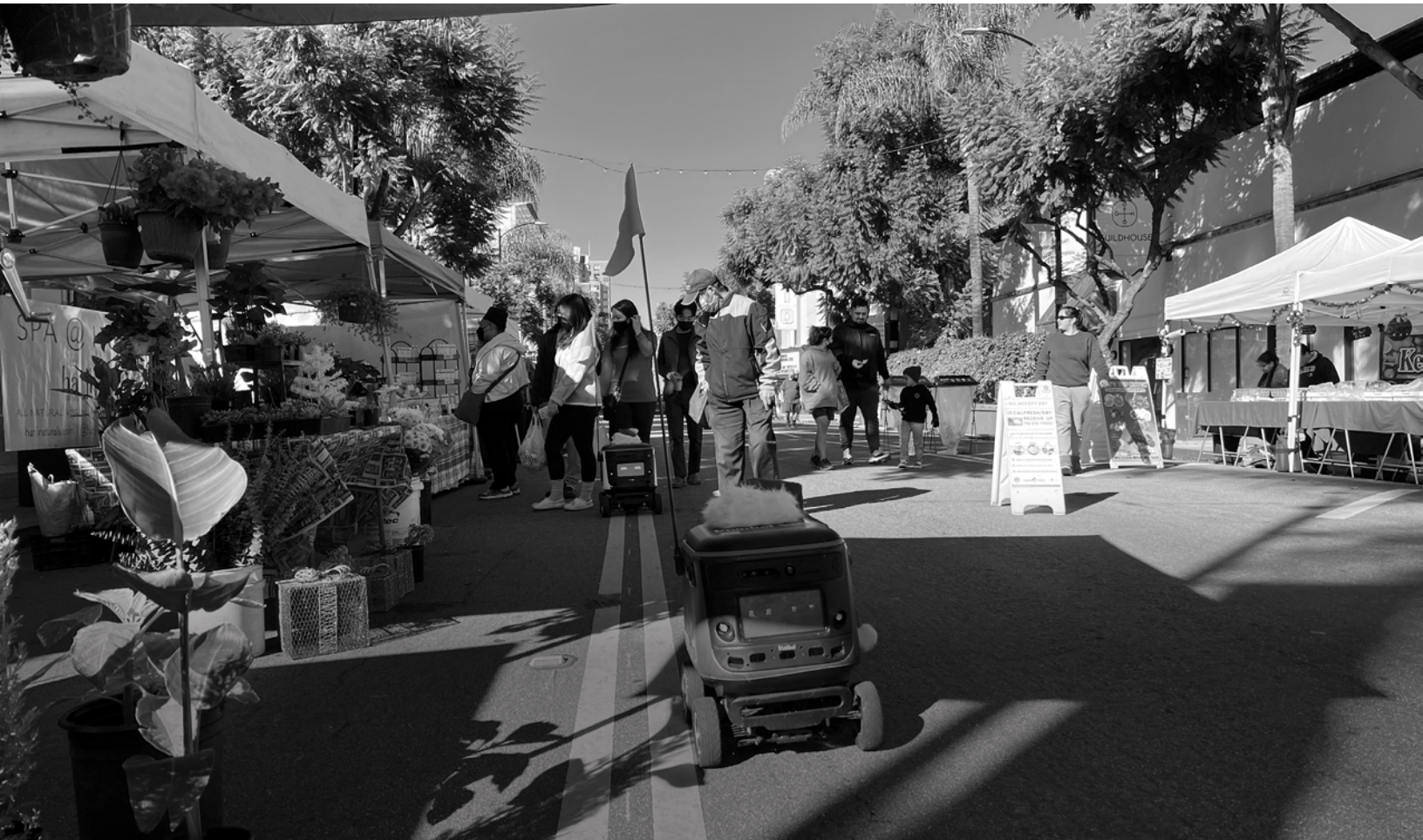
Robots operate on a closed street during a farmer's market event in San José.

Following the pilot details, we discuss our key findings from the various pilots and offer recommendations for both public and private sector entities interested in pursuing similar or related efforts.