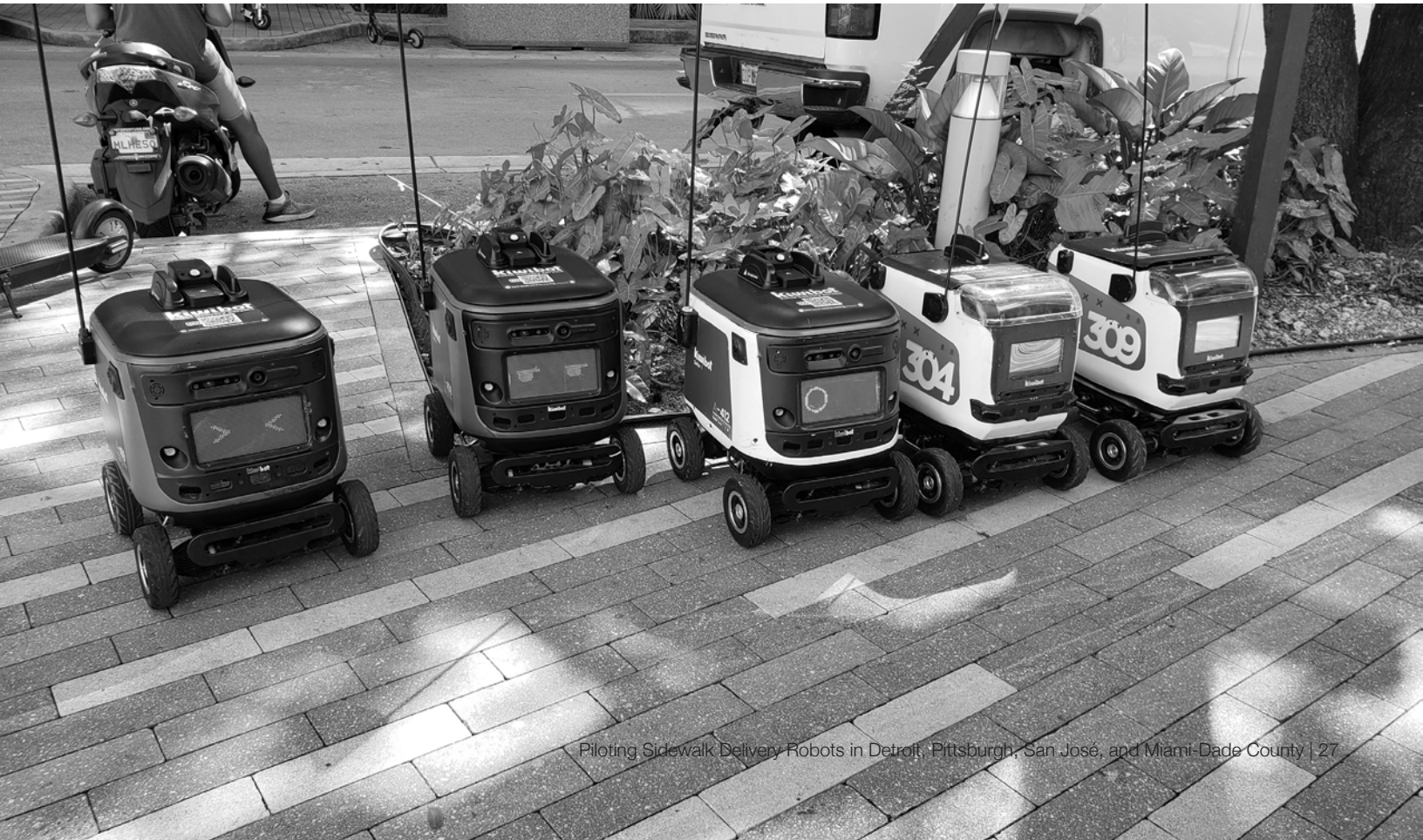
Five robots lined up on a sidewalk in Brickell.

Kiwibot: covers, table of contents, p. 3, p. 4, p. 6, p. 10, p. 14, p. 16, p. 21, p. 22, p. 24, p. 25, p. 27 Google Maps: p. 17