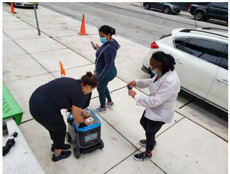
Community liaisons receiving an order during a demonstration event in the Brickell area of Miami.