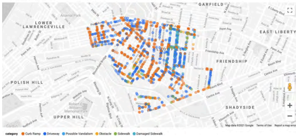
Screenshot of Kiwibot data dashboard for Pittsburgh.