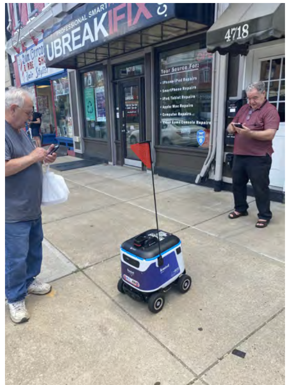
Two people pull out their cell phones to take a picture of a robot operating on the sidewalk on Liberty Ave. in Pittsburgh.