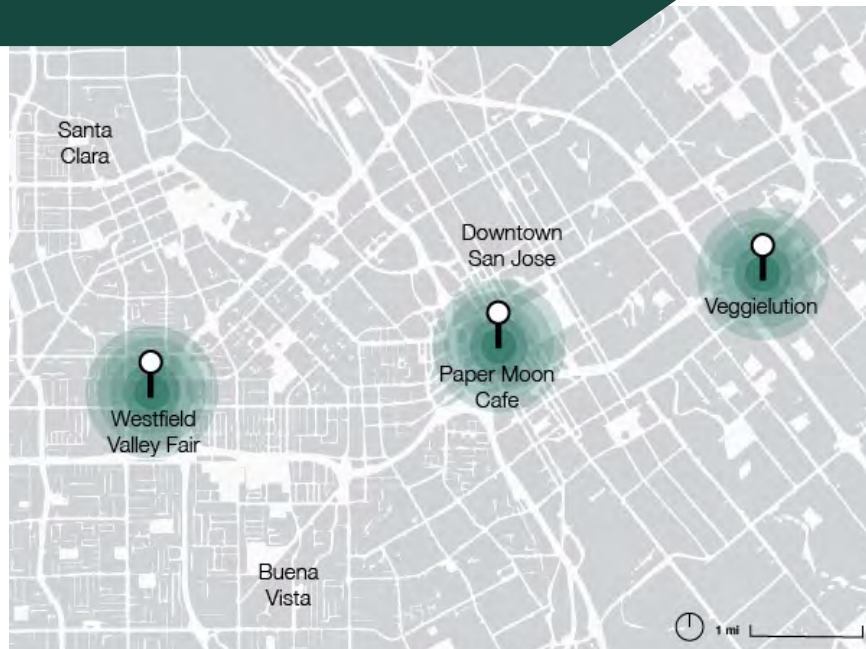
Map of San José deployment areas