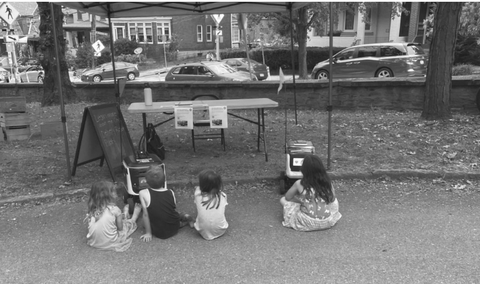
Children sit facing robots in a closed lot during an event at the Lawrenceville Farmers' Market in Pittsburgh.