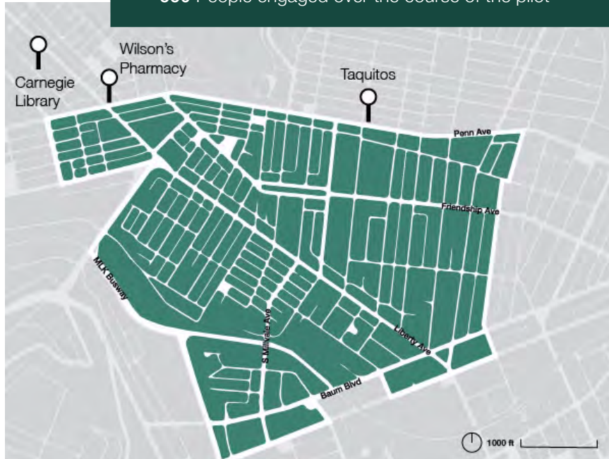
Map of Pittsburgh deployment areas