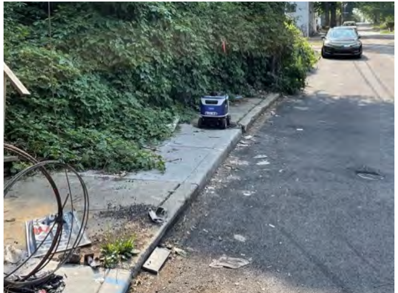
A robot tries to navigate a sidewalk in Pittsburgh that has overgrown foliage and other sidewalk obstructions.

Key Question: What infrastructure/conditions are required for the robots to operate? (E.g., curb cuts, sidewalk width, street connectivity, etc.)