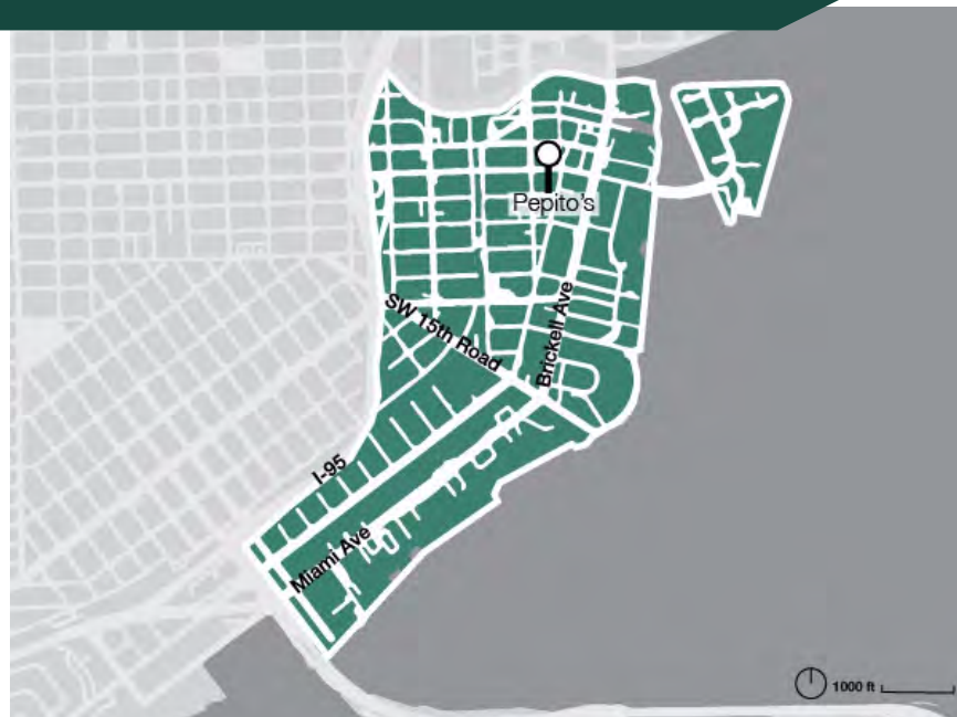
Map of Miami-Dade deployment areas