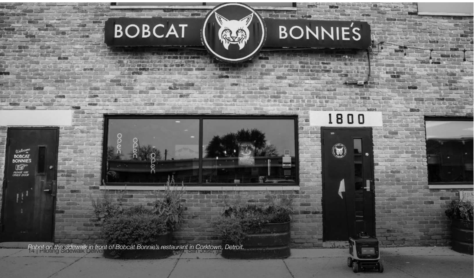
Robot on the sidewalk in front of Bobcat Bonnie's restaurant in Corktown, Detroit.