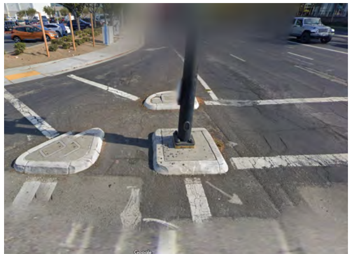
Complicated intersections near the Valley Fair Mall in San José were difficult for the robots to cross.