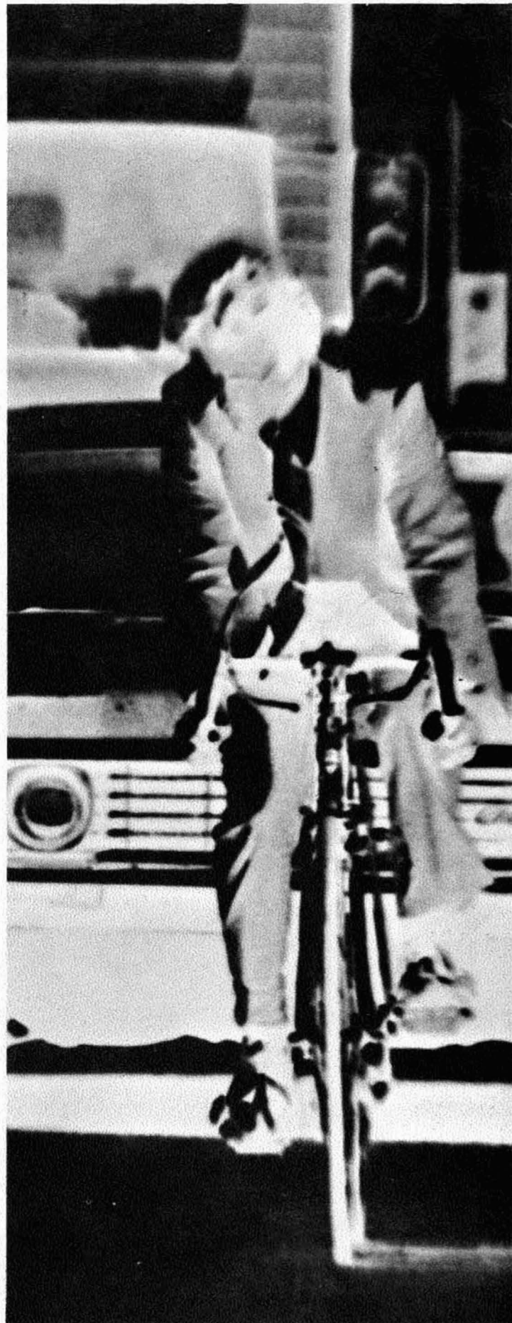
BICYCLE COMMUTER USING A BUSY CITY STREET FINDS THAT SKILL AND CAUTION ARE ESSENTIAL.

In opening or widening of any City street, the appropriateness of a Bike Route should be considered and such a facility should be included if found appropriate.