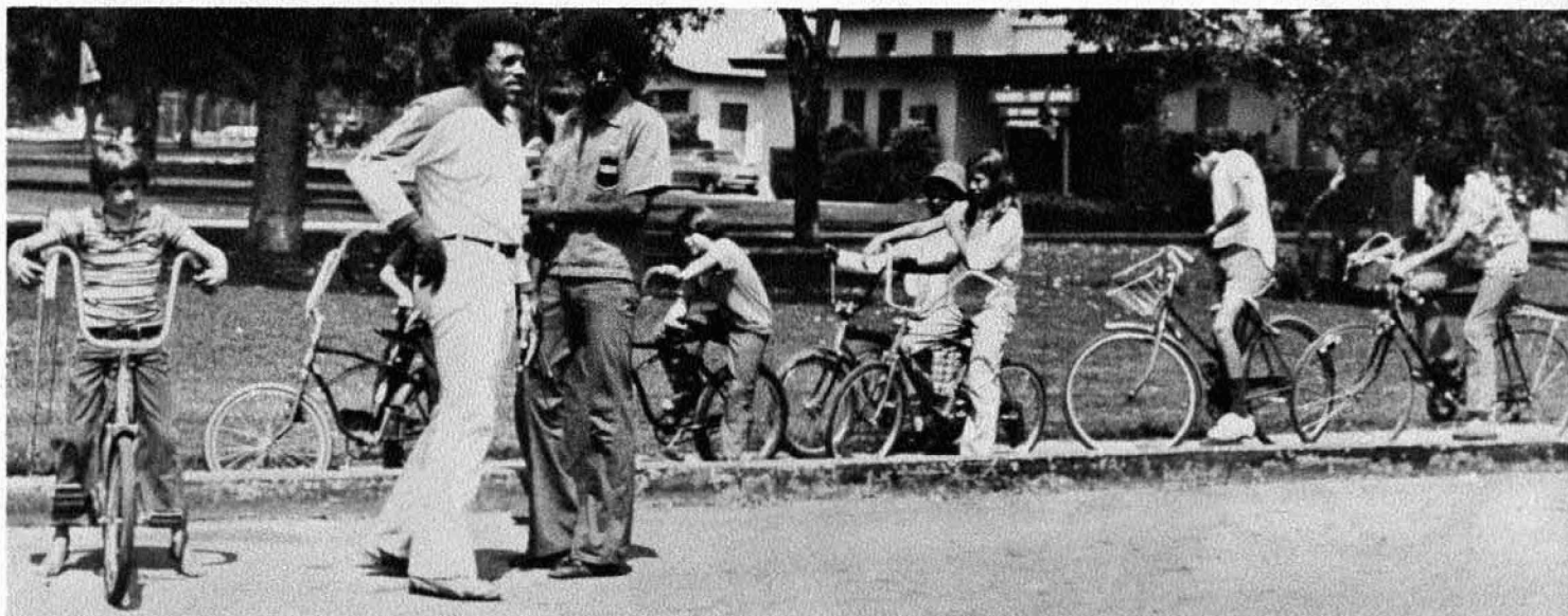
BICYCLE "CLINICS", TO PROMOTE SAFETY, RIDING SKILL AND PROPER BICYCLE MAINTENANCE ARE ENCOURAGED. THIS ONE WAS STAFFED AND SPONSORED BY THE DEPARTMENT OF RECREATION AND PARKS.