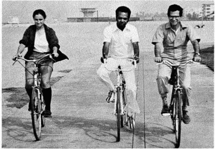
THE VENICE BEACH BIKE PATH IS PART OF A SYSTEM THAT EXTENDS FROM SANTA MONICA TO THE PALOS VERDES PENINSULA.

CHILDREN CAN LEARN TO BE SAFE BICYCLISTS AT AN EARLY AGE, FOR A LIFETIME OF ENJOYMENT WITH A BASIC MODE OF TRANSPORTATION.