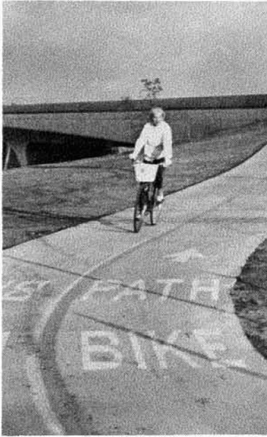
BIKE PATHS PROVIDE SEPARATION OF BICYCLES AND MOTOR VEHICLES.