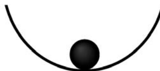
B. Nature is very stable. Nature will return to equilibrium even after large disturbances.