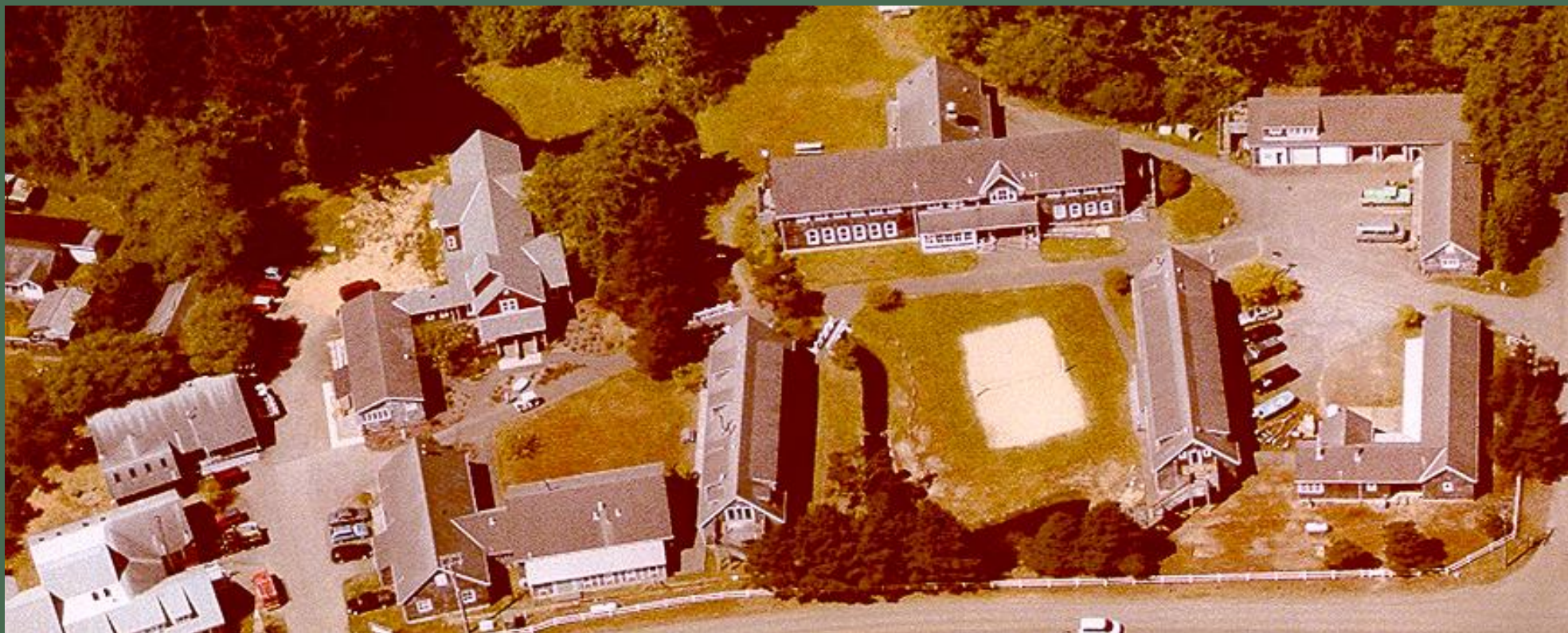
The Loyd and Dorothy Rippey Library is located at the center of the OIMB campus.