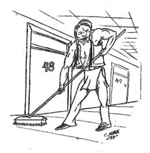
Well, back to the same old grind again! 289