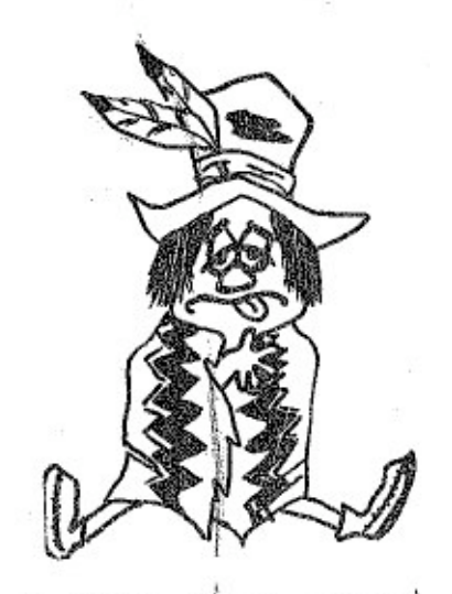
Illustration 7 THE SAD INDIAN

ON CERTAIN DAYS IT IS BEST NOT EVEN TO GET OUT OF BED 291