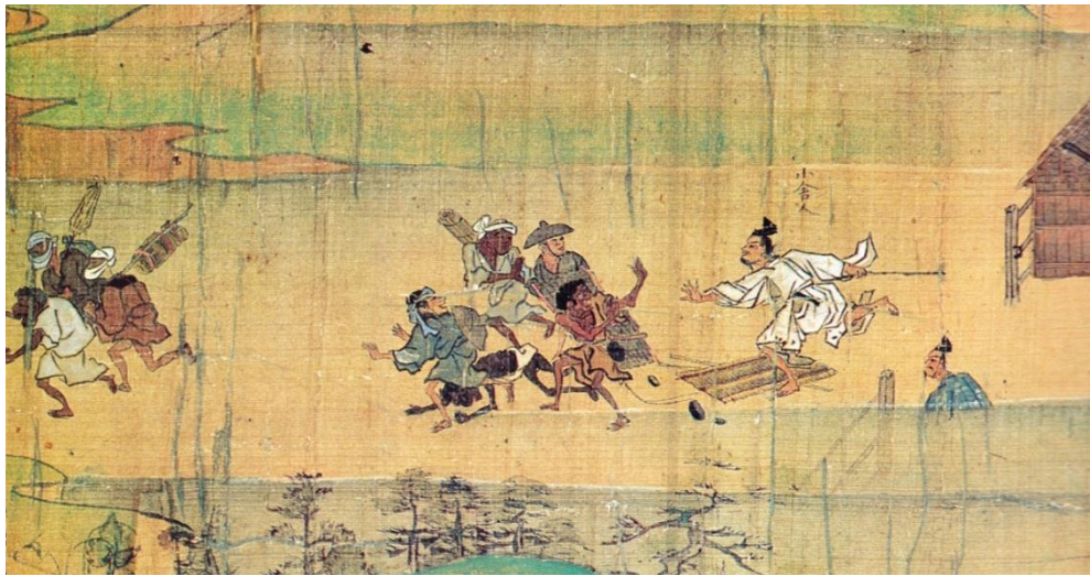
FIGURE 6: Chasing away hinin

Source: Shōkai, Ippen Shōnin Eden , ed, Shigemi Komatsu, (Tōkyō : Chūō Kōronsha, 1988), 141.