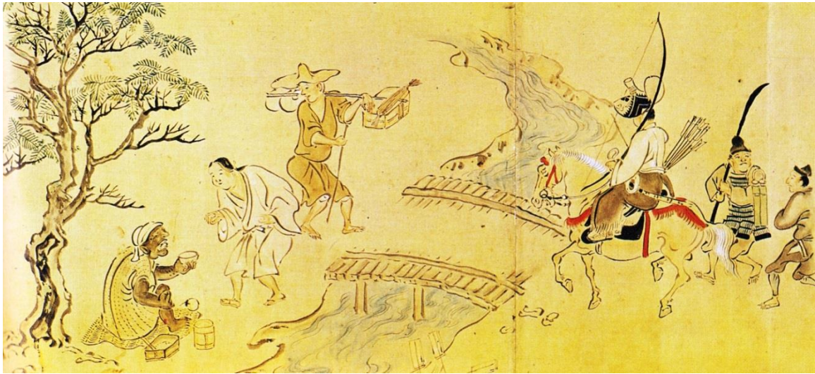
FIGURE 2: Rai Sufferer in the Scroll of Afflictions