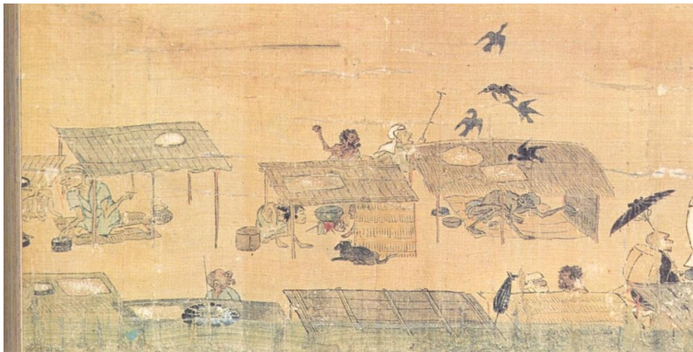
FIGURE 3: Hinin Fighting off Crows Near Kasate Shrine