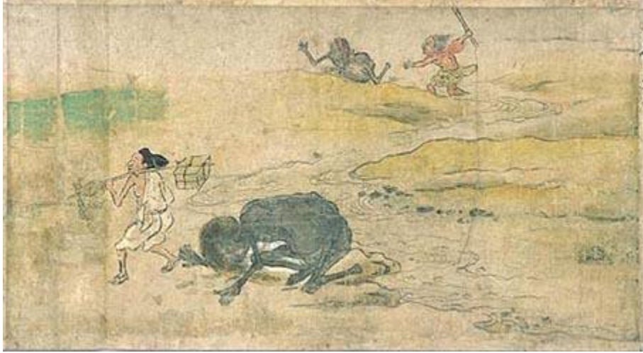
FIGURE 1: A Hungry Ghost from the Gaki-zoshi