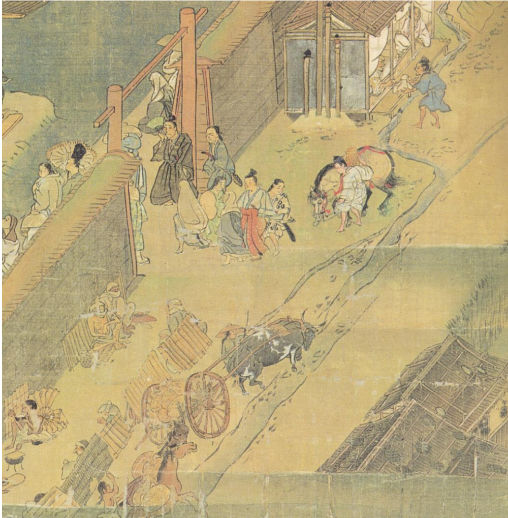
FIGURE 5: Hinin by Sekidera