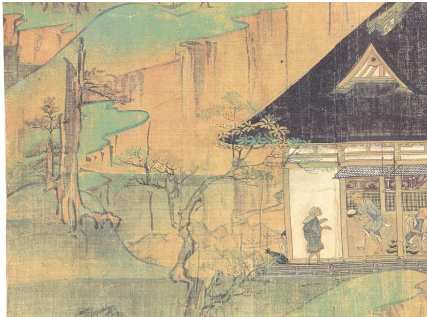
FIGURE 7: Food Preparation Near Taimadera 1