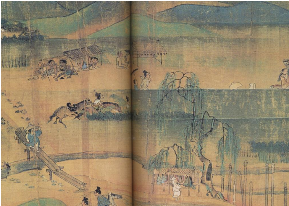
FIGURE 9: Feeding the Destitute in Ueno

Source: Shōkai, Ippen Shōnin Eden , ed, Shigemi Komatsu, (Tōkyō : Chūō Kōronsha, 1988), 238-239.