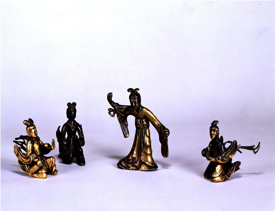
FIGURE 1 The Queen Māyā Ensemble