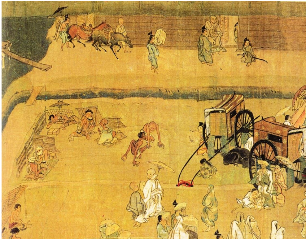
FIGURE 4: Hinin Near Ichihime Shrine