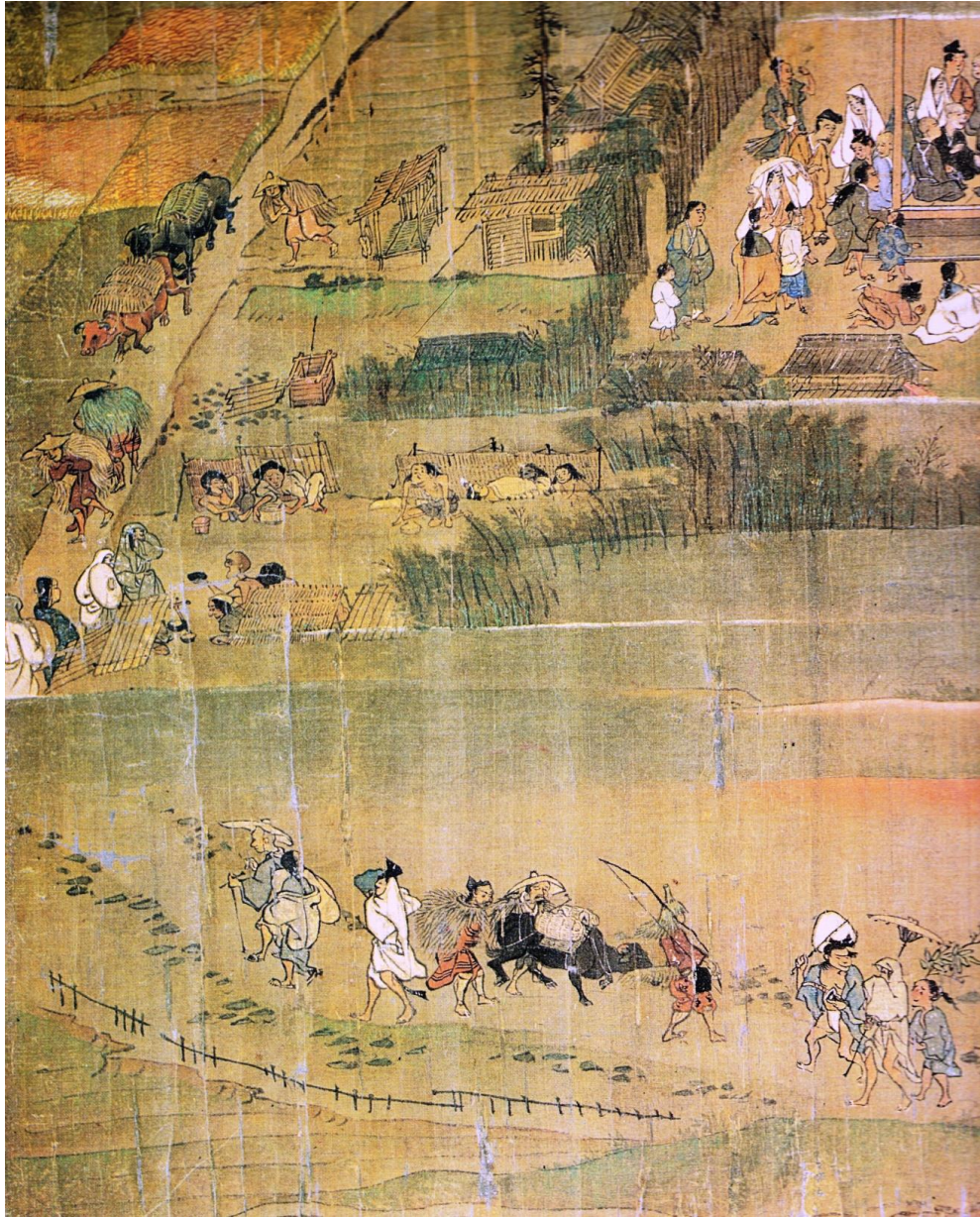
FIGURE 1: Hinin by the Road Near Katsura Hall