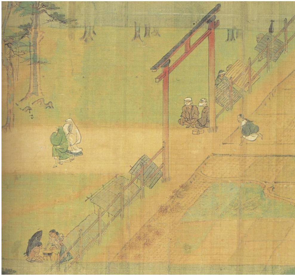
FIGURE 10: Hinin Sitting at the Entrance of Ten Shrine