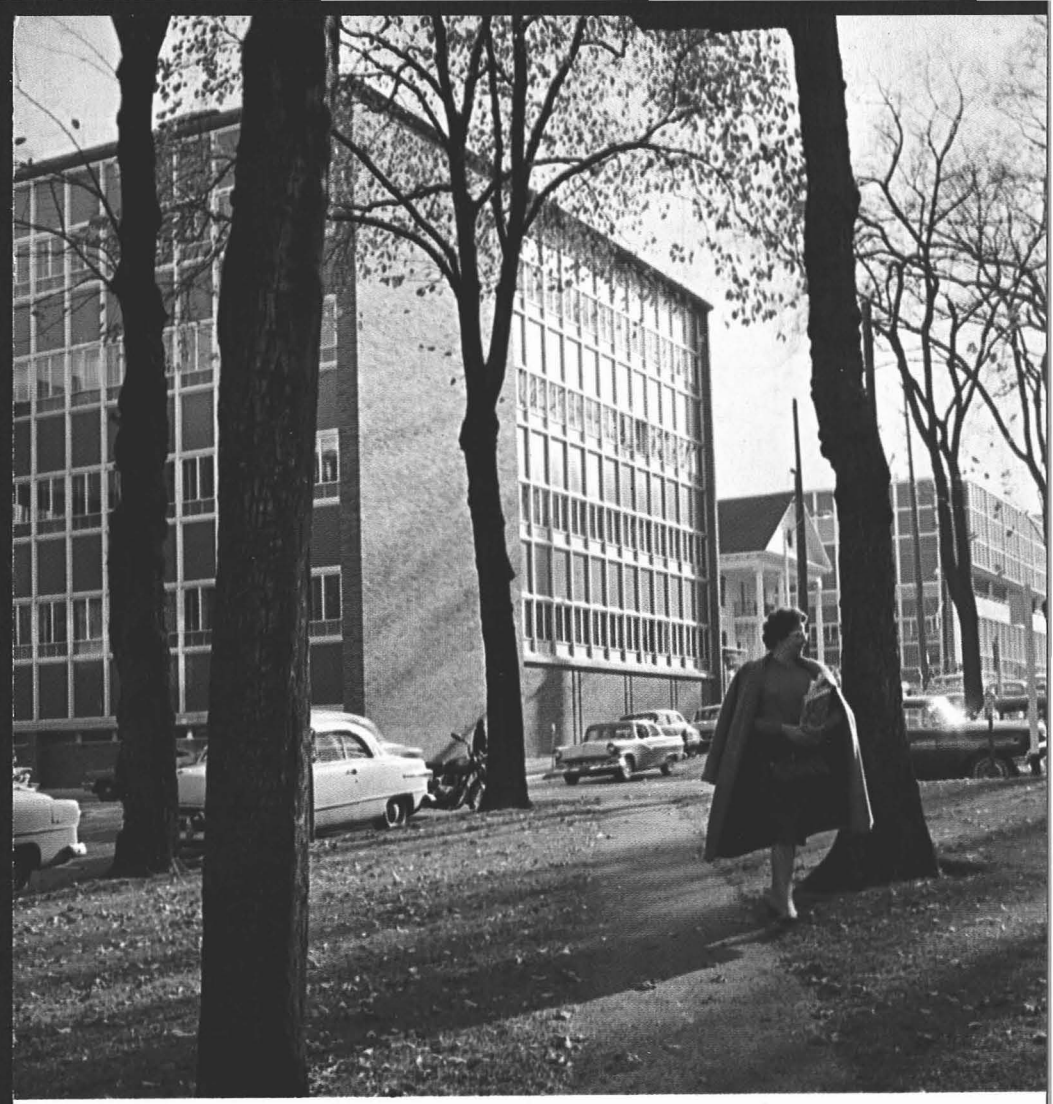
Campus looking south across park