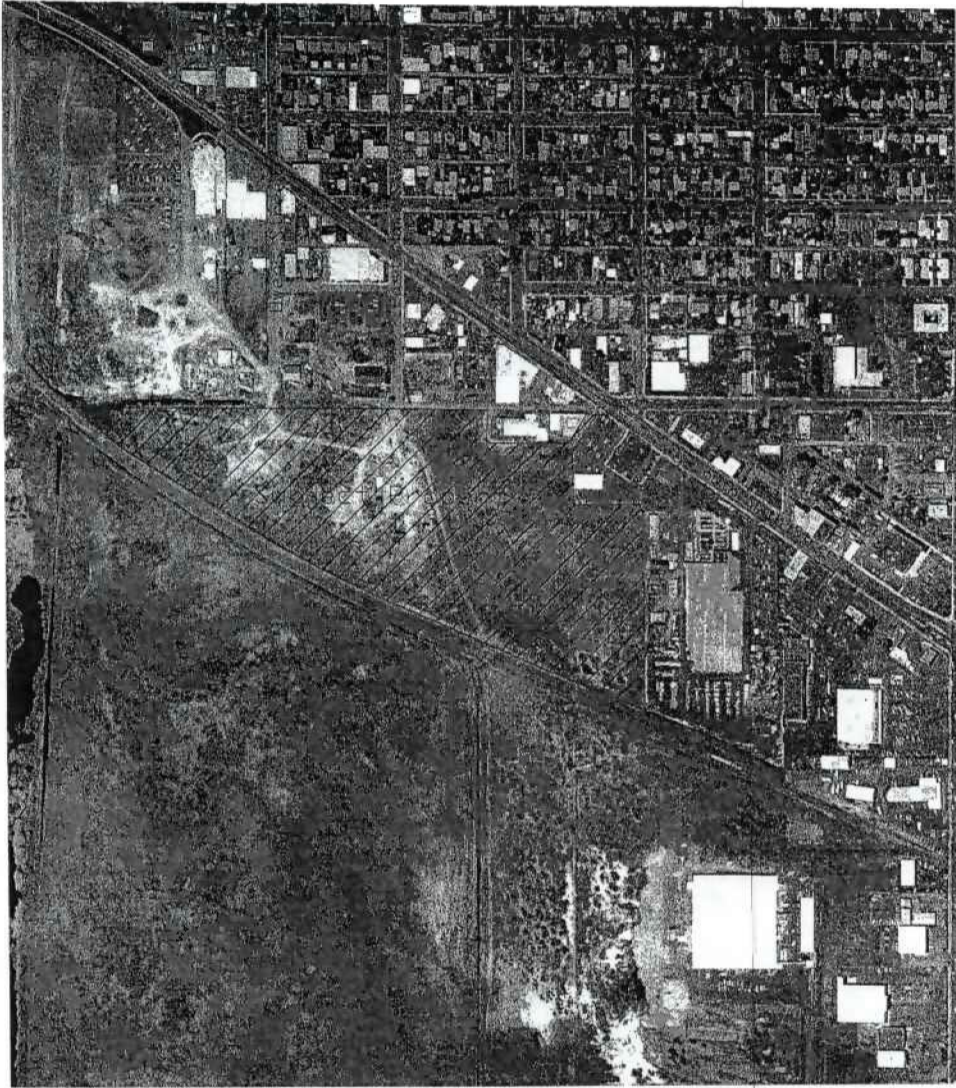
Exhibit B VICINITY MAP No Scale