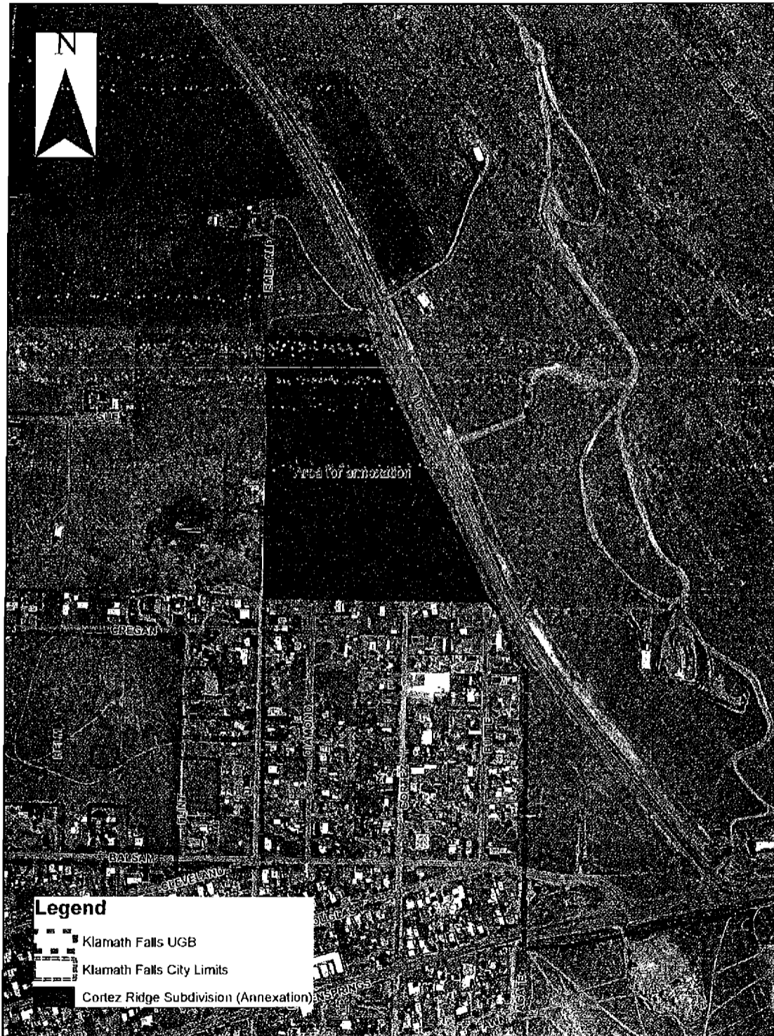
Exhibit A VICINITY MAP