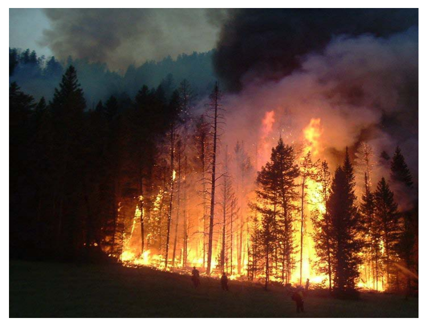
Firefighters from Paradise Valley FSA, Park County RFD #1, and the Gallatin National Forest worked together successfully save structures in the Passage Falls subdivision prior to the arrival of the main flaming front during the 2007 Wicked Creek Fire.

Cooperation between agencies continued to prove beneficial during the series of large fires experienced in 2006 and 2007. The Park County Fire Council , composed of the County Fire Warden and local Fire Chiefs, continued to meet at least semi-annually with attendees from the Park County Sheriff's Office, 911 Center, DNRC, the National Park Service, and the U.S. Forest Service. These meetings, combined with Park County's continued participation in the South-Central Zone Operating Group, allowed fire managers, prevention specialists, and other program managers to regularly exchange information on resources, capabilities, management protocols, and agency programs--as well as negotiate common operating plans and mutual aid agreements.