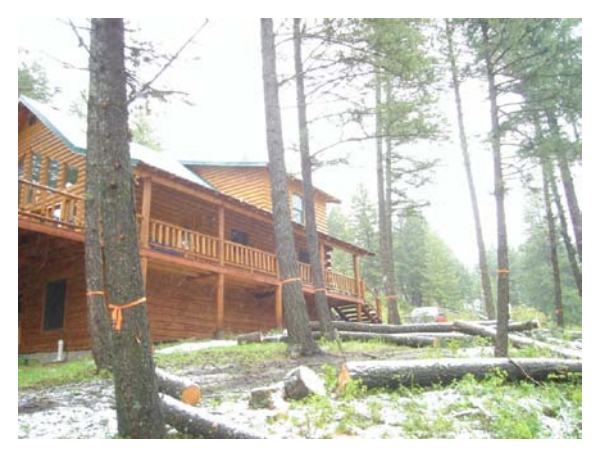
Bronsky property after 2007 treatment