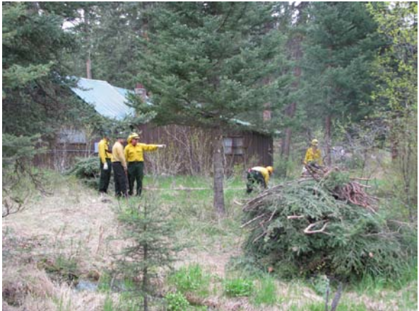
Firefighters learned hands-on skills such as chainsaw operation during the Luccock Camp training event