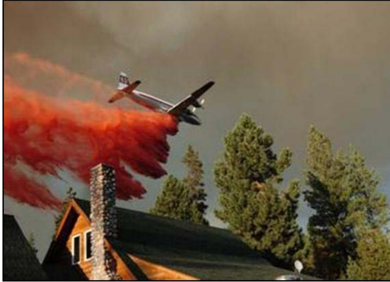
Park Fire, La Pine, Oregon 2005