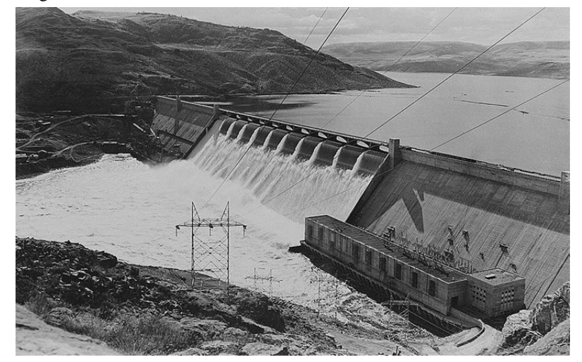
Figure 1: Grand Coulee Dam<sup>1</sup>

The advent of the turbine created a landscape where we could develop a significant source of power in the United States that was, and is, touted as a clean, green, low-carbon footprint source of energy. Today, as was the case even at the time that hydropower was gaining prominence, we disagree about whether and to what extent hydropower is clean, whether it is green, and about its carbon footprint. Despite these debates, it is hard to discount the comparative advantages of hydropower in terms of its carbon footprint versus other forms of energy, particularly coal. Understanding hydropower's