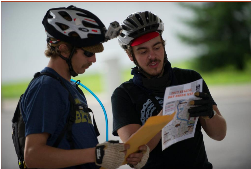
Image 12: Riders collaborate before the Eugene DRT race on the best routes to each checkpoint.