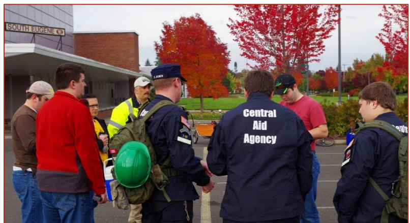
Image 18: HAM radio volunteers in Eugene get briefed before being dispatched to checkpoints.

operators into the event planning process. Their view all along was to use this event as training for the HAM radio operators.