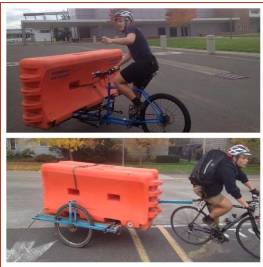
Image 13: Cascadian Courier Collective delivers barriers for the race course in Eugene.

[The DRTs] will shift the really unfortunate paradigm that bikes are toys. They become really important tools when gas is rationed, infrastructure is broken, and communication is spotty. It's just a no brainer that a bike in a garage is better than walking and I can carry something with it. That's going to happen in a disaster. Why not take the low cost preparations to make the inevitability easier? They might as well make your community more resilient (M. Cobb, personal interview, April 18, 2014).