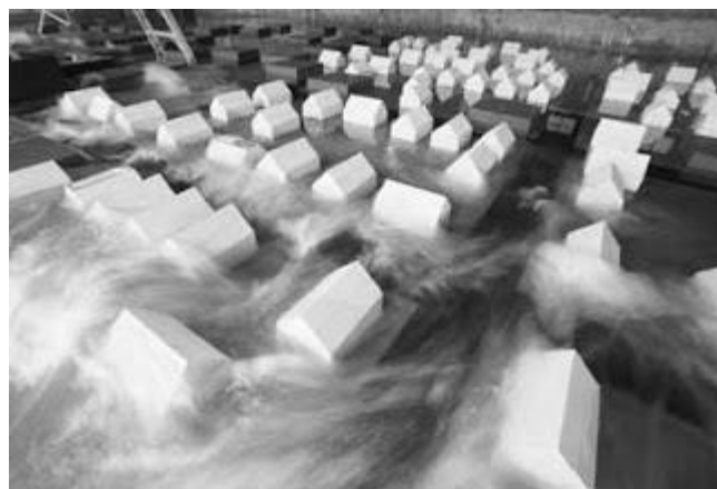
Image 1: A tsunami simulation in Seaside, Oregon, in August 2007. The wooden blocks represent residential dwellings, single-story commercial buildings, and multi-story condominiums or hotels.

DRTs are bicycle races with the backdrop of a simulated post-disaster scenario. The event mimics “alley cat” races, which originated as informally organized events by bicycle messengers. Typical alley cat races include checkpoints, tasks, and point accumulation to determine the finishing order. The DRTs are based on the