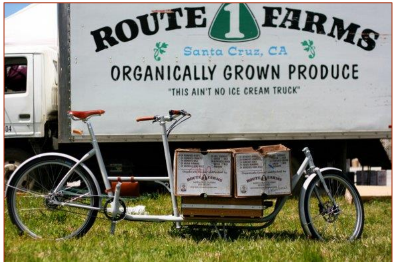
Image 10: Produce can be delivered by bicycle