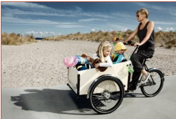
Image 4: Front loading cargo bicycle

Cargo bicycles are high-capacity bikes used to transport various types of goods. There are many different styles of these bikes, but almost all carry loads in the front or rear. While some have built in boxes (see Image 4), others use an improved rear-rack carrying system (see Image 5). The types of cargo people carry is only constrained by physics. People have incredible imaginations for the use of cargo bikes, including but certainly not limited to the images on pages 12 and 13. In essence, the cargo bicycle is probably the most efficient, independent, and utilitarian mode for local transport. While some cargo bicycles have integrated new technologies such as electrical assist motors, the majority of them are solely human-powered vehicles, making them extra resilient in the chaotic and disrupted infrastructure in the aftermath of disaster. The