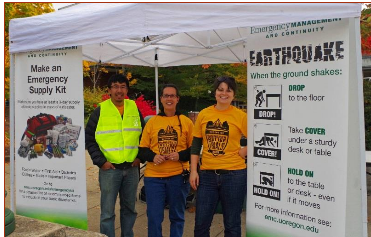
Image 16: University of Oregon Emergency Management and Continuity Program staffed a booth at the DRT in Eugene.