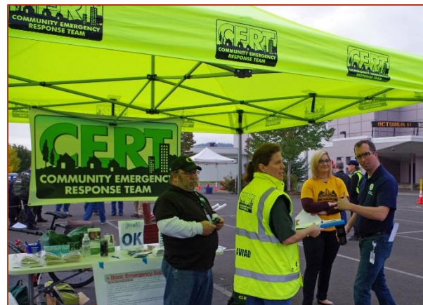
Image 17: CERT volunteers hosted a booth at the event to help educate and prepare households.

For all organizers, participants, and partners, integrating the format of the race with a realistic exercise was an important aspect to pursue further. The one change that Eugene organizers are making for 2014 is to simulate how bicycles would best be used and incorporated into the local disaster response framework. This will include modifying the structure of the race. In 2013, organizers chose South Eugene High for because it is designated as a POD, but organizers and city staff all felt that the model of only starting and finishing the race at the POD impacted the effectiveness and excitement of the fair location, and also did not simulate a realistic response model for bicycle-mobilized response.