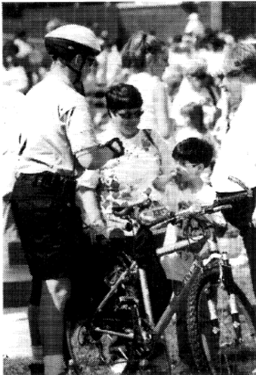
Gaston County's BERT was on the scene at the Special Olympics in Cherryville, N.C., in 1998.

The annual Fish Camp Jam in Gaston County, N.C., regularly draws about 150,000 attendees for food, music and fun. But, like every large outdoor event, the annual fes-