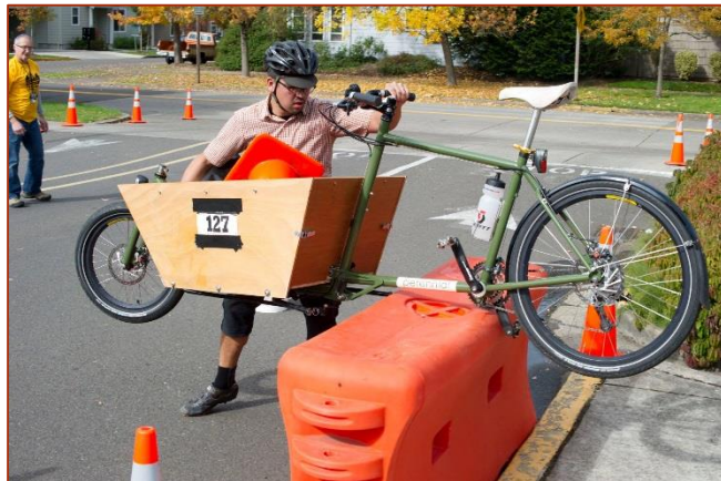
Image 14: A DRT rider lifts his bike over a 3-foot barrier as a part of the course challenges.

The race included tasks for riders that tested the carrying capacity of the participant by carrying an “unwieldy” object (a red cone), dropping 20 cans of food at a checkpoint, carrying eggs throughout the race (to simulate precious medical supplies), picking-up and carrying five gallons of water and five