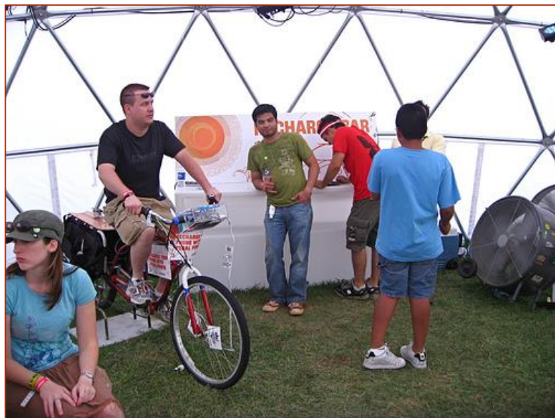
Image 11: A bicycle powering a cell phone charging station.