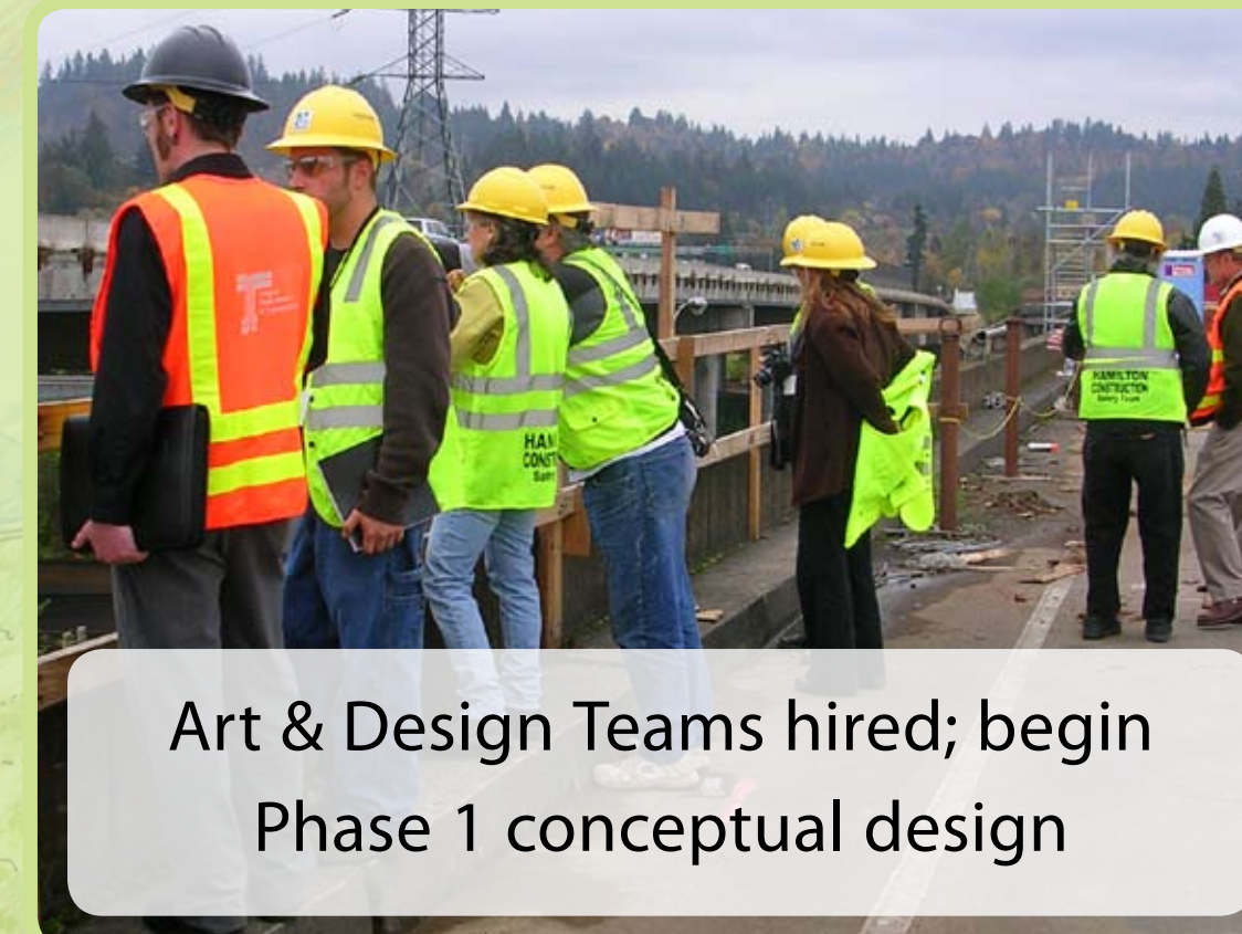
Art & Design Teams hired; begin Phase 1 conceptual design