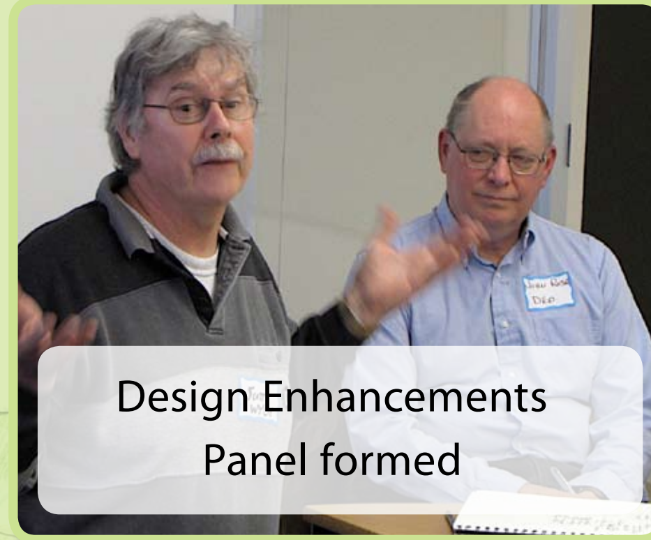
Design Enhancements Panel formed