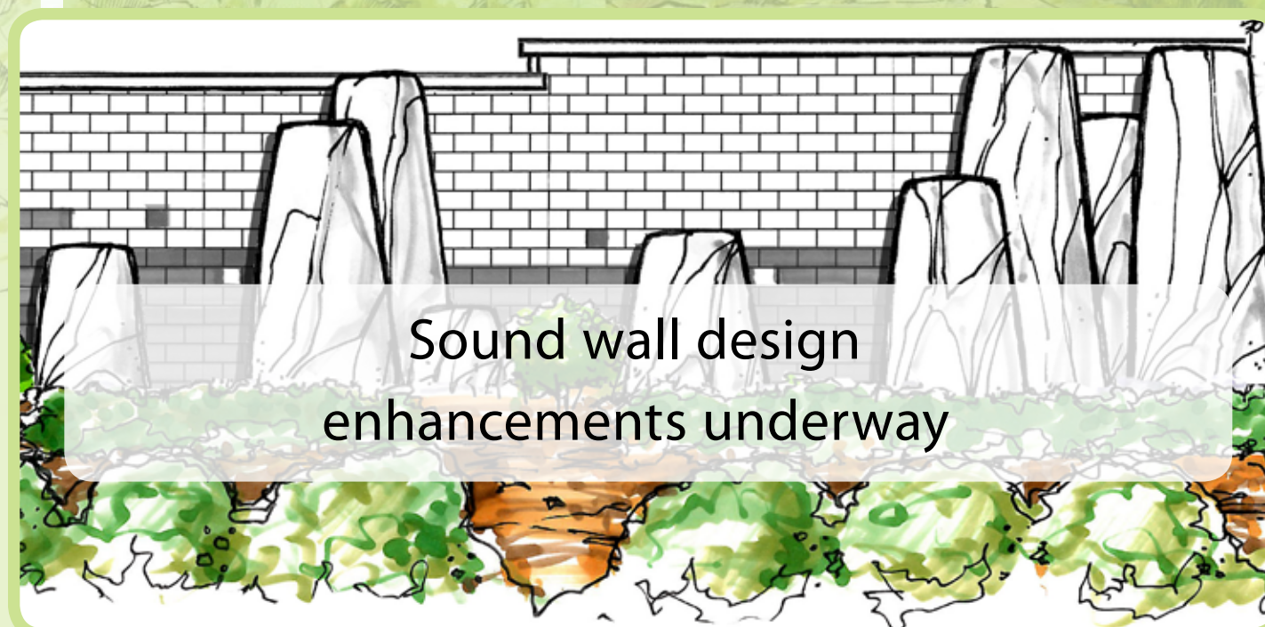
Sound wall design enhancements underway