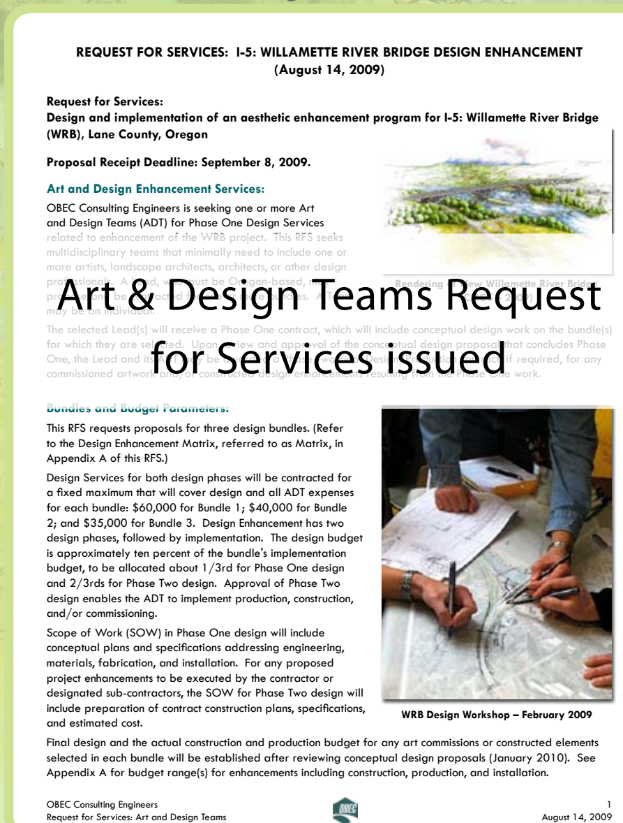
Art & Design Teams Request for Services issued