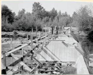
Construction of Diversion Dam.

The concrete remnants at the entrance of the millrace were called the headworks. The headworks created an obstruction across the river, which raised the water level and redirected it into the human-made channel. The elevated level caused the water to be drawn by gravity down the millrace. Pictured below is a diagram of what remains of the headworks and accompanying structures.