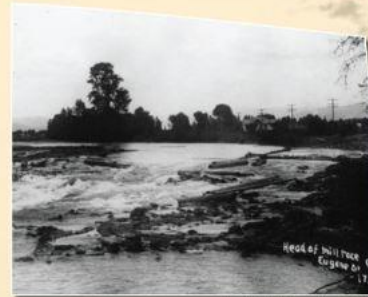
Head of Millrace (c. 1933).