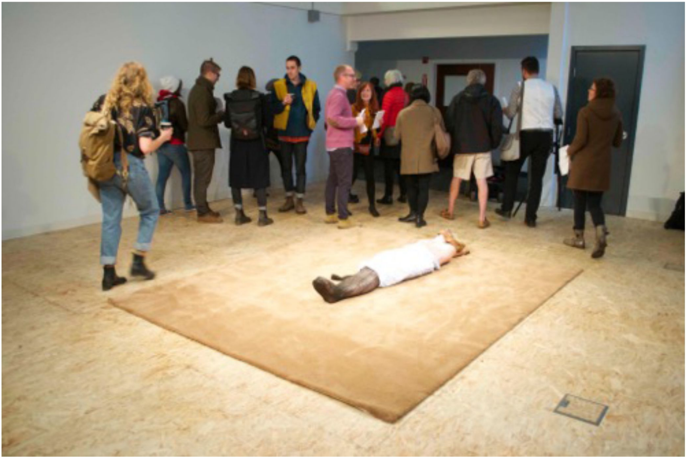
Bound 2 , 2014 103min performance, brown shag carpet, lace Walmart tights, adult baby romper from Baby Jeffy, leather jacket section, ribbon

Spatial depth becomes an examination of interiority as a consequence of this reversal.