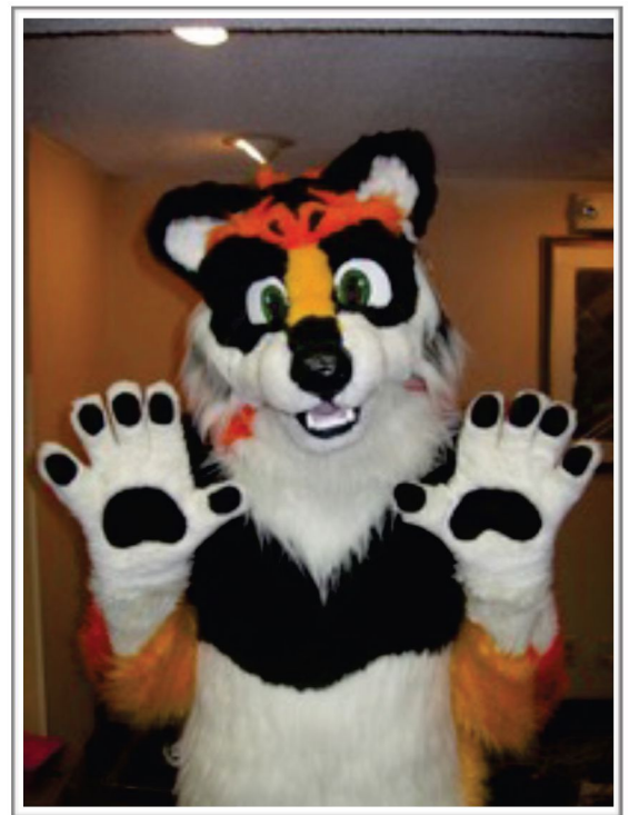
A Furry friend Neopantiger ,