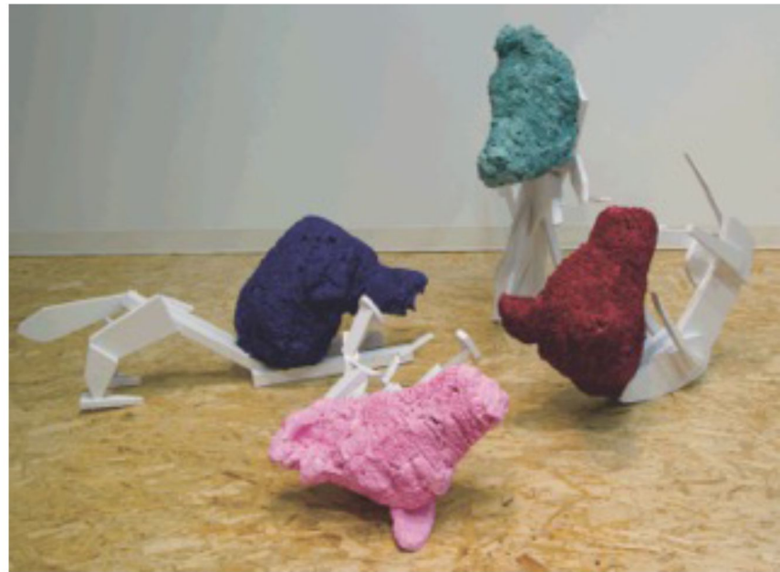
Playing Puppy , 2015 sorry foam, latex paint, wood, dimensions variable

But what motivates people to such great effort to become something other than what they are? Judith Butler would say that the presupposed “original” this question sets up, is a simulacra to begin with. And that gender, at the heart of our identities, is essentially drag; A performance of an idealized self that is unattainable.