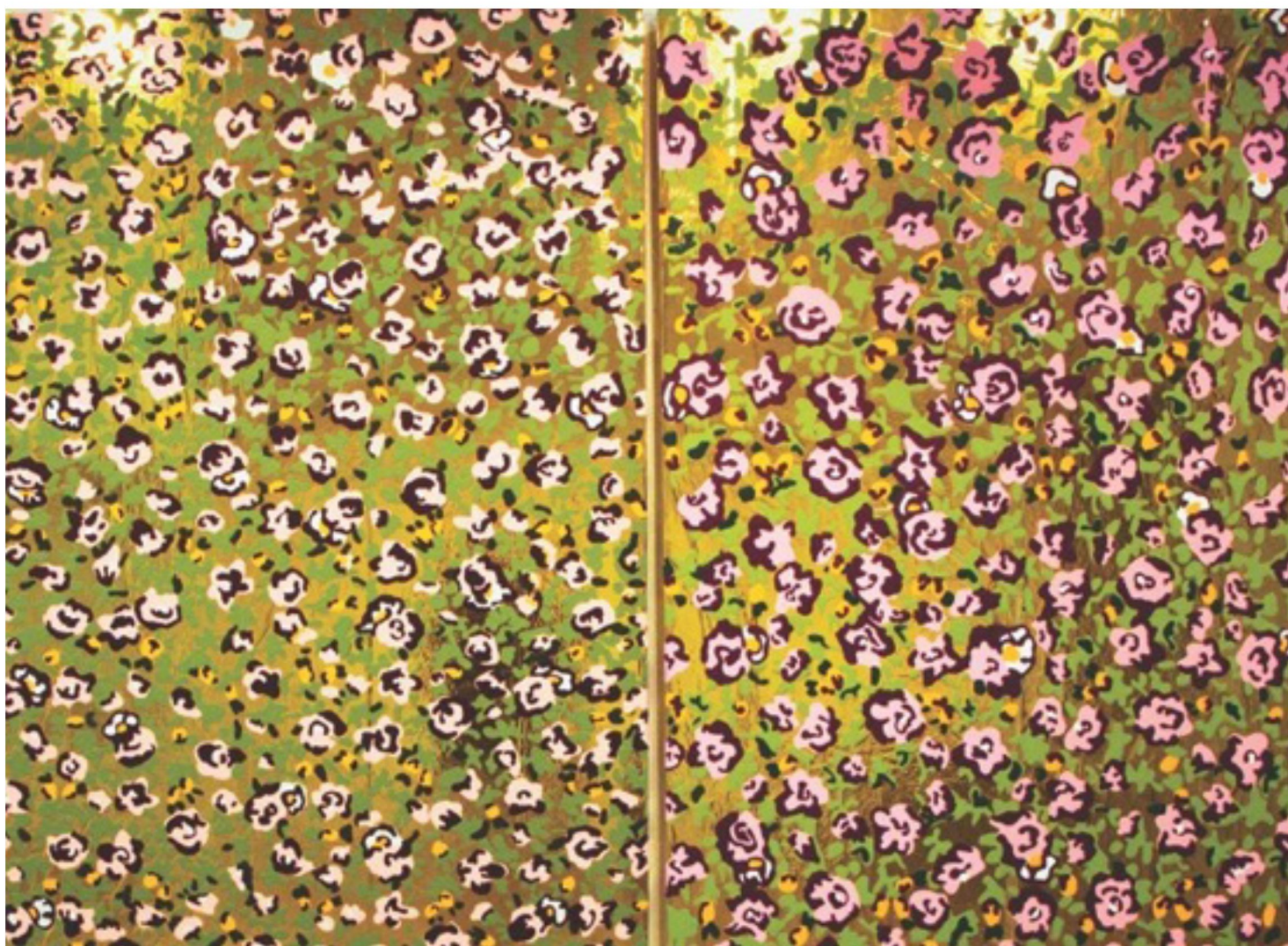
Calico (My first girl clothes) 2015, latex paint, Mylar, industrial foam, 96 x 96 in

recently remarked in an interview, “I want the most personal aspect of my life to be the focus of my work...for it to come from a place of obsession and necessity.” 9 I share this sentiment but it isn’t easy. Until now I was never able to reveal, express, and eventually begin understanding. Satterwhite’s performances are queer, gender fluid, and draw from vouging 10 , a form of dance originating in the Harlem ballroom scene and markably queer, shown in Pairs is Burning (1990) 11 . By performing these actions outside their sanctioned areas of existence (the gay scene) into the streets of New York City, Satterwhite crosses worlds; niche to public. He is one of my very few examples I have that's a model