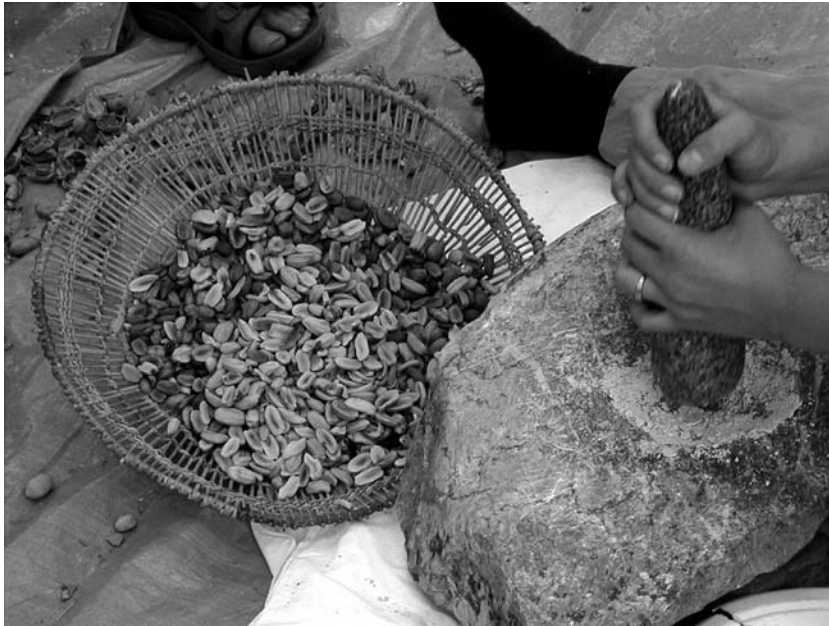
Figure 2.1 Grinding acorns

Spring Chinook have been the single most important food source to decline, but there are at least twenty-five species of plants, animals, and fungi that form part of the traditional Karuk diet to which Karuk people are currently denied or have only limited access. Without salmon and tan oak acorns, Karuk people are currently denied access to foods that represented upward of 50 percent of their traditional diet (see figure 2.1). With the destruction of the once abundant riverine food sources, a significant percentage of tribal members rely on commodity or store-bought foods in lieu of salmon and other traditional foods. Food insecurity within the Karuk Tribe is evidenced by the fact that a survey conducted by the tribe in 2005 found that 42 percent of respondents living in the Klamath River area received some kind of food assistance. 1 One in five