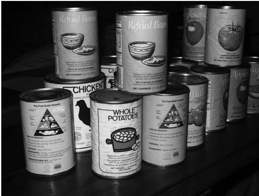
Figure 2.3 Commodity canned foods

Forced assimilation is ongoing today, although its vehicles may be less overt than in boarding schools. Instead as we discussed in the previous section, forced assimilation occurs because a significant proportion of Karuk cultural food management and production practices are illegal. Forced assimilation also happens when Karuk food sources are so depleted that tribal people must eat government commodity foods instead (see figure 2.3). While there is no policy designed to change how Karuk people view and use the land parallel to the ways that boarding schools explicitly enforced “white” behaviors onto Indian people, forced