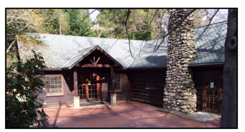
Pioneer Hall in Lithia Park built in 1921 (Painter 2015)

Early morning registration and a continental breakfast will be waiting for you at Pioneer Hall in historic Lithia Park in downtown Ashland at 73 Winburn Way. We prefer that you register for the conference beforehand, but if not, you may register at this time; however, we will only be able to accept cash and checks.