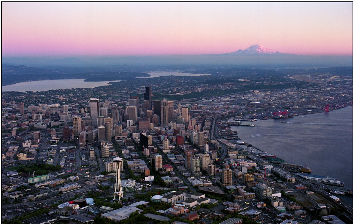
Aerial of downtown Seattle looking southeast towards Mount Rainier.

This year is the 60th Anniversary of the Marion Dean Ross Chapter of the Society of Architectural Historians . In organizing this conference, we realized that Seattle has recently opened an unparalleled number of museums devoted to history in historic buildings, thus the theme for this year's conference became obvious. To celebrate our anniversary year, we have three paper sessions instead of the standard two. And for our final day on Sunday, we have reserved the whole day for Bainbridge Island. We hope you can join us for a conference to remember in Seattle!