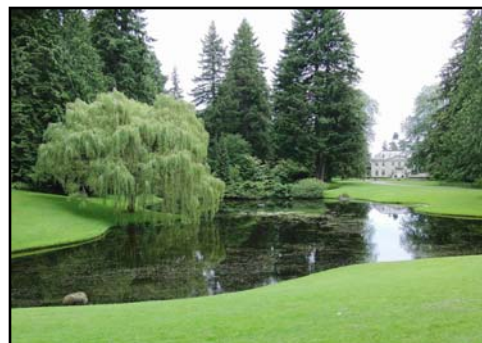
Bloedel Reserve