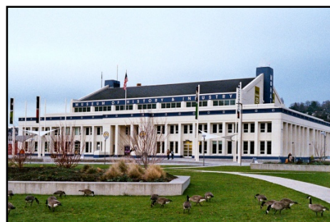
MOHAI