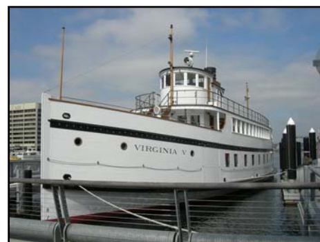
The Virginia V

5:00 – 6:30pm Social Hour and Conference Registration Join us dockside for a social hour with hearty appetizers and a no-host bar on the Virginia V , the last of the famed Mosquito fleet of Puget Sound steamboats and a National Historic Landmark. It's moored at the Historic Ships Wharf next to MOHAI. The registration table will be set up so that you can pick up your conference packet. We prefer that you register for the conference beforehand, but if not, you may register at this time; however, we will only be able to accept cash and checks.