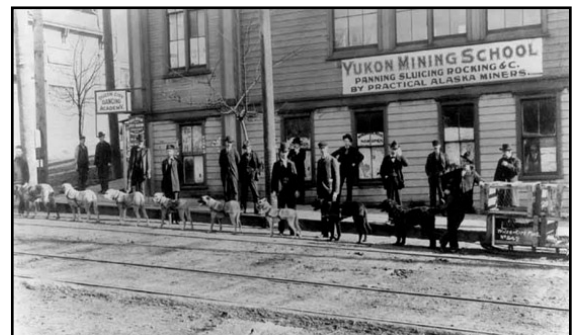
Yukon Mining School in Seattle

The Klondike Gold Rush Museum (a unit of the National Park Service) celebrates not only Seattle's gold rush history but the rebirth of the Cadillac Hotel, which was virtually destroyed in the 2001 Nisqually Earthquake. The museum is located at 319 2nd Ave S close to the Wing Luke Museum.