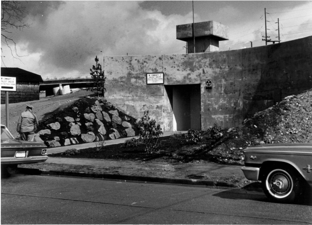
Fig. 4: Shelter façade as seen from Weedin Place, Seattle, on the day of its dedication, March 29, 1963.