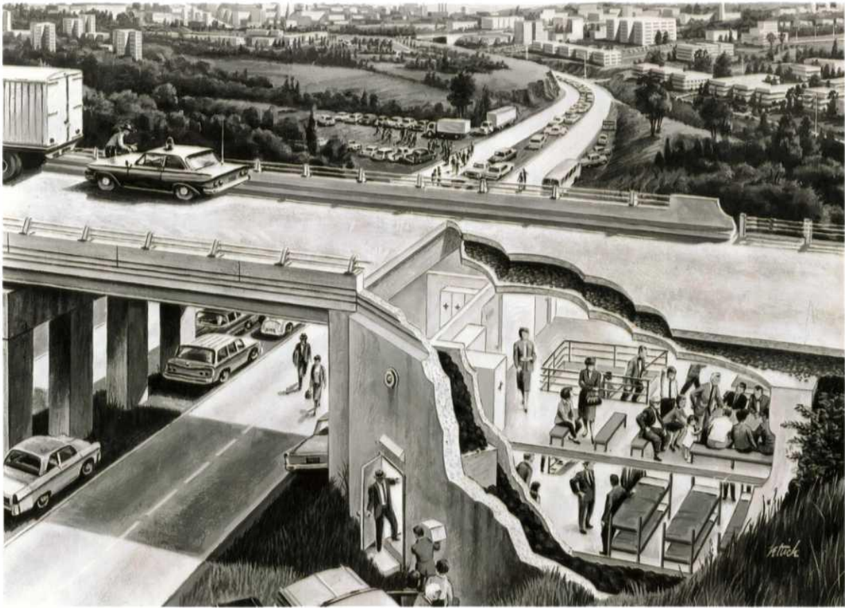
Fig. 1: A prototype highway shelter as envisioned by federal Civil Defense officials.