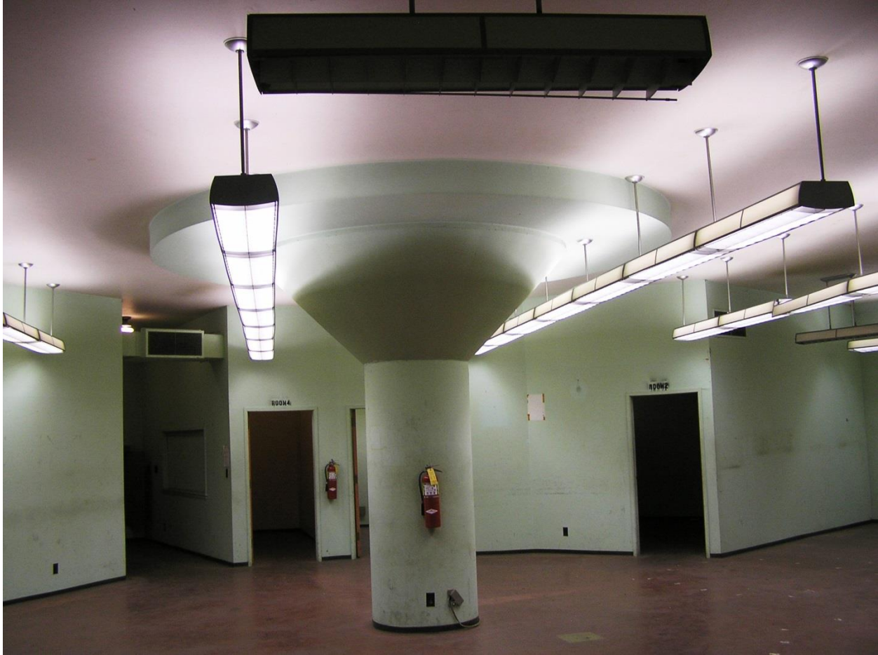
Fig. 5: Fallout shelter main living space, with (left to right) hallway leading to escape tunnel, food distribution room, emergency medical center, and office. Central pillar is in foreground.

According to the shelter's "Utilization Plan," "assignment of specific segments of the population to this shelter is not possible and occupation of available shelter spaces will necessarily be transient. . . . Since no specific segment of the population has been assigned to this facility, entry will not be denied to anyone until such time as the maximum occupancy has been reached." Shelter occupants would be permitted to bring in only items that "would increase shelter habitability," as well as medicines and "special health foods." "General purpose items will be turned into general supply for possible later re-issue for the good of all. Animals and pets will not be permitted into the shelter for obvious health reasons." "When the maximum occupancy of the shelter has been reached, . . . the manager will cause the doors to be closed and locked. Any persons remaining outside the shelter will be directed to proceed to the next nearest public shelter." No other public shelter is known to have existed in the vicinity, however. xvii